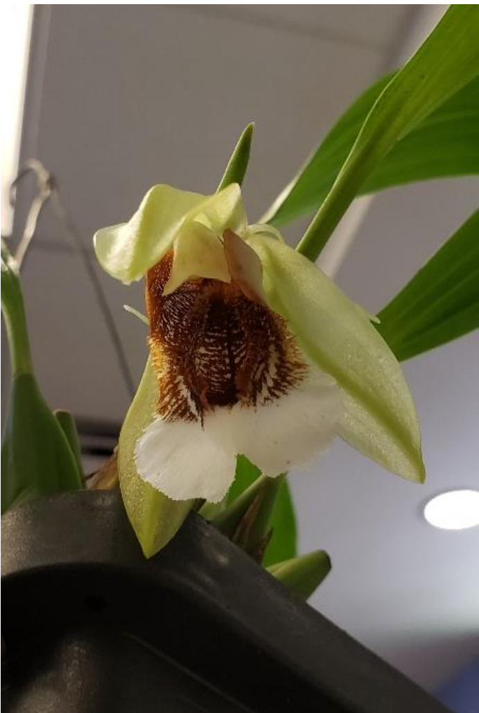
Coel. xyrekes and Coel. speciosa