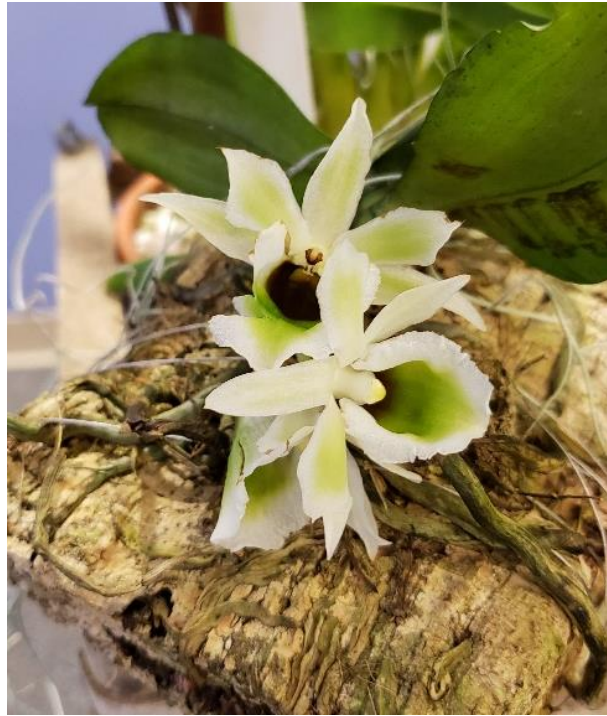
Echn. rothschildiana x self