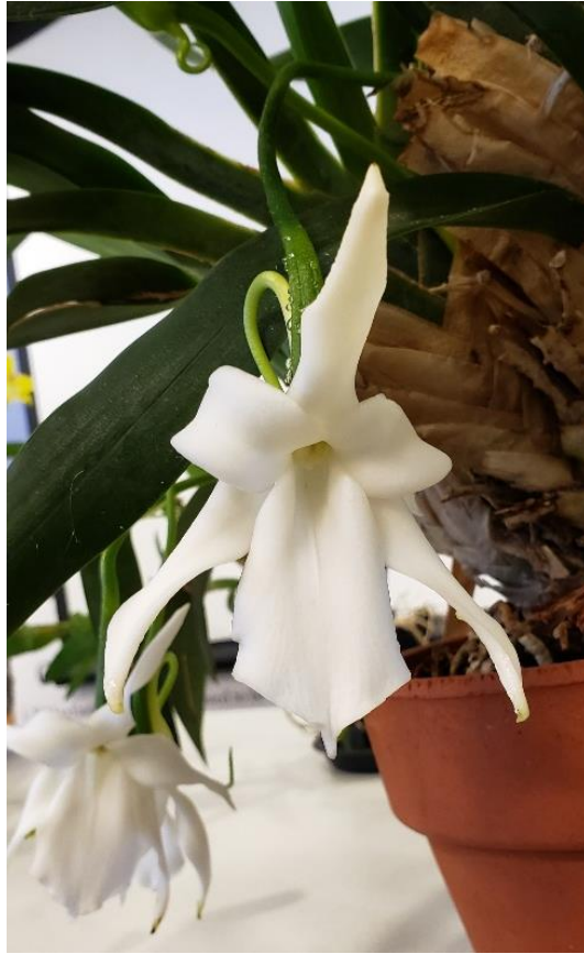
Angcm. magdalenae x sib.