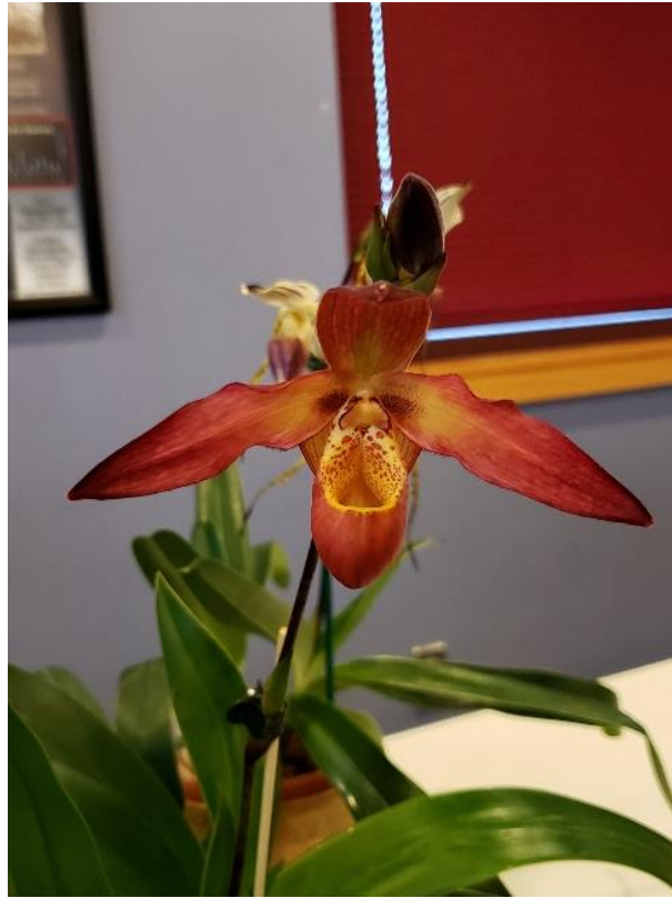
Phrag. Inca Embers