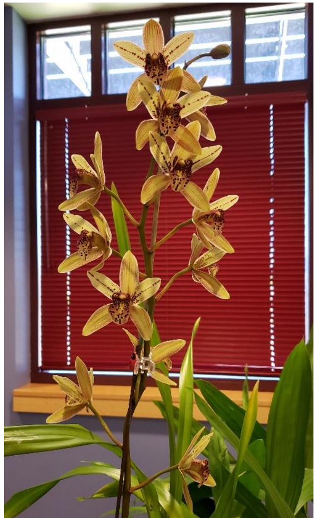
Mps. phalaenopsis and Grcym. Pakkret Adventure