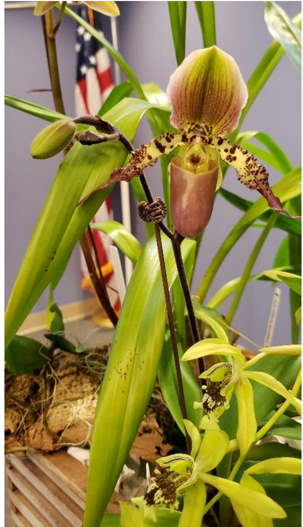
Coel. pandurate and Paph. Myra