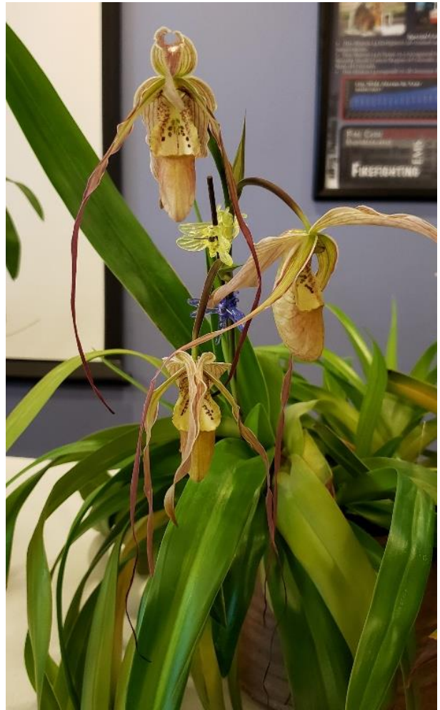
Paph. stonei and Phrag. Paul Eugene Conroy