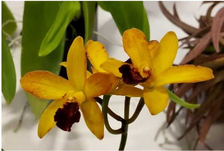
Ctna. Flying Colors 'Mendenhall' HCC/AOS