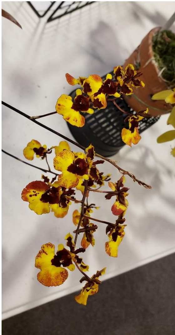
Tolu. Keysha 'Oka' HCC/AOS and Tolu. Genting Orange?