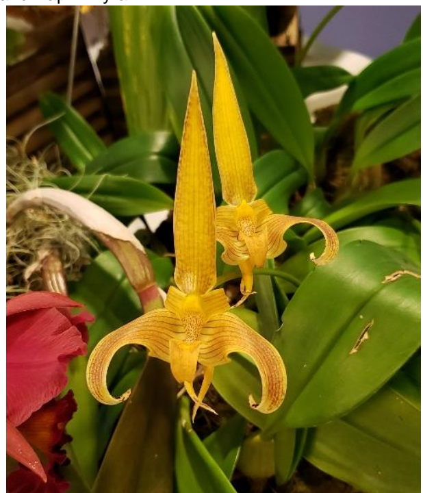
Rlc. Sparkling Jewel and Bulb. lobbii