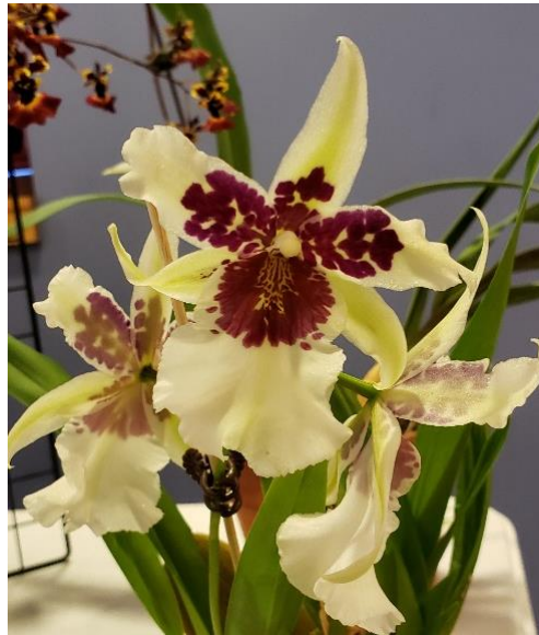
Roger's Rlc. Big Shot 'Hilo Sparkle'