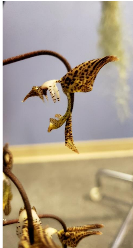
Gga. maculate and close-up of its bloom