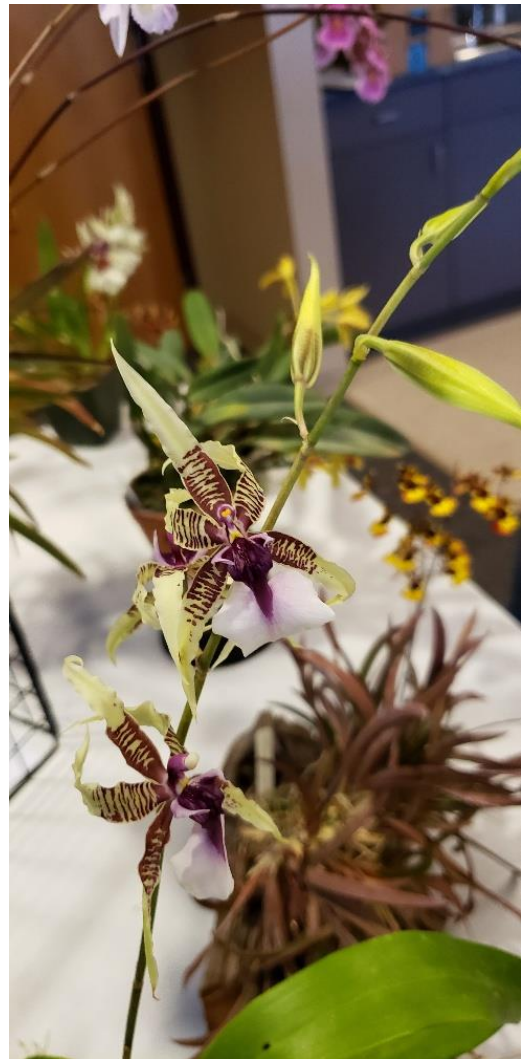
Onc. Odorous Princess 'YH Twinstar' and Onc. hastilabium