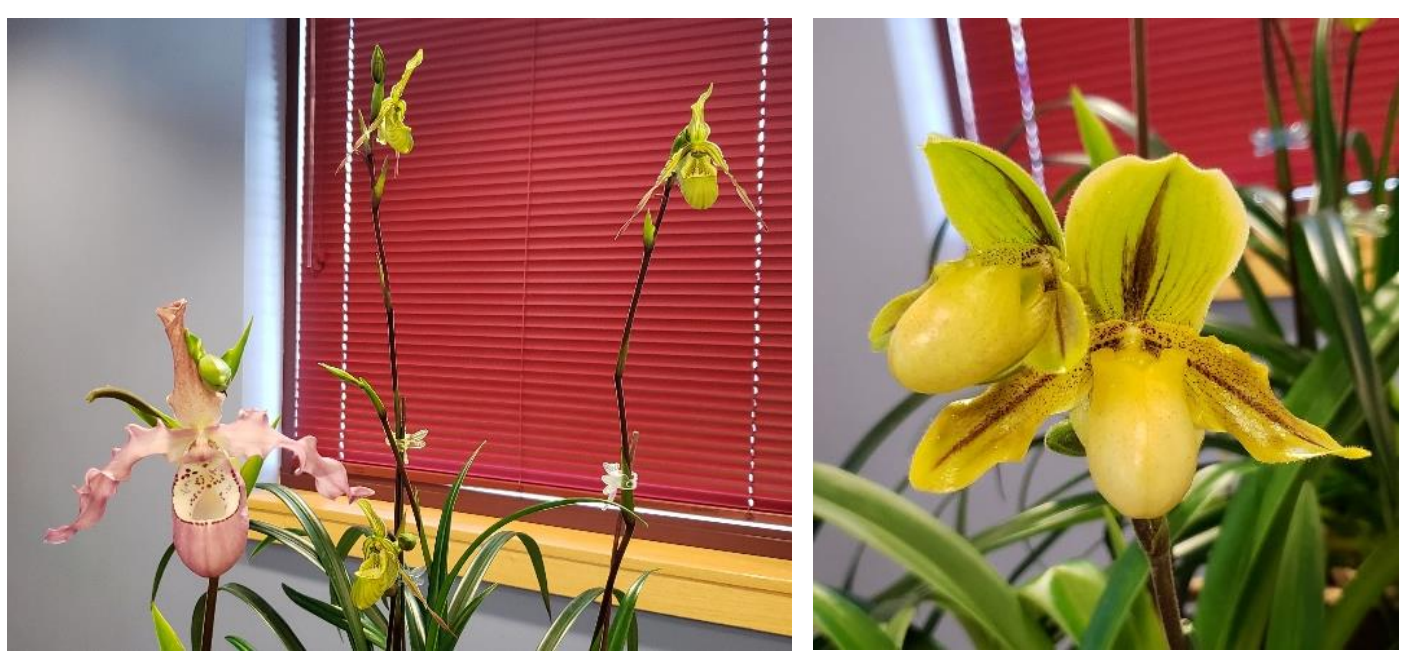
Phrag. Peruflora's Saltimbanco, Phrag. pearcei 'Amazon Queen' HCC/AOS' and Paph. Druid Spring