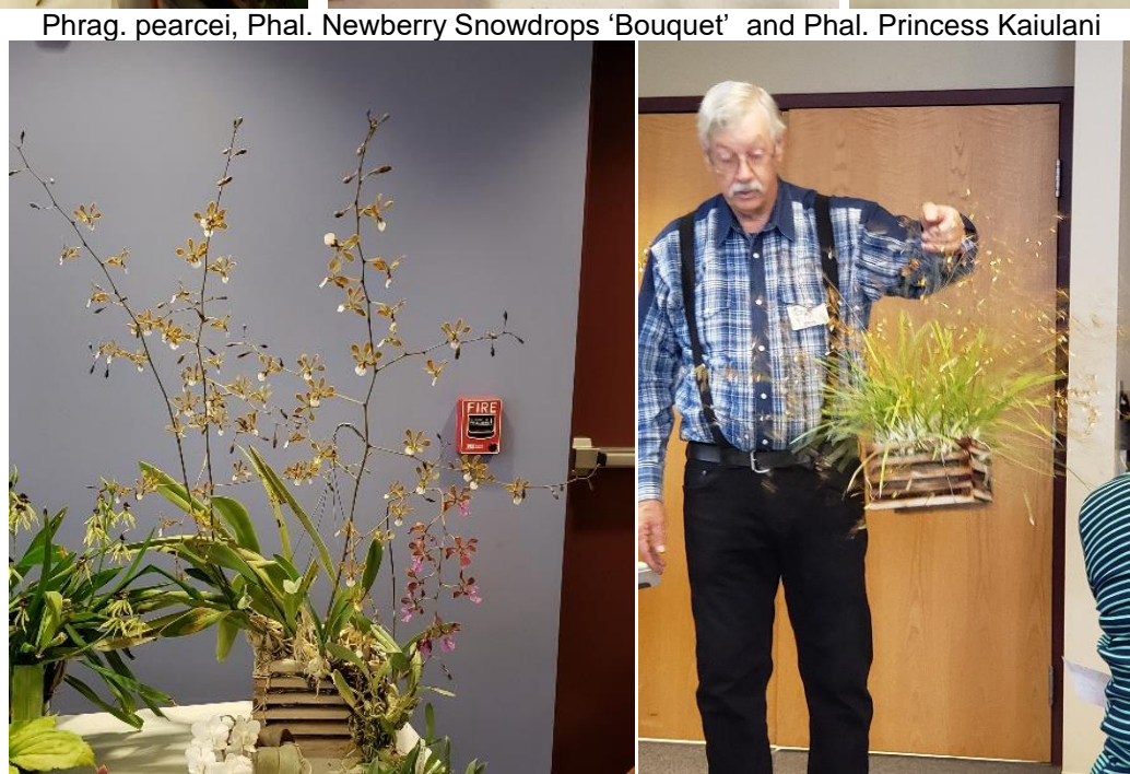
E. spatella and E. nematocaulon