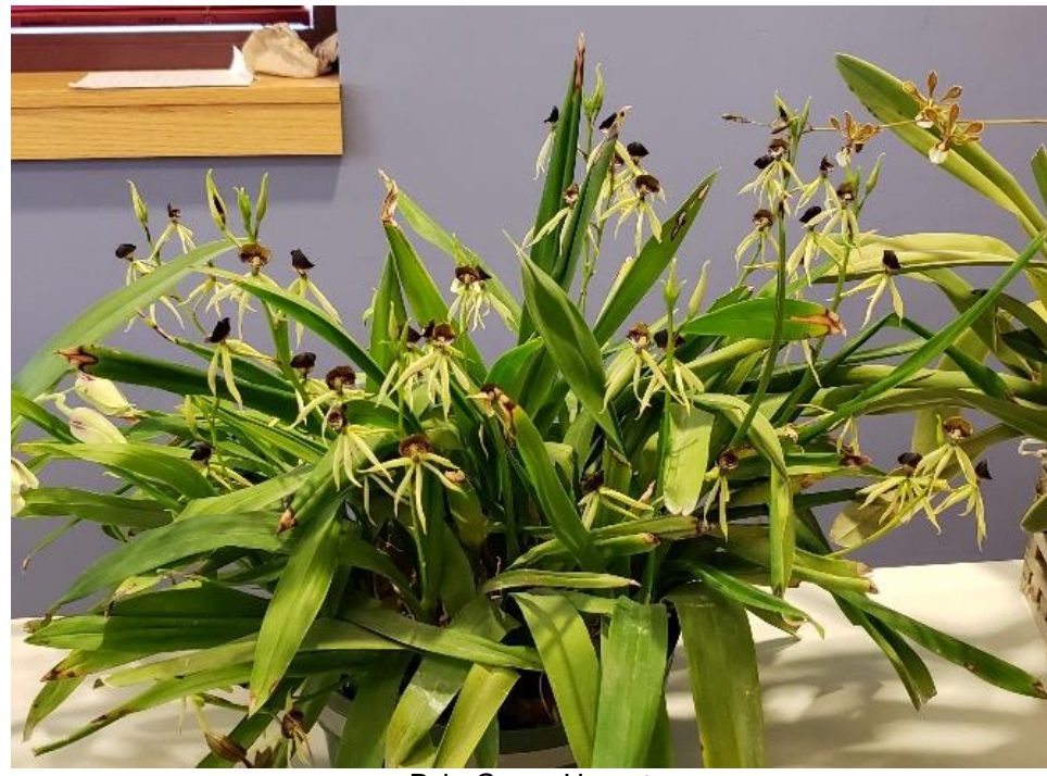
Psh. Green Hornet