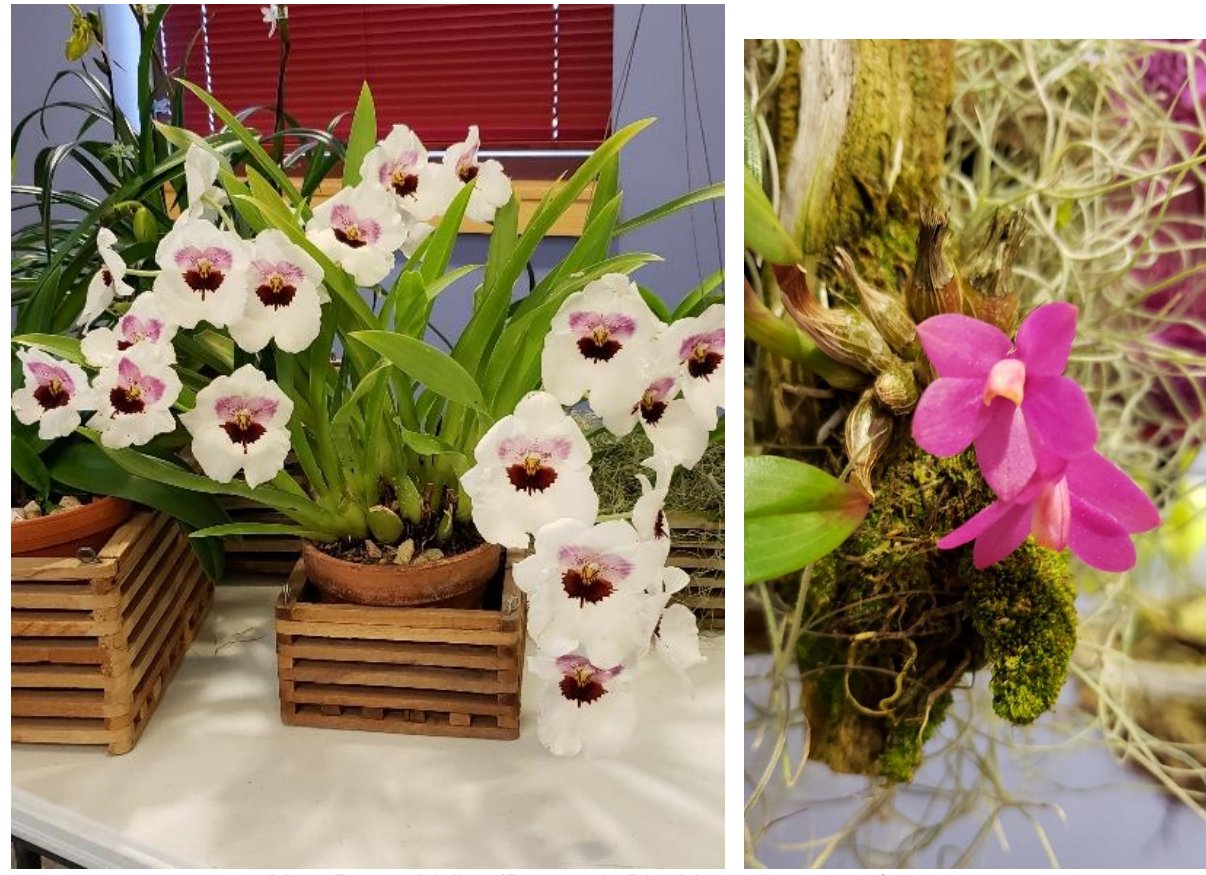
Mps. Rogue Valley 'Burgundy Blush' and Den. laevifolium