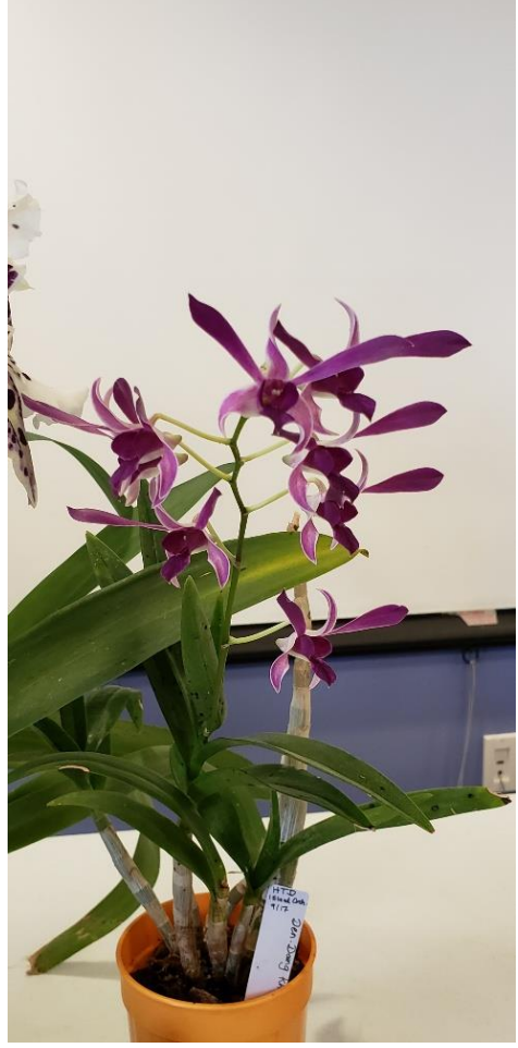
V. Periwinkle 15201, Alcra. Tropic Lily 'Hilo Space Ship' and Den. Doing Khom