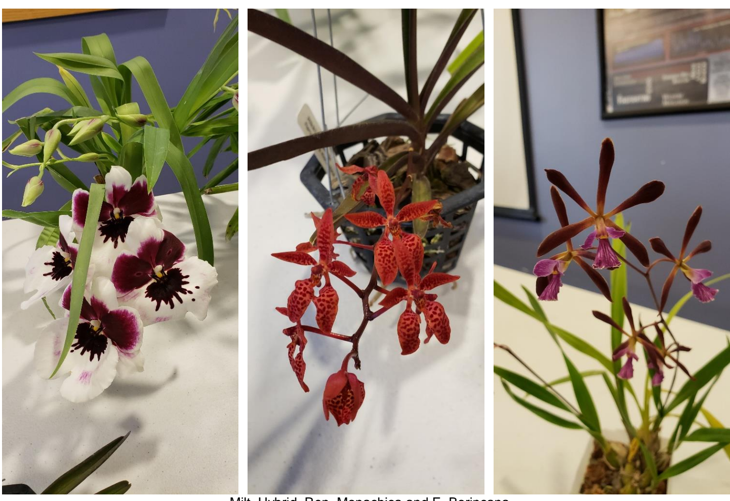
Milt. Hybrid, Ren. Monachica and E. Borincana