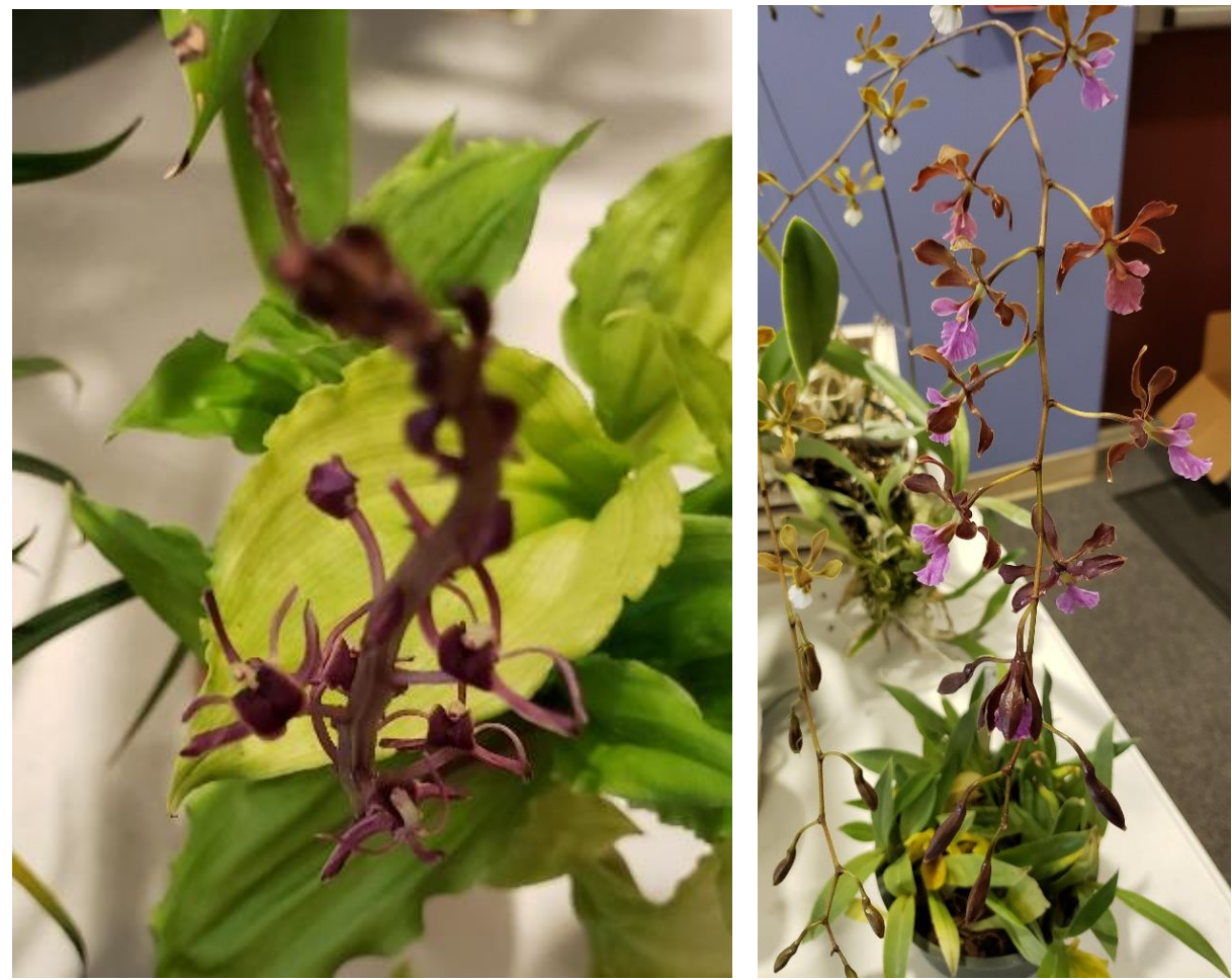
Lip. henryi and E. hanburyi