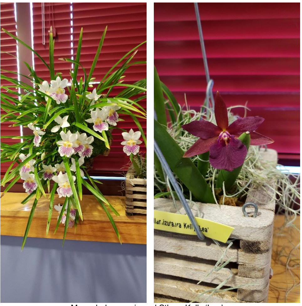
Mps. phalaenopsis and Stlma. Kelly 'Lea'