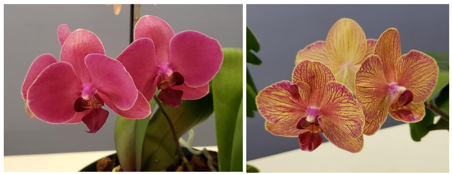
Two Phal. Hybrids grown by Cassie and Aurora Wright