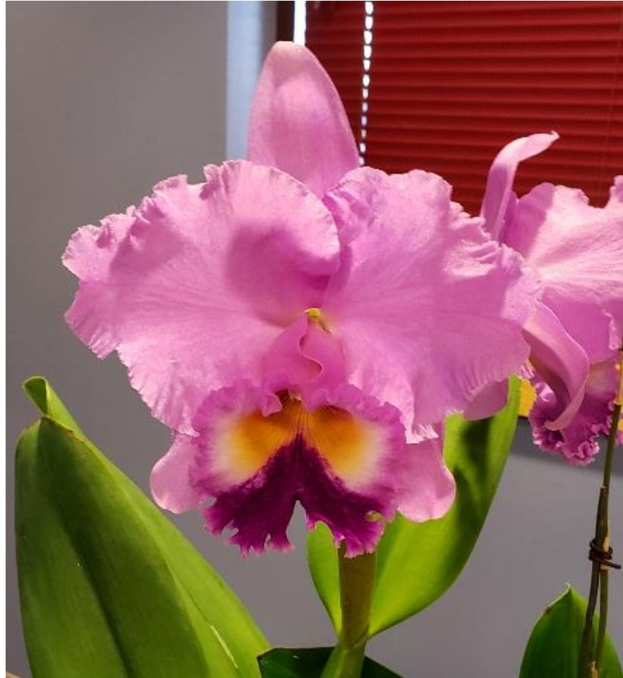
C. Volcano Queen