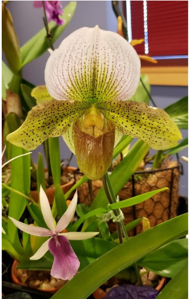
V. sanderiana , Brat. Estrelita 'Sweet Senorita' and Paph. Big Green Bird