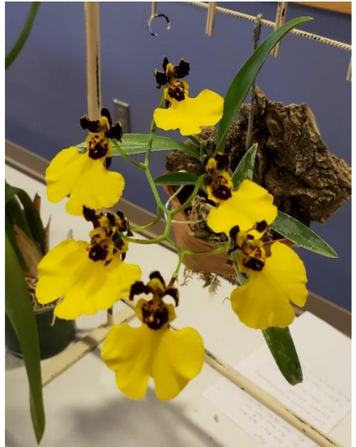
C. Love Psychedelic Orchestra and Gomesa Moon Shadow 'Tiger Tail' AM/AOS