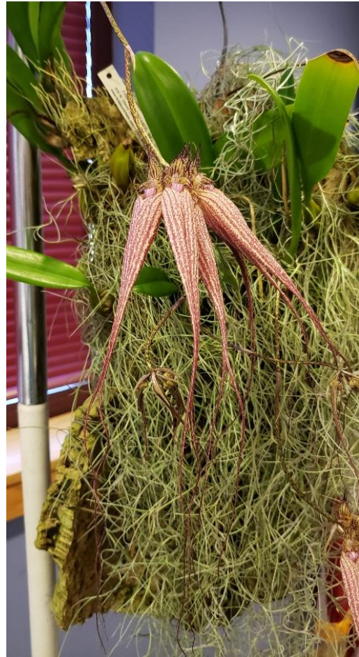
Pyp. papilio 'Yellow Bird' and Bulb. Elizabeth Ann 'Buckleberry' FCC/AOS