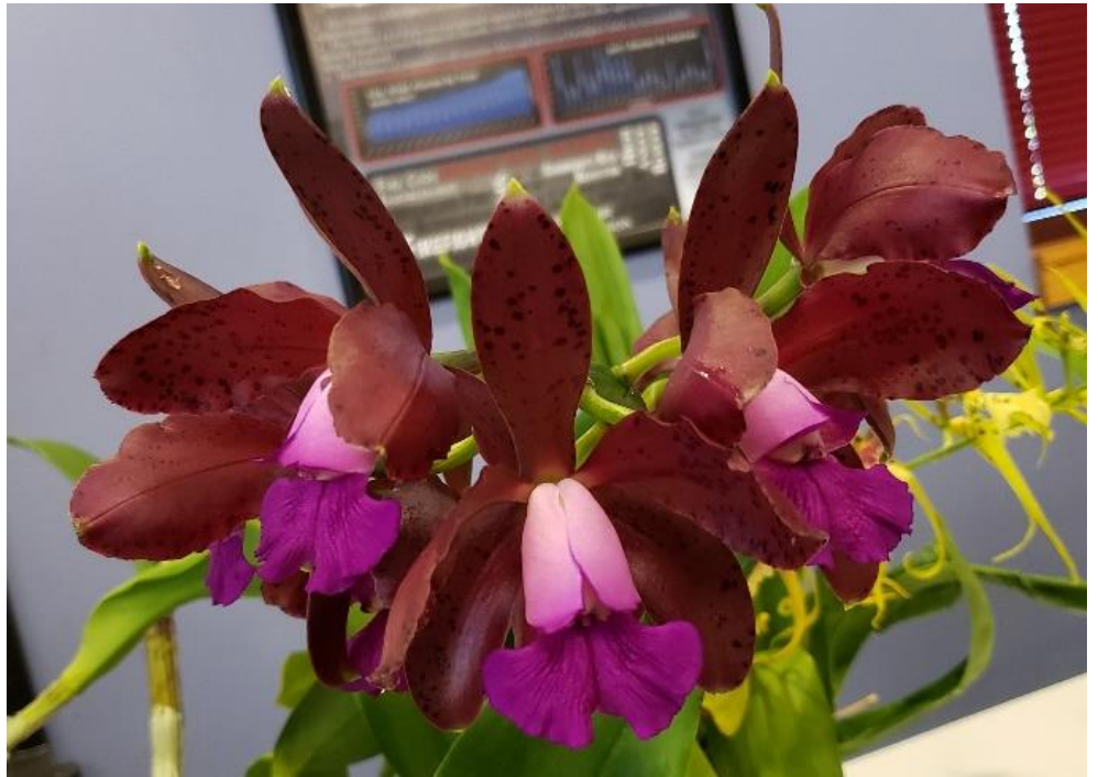
Brassia Rex 'Sakata' AM/AOS and C. Maui Plum 'Volcano Queen' AM/AOS