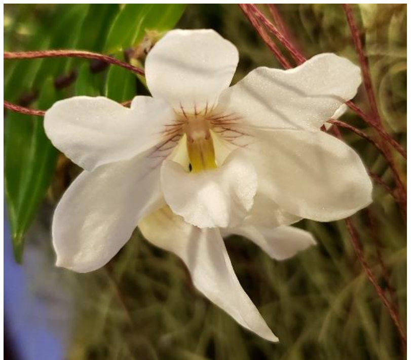
Paph. Meda Ballard 'Pikes Peak' AM/AOS and Den. auriculatum