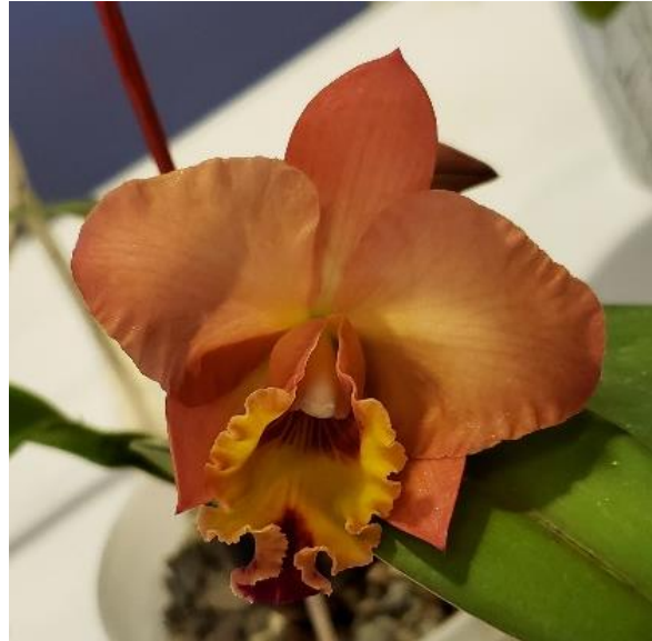
Roger's Rlc. (Delta King x Delta Mist)