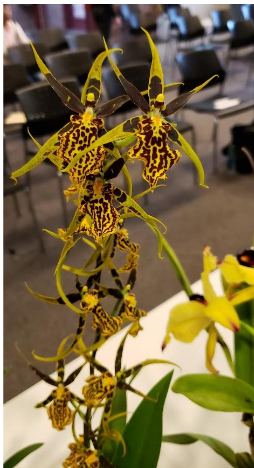
Brsdm. Nittany Gold 'Dr. John' AM/AOS and Bcd.Gilded Tower 'Mystic Maze' HCC/AOS