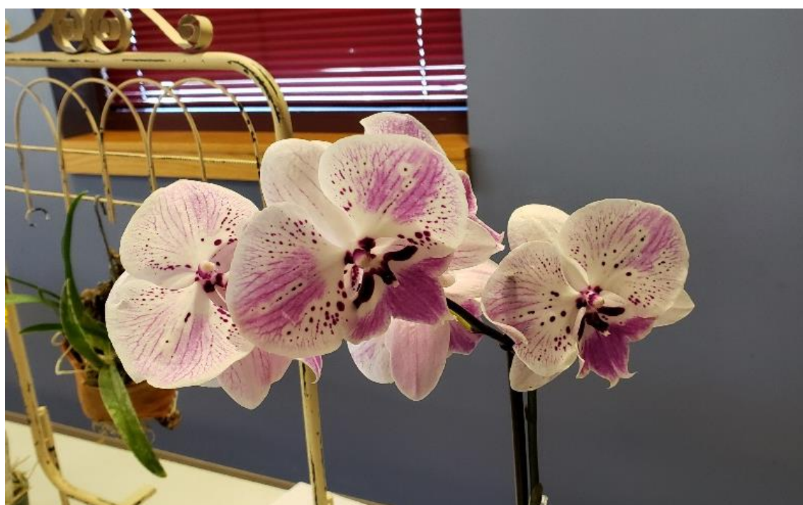
Phal. Lioulin Pretty Lip