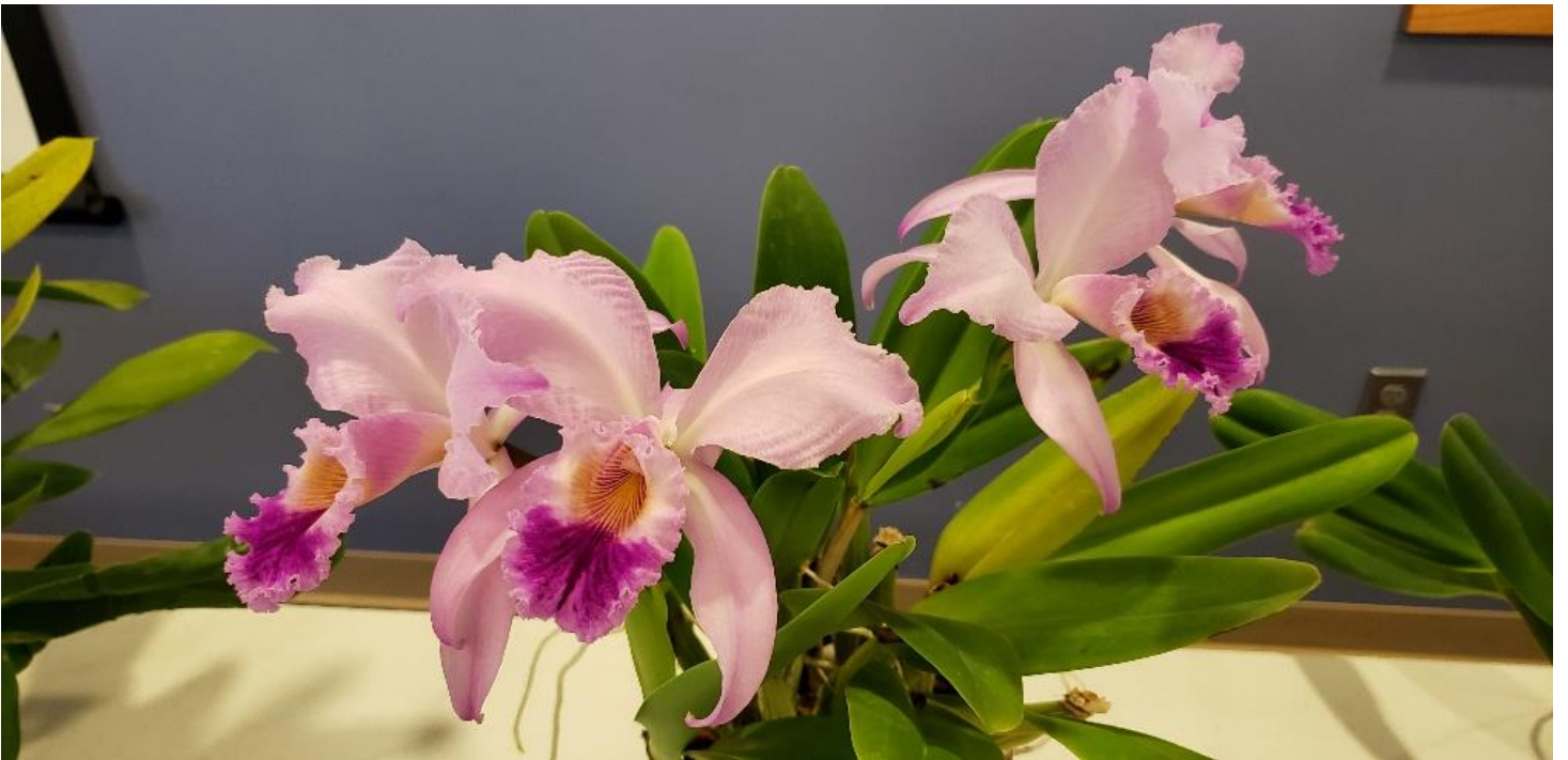
C. gaskelliana 'Lines Dark' x self