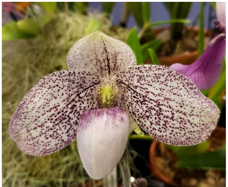
C. forbesii and Paph. Catherine Briois