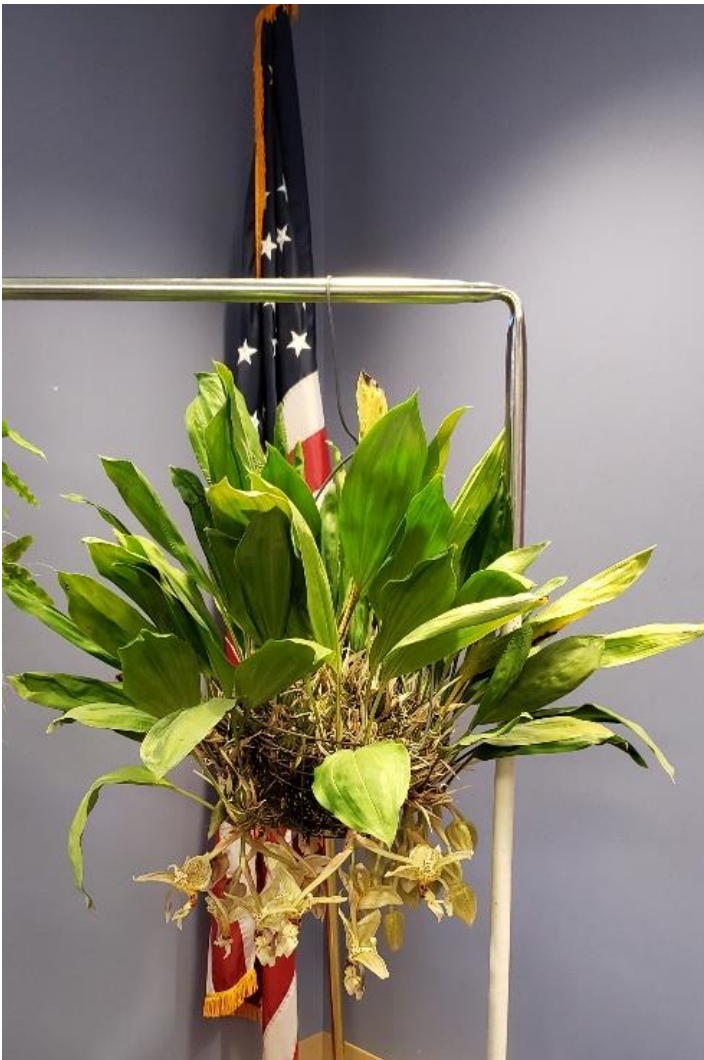
Stan. oculata – to the left is the entire plant and below is a close-up of the blooms