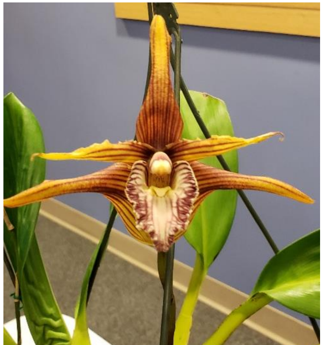
Cym. Pink Paradise and Max. striata