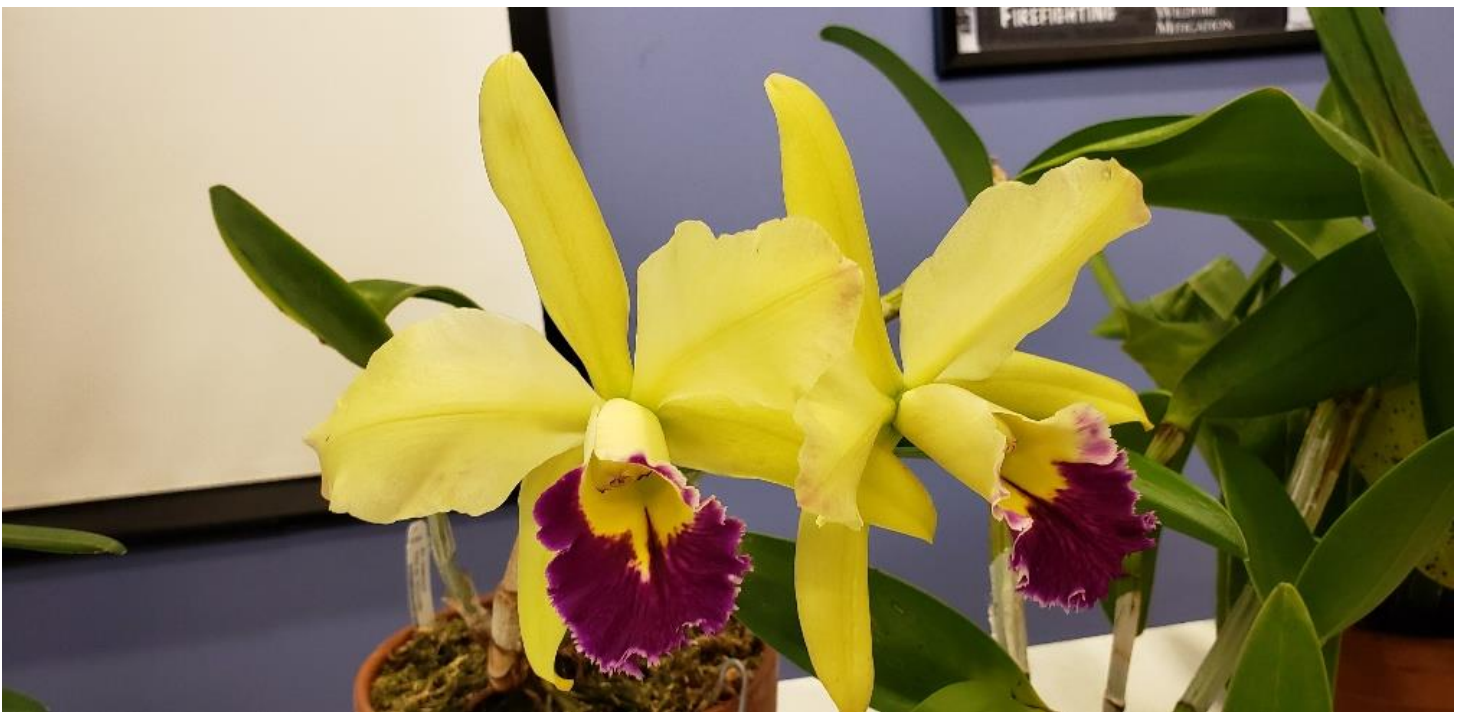
Blc. Greenwich 'Killarney' AM/AOS