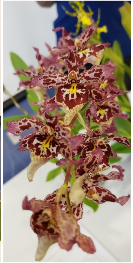
Euph. petersii, Alkra. Pacific Nova 'Okika' and Ons. Eye Candy 'Pinkie'