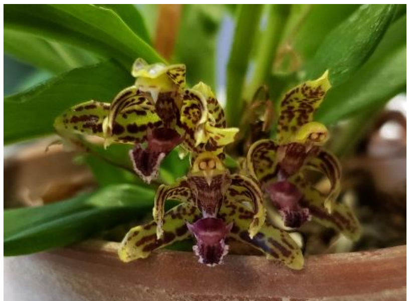
Hal. retrocalla and Kefst. parvilabris