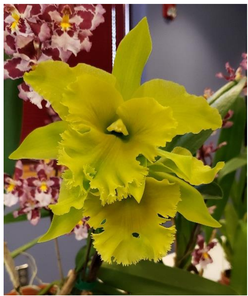
Rlc. Ports of Paradise 'Gleneyrie's Green Giant' FCC/AOS