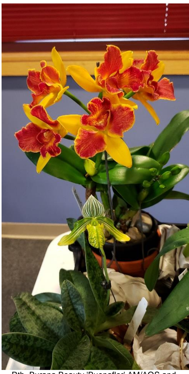
Rth. Burana Beauty 'Buenaflor' AM/AOS and Paph. venustum (f. album)