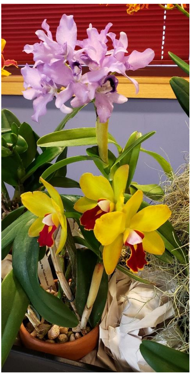
C. bowringiana (f. coerulea) and C. June Bug 'Venice Sunshine' AM/AOS