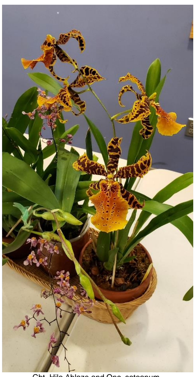
Gbt. Hilo Ablaze and Onc. sotoanum