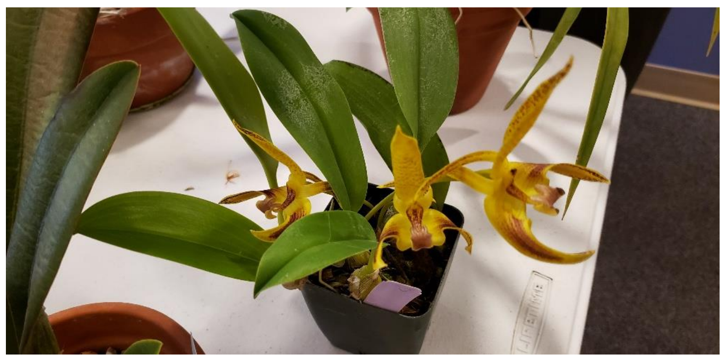
Bulb. Wilmar Galaxy Star