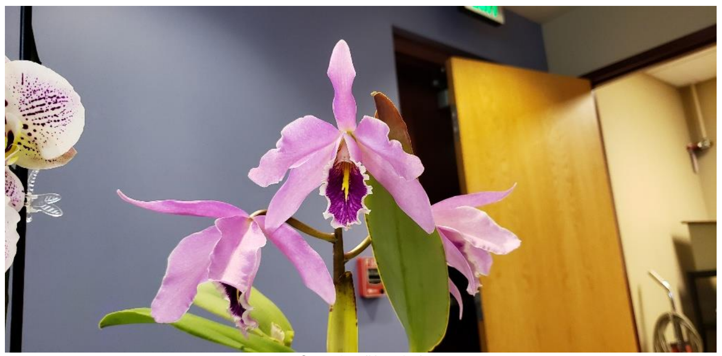
C. maxima 'Hercules'