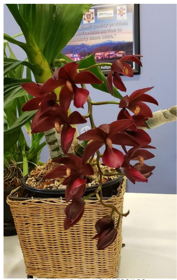
Cycd. Wine Delight 'J.E.M.' FCC/AOS