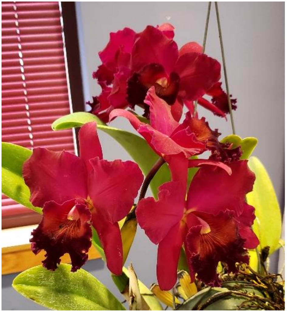
Rlc. Walnita Char 'Walakea'