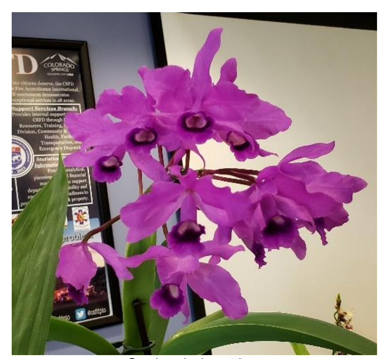
Gur. bowringiana #2