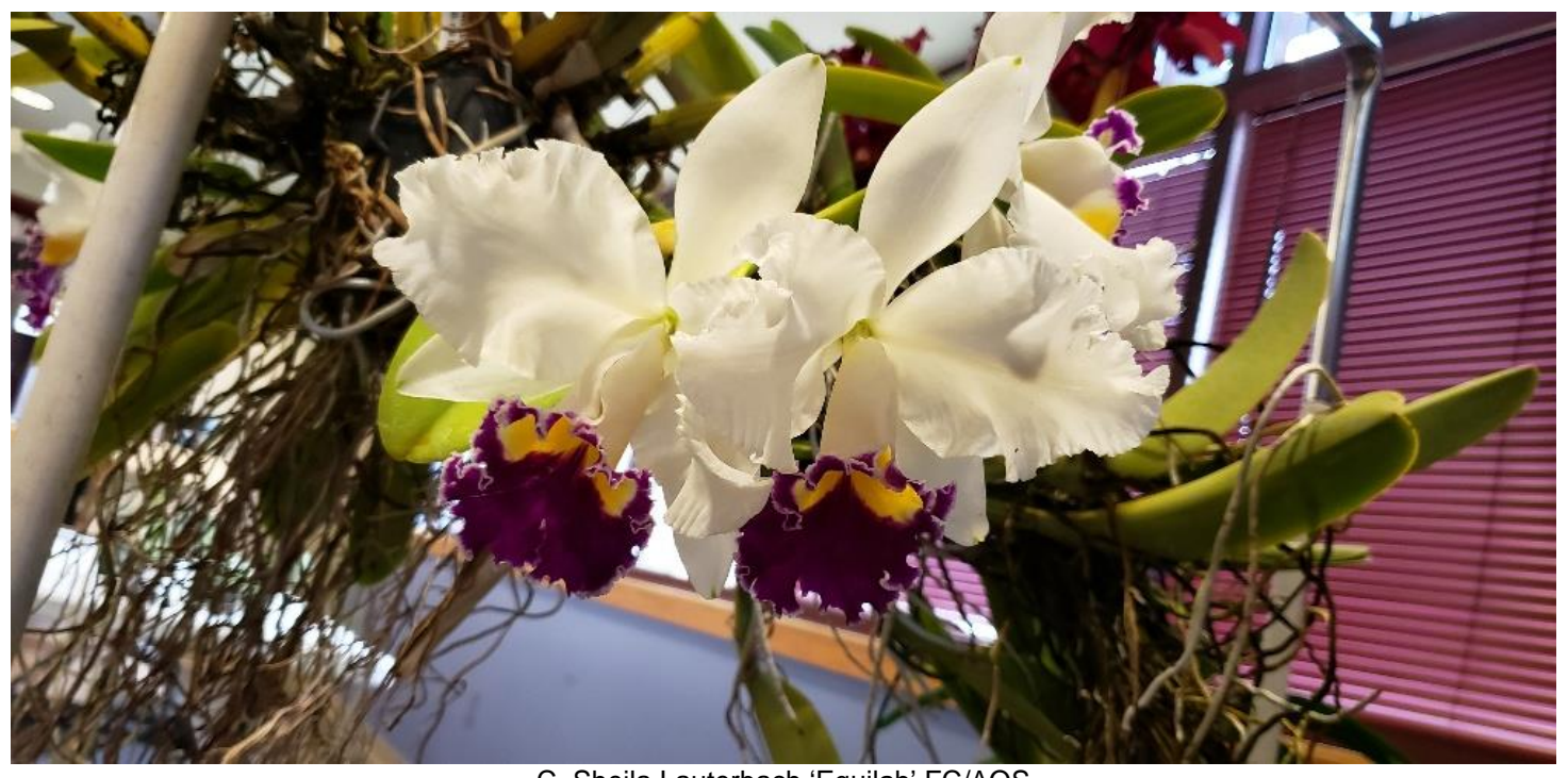
C. Sheila Lauterbach 'Equilab' FC/AOS