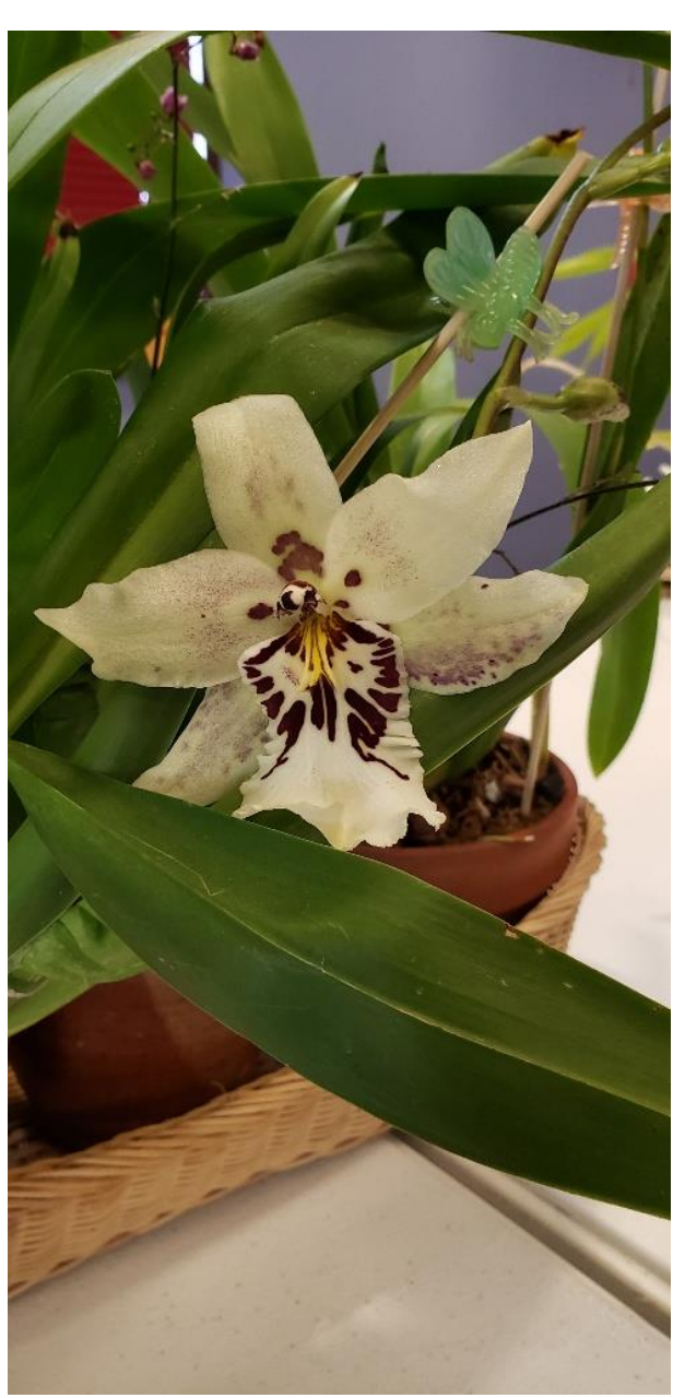
Alcra. Memoria Khun Krairit 'Stargazer'