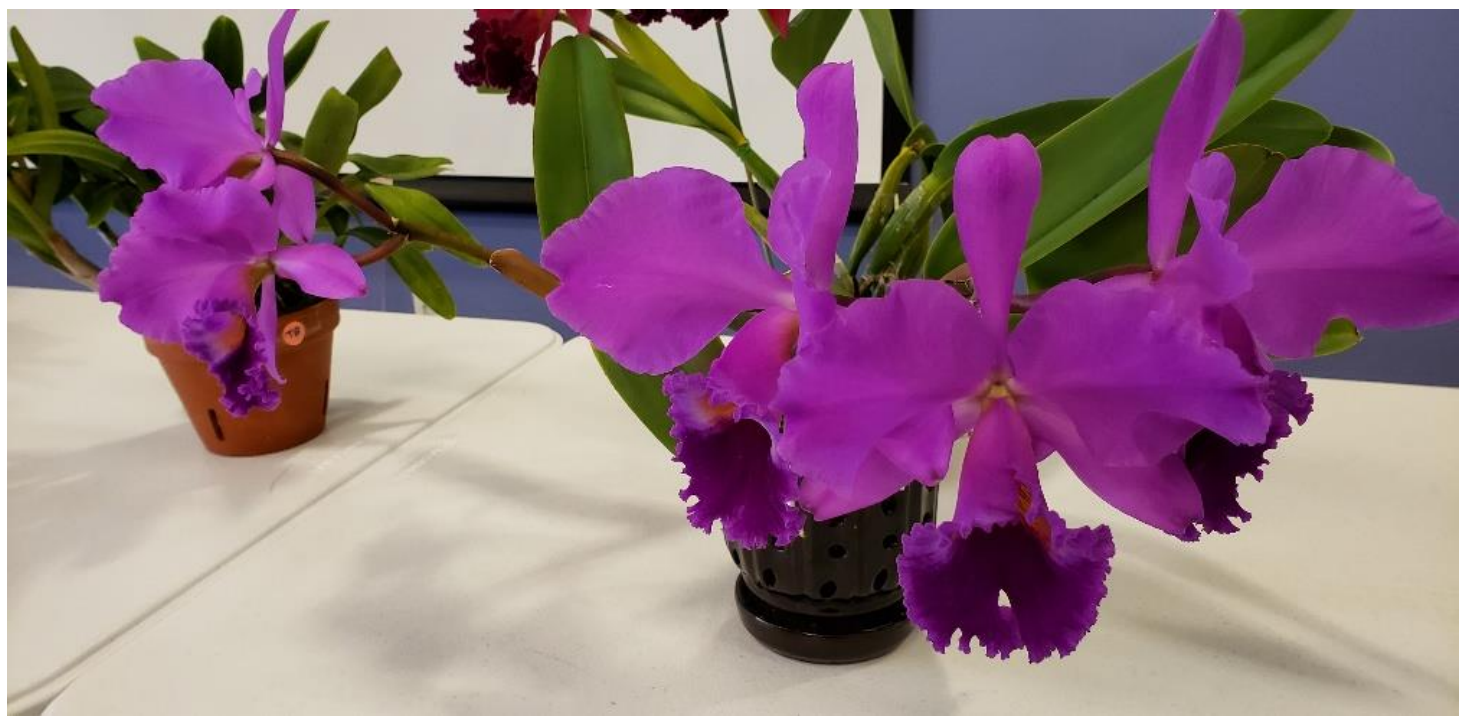
C. labiata (f. rubra) 'Schuller's' x self