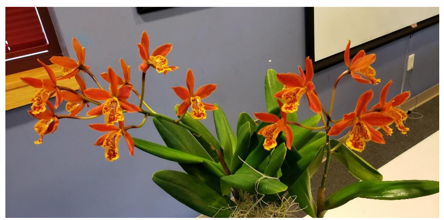
Ett. Volcano Trick 'Hawaii'