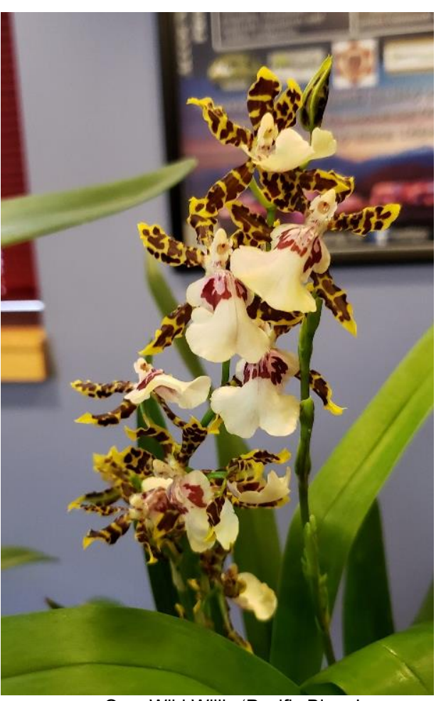
Onc. Wild Willie 'Pacific Bingo'