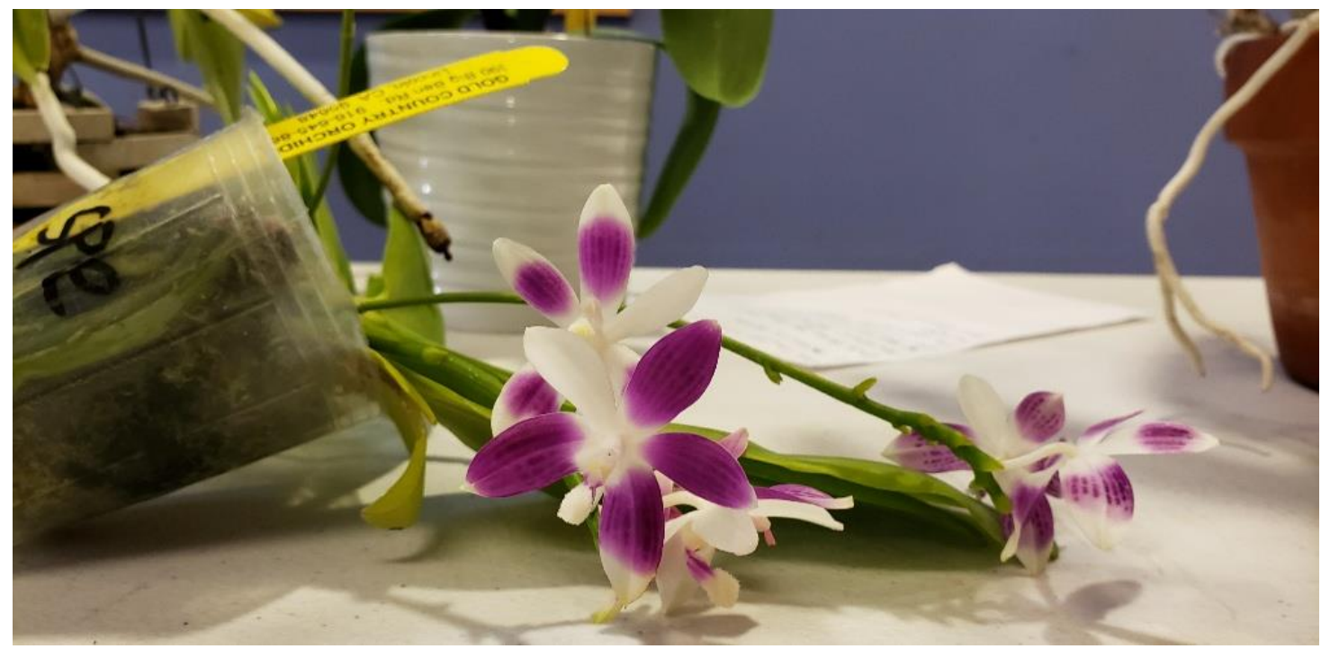
Phal. speciosa 'Mainshow'