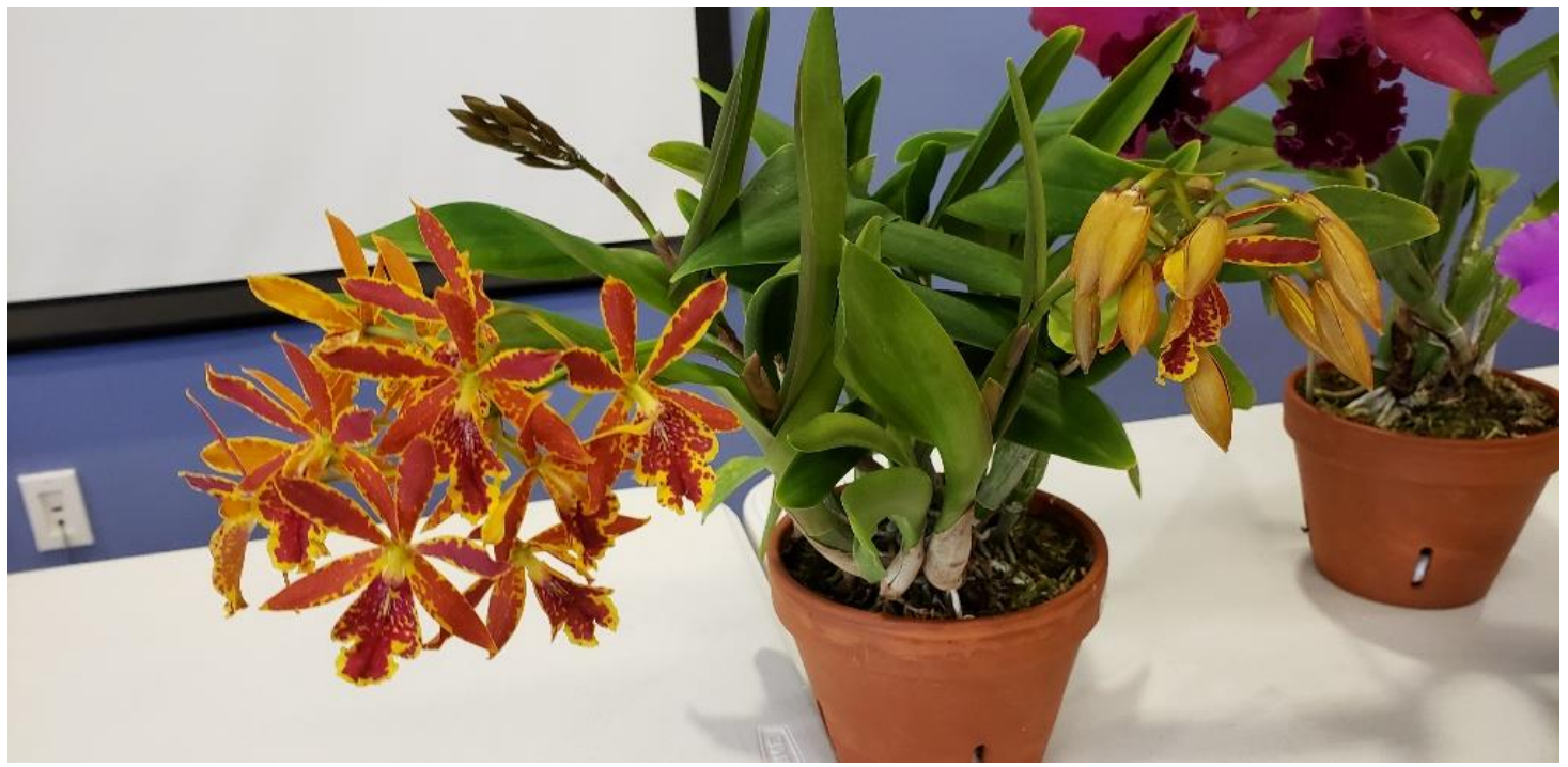
Epc. Volcano Trick 'Paradise'