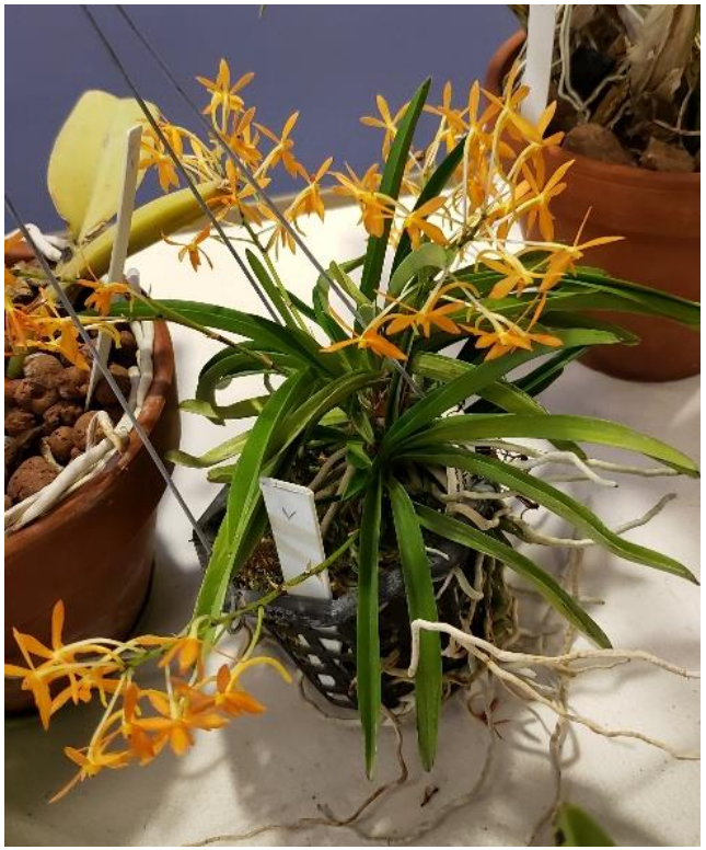
Aerdv. Liberty Creek