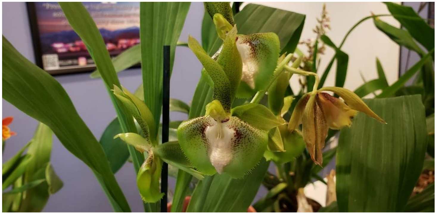
Ctsm. (Portagee Star 'Brian Lawson's Sunrise' HCC/AOS x lucis 'Dana's Bird of Paradise' AM/AOS)