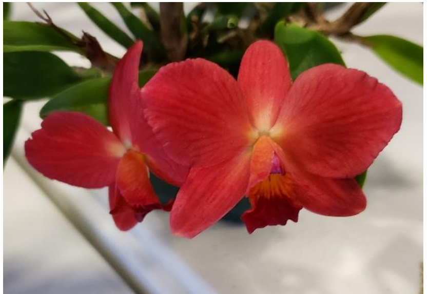
Lsz. Lava Burst 'Puanani' AM/AOS and Rlc. Alma Kee 'Tipmalee' AM/AOS