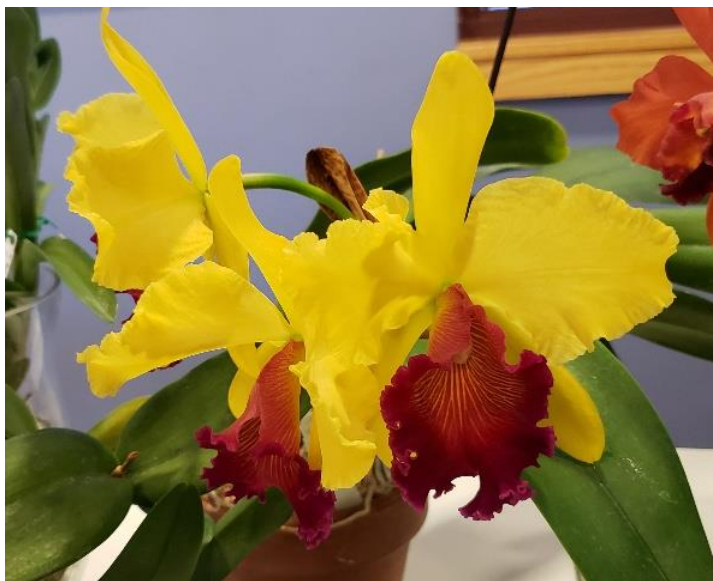
C. Little Flame