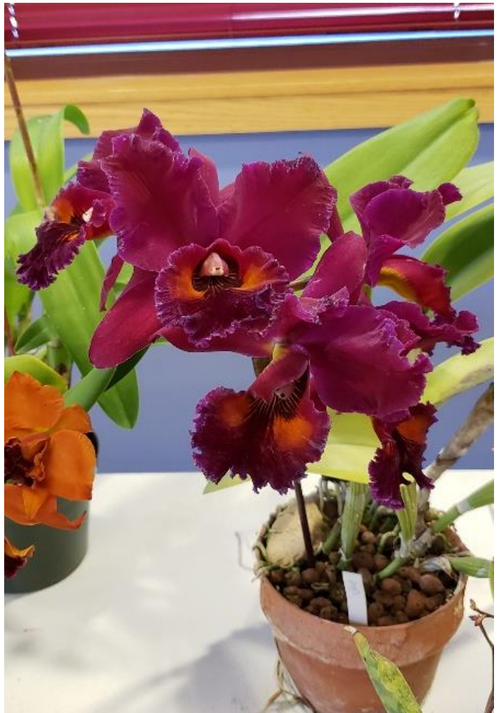
Paph. purpuratum and Rlc. Edisto 'Newberry' HCC/AOS