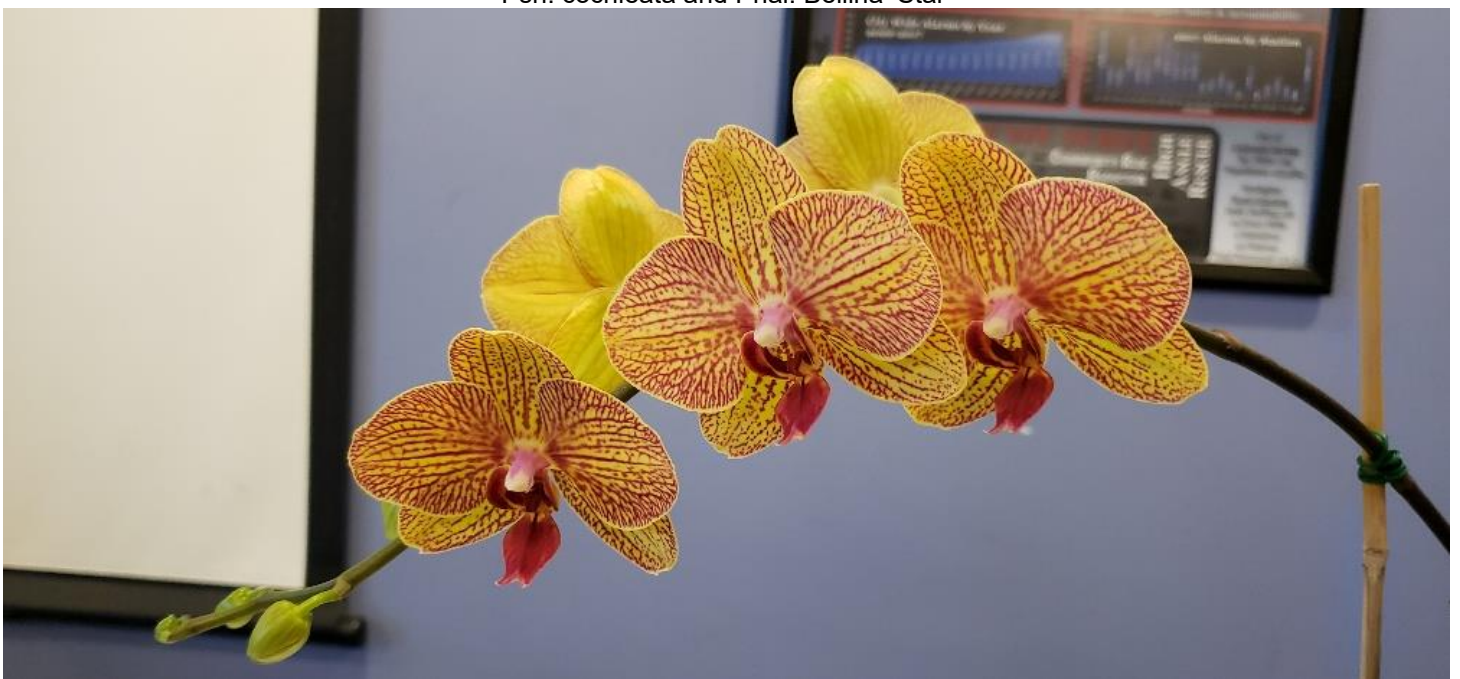
Phal. KV Beauty 'Golden Treasure'