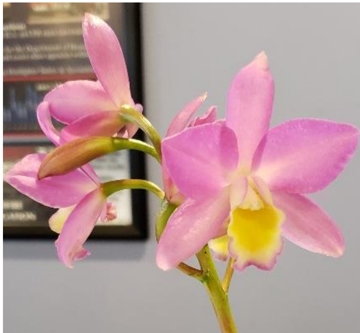
Tolu. Pink Panther and C. Subogery