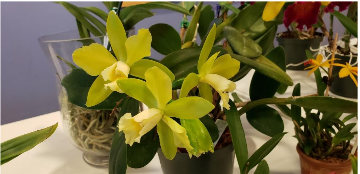
Rlc. Hawaiian Passion 'Carmela' HCC/AOS