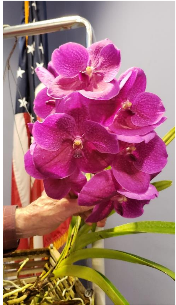
Phal. hybrid and V. hybrid