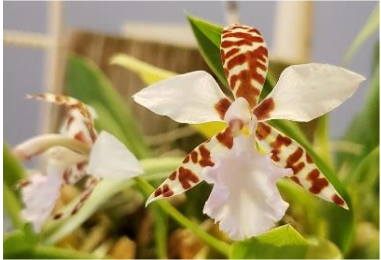
Roger's Rst. ehrenbergii