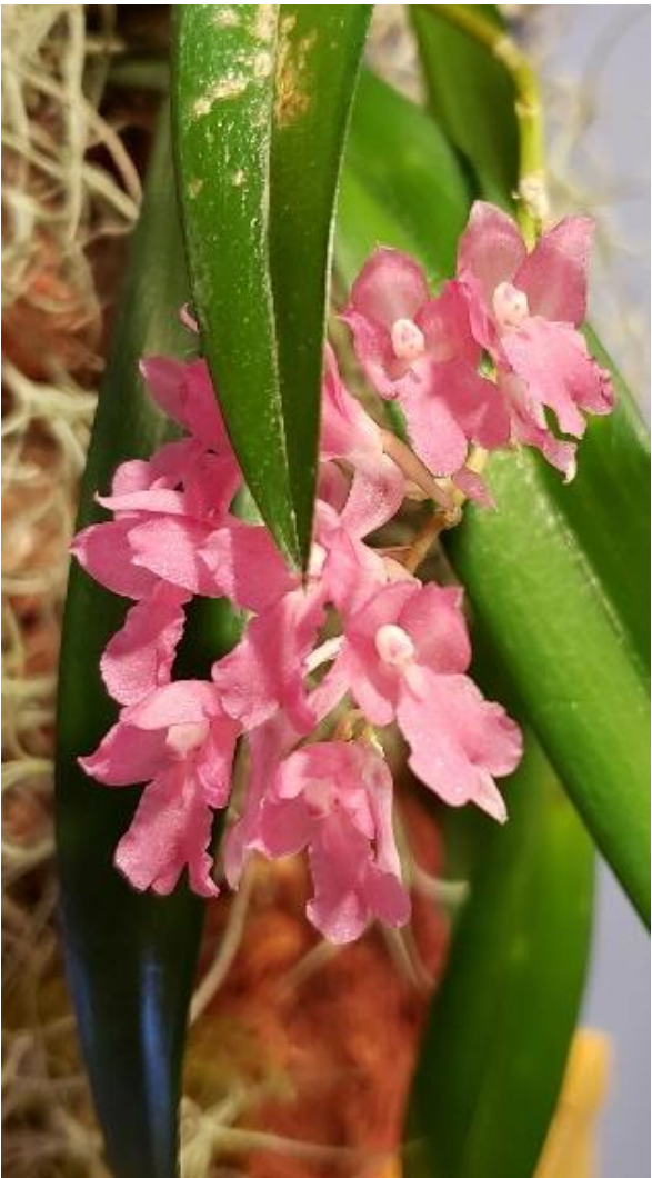
Onc. Wild Willie 'Pacific Ringo' and Rdza. lanceolata