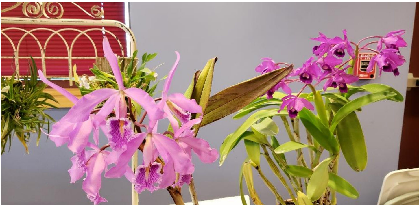
C. maxima (f. rubra ) 'Cerro Verde Especial' and C. bowringiana