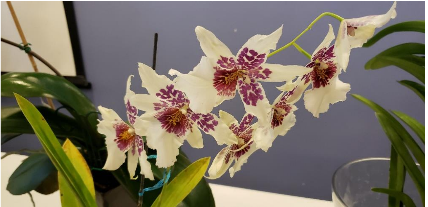
Shk. Big Shot 'Hilo Sparkle' AM/AOS