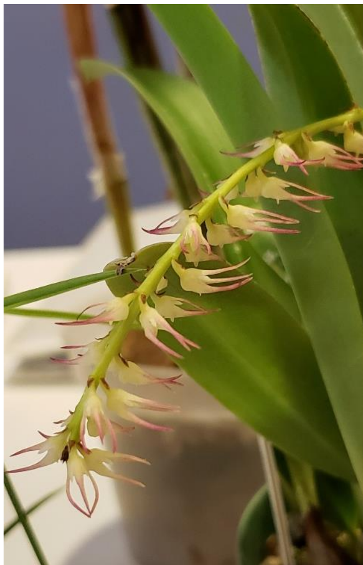
Oecl. maculate and Bulb. cocoinum #2