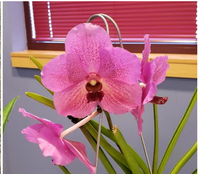
C. wittigiana (Red) and Pda. (Mevr. L. Velthuis x V. Bitz's Heartthrob)