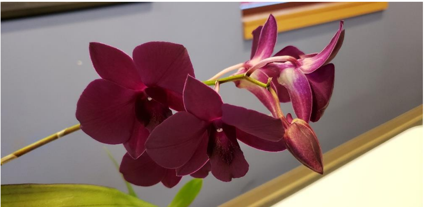
Den. (Madame Vipa x Burana Emerald) 'Hihimanu' AM/AOS