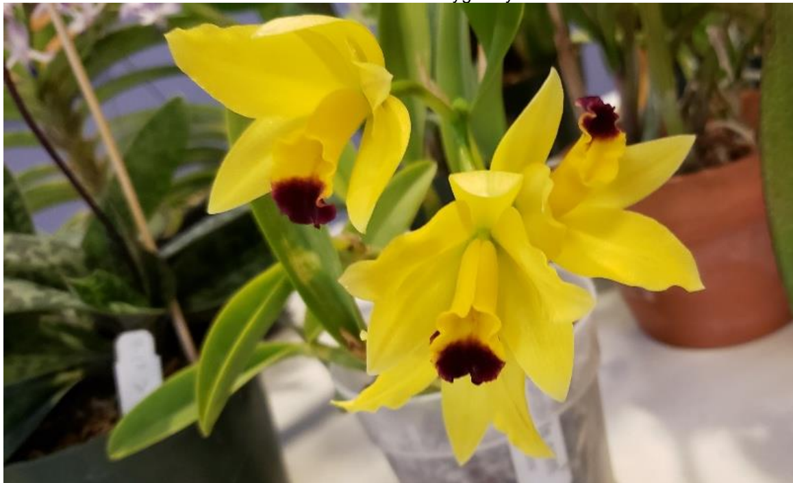
Rlc. Chien Ya Lantern 'Ri Rin'