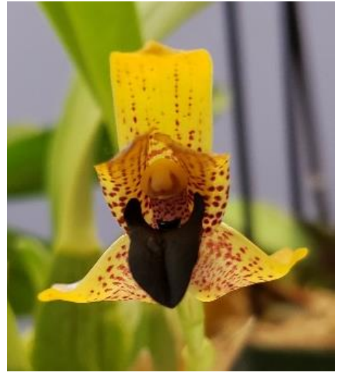
Roger's Max. hematoglossa