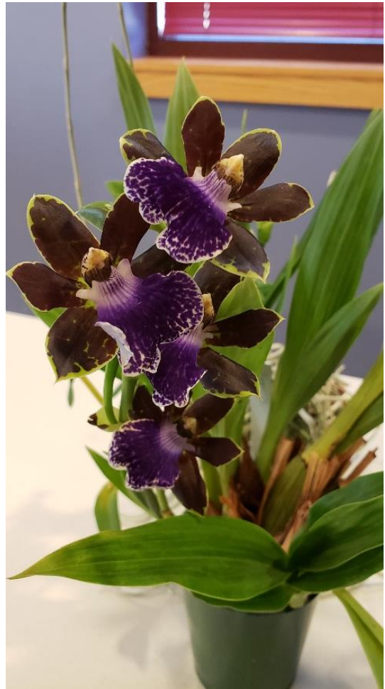
Bark. whartonia and Zygo. Hybrid