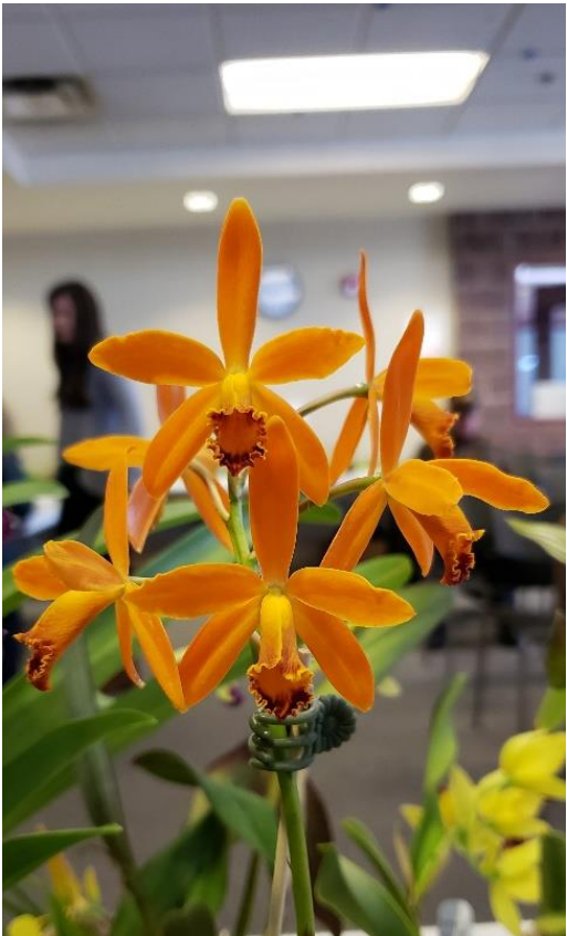
Phal. Lioulin Pretty Lip and C. Perky Peach