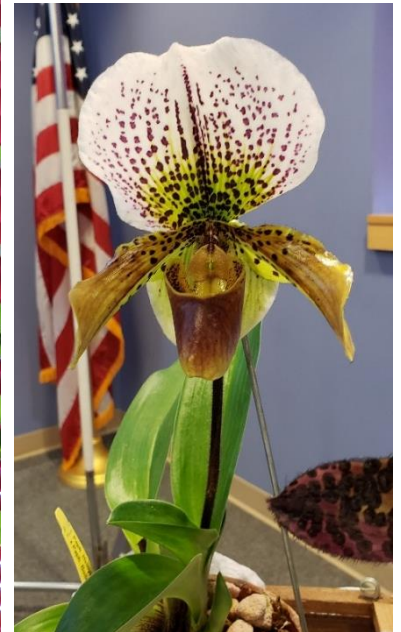
Paph. (Wood Wonder x Hsinying Rubyweb '#29'), V. Gordon Dillon 'Lea' AM/AOS and Paph. (Hsinying Raisin x Builders 'Sophistication')