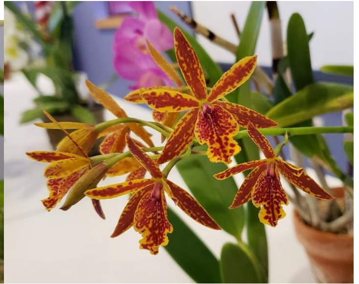
Rchg. (Lc. Angel Heart 'Hihimanu' AM/AOS x Rth. Martha Clarke 'Amazing') and Epl. Volcano Trick