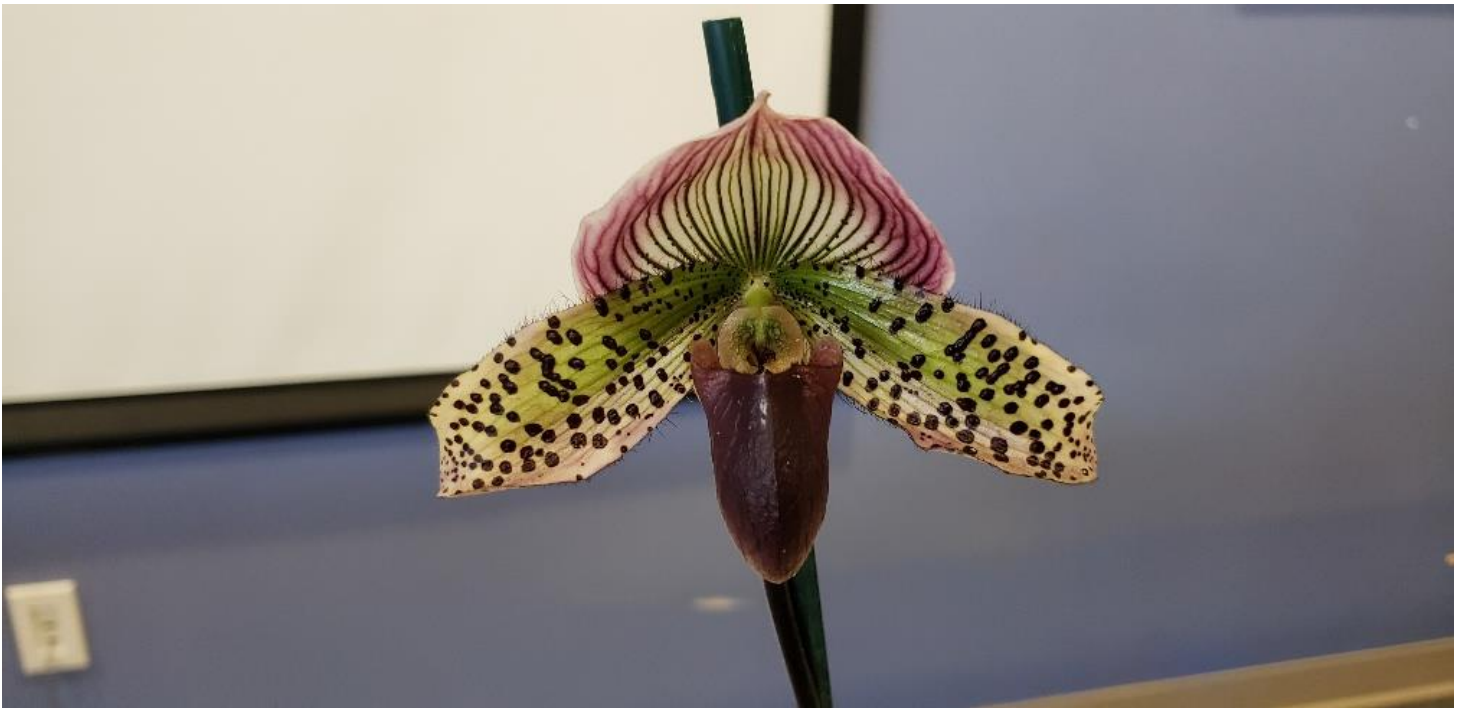
Paph. Macabre Moon