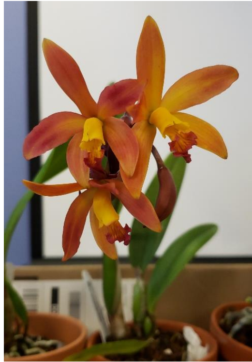
Phal. Summer Rose 'Blue Star' and Rlc. Guess What 'Sunset Valley Orchids' AM/AOS x C. Seagulls 'Red'