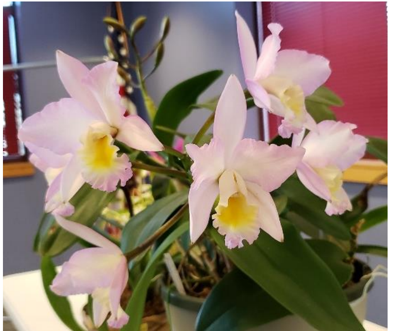
Paph. Jenna Marie 'Sparkle' AM/AOS and Ctt. Candy Tuft