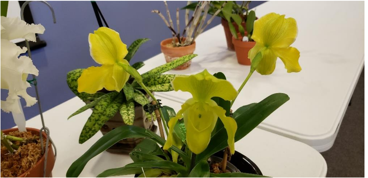
Paph. Charmingly Golden