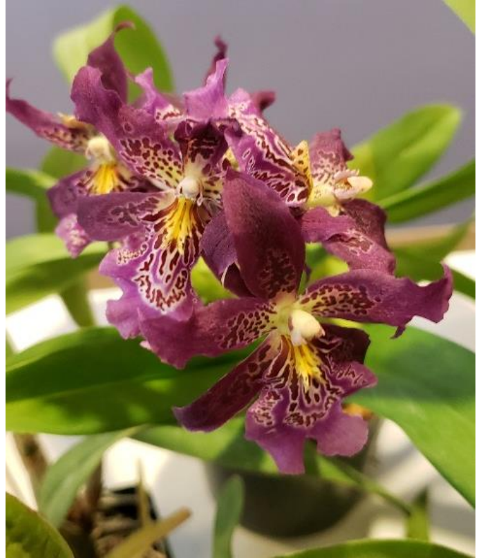
Rth. (C. Tokyo Life 'Dec. 1st' x Rth. Telling Lies 'SVO') and Alkra. Marfitch 'Howard's Dream' AM/AOS