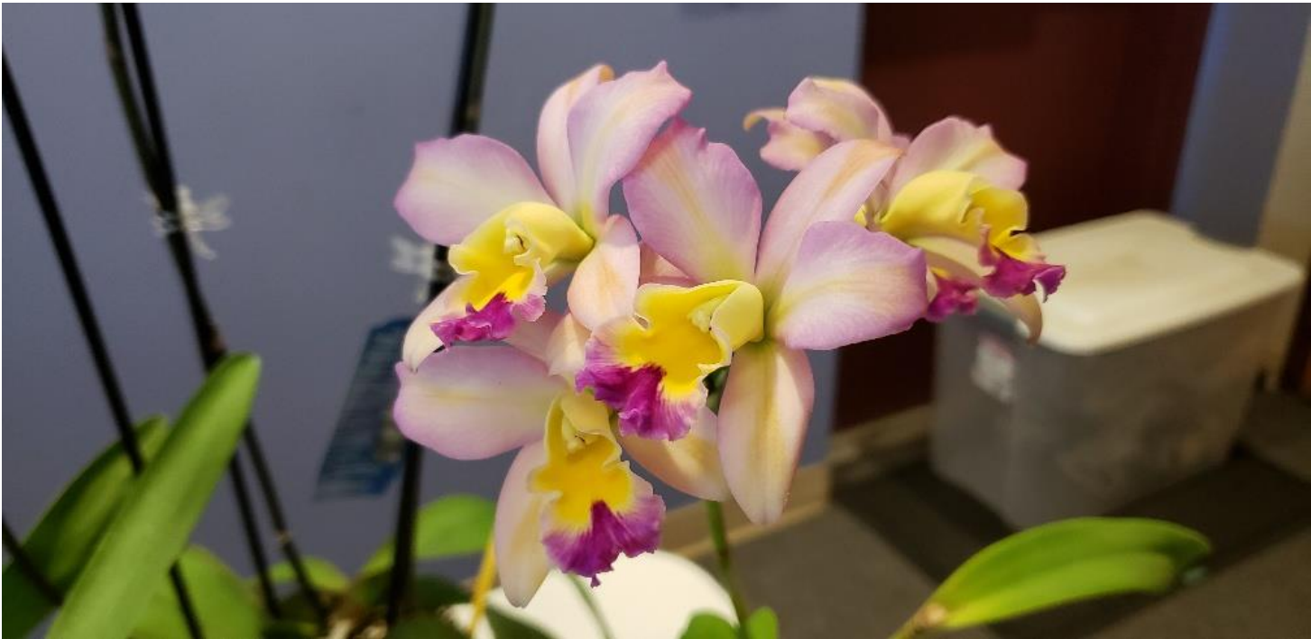
Lcn. Long Life Angel 'Paradise'