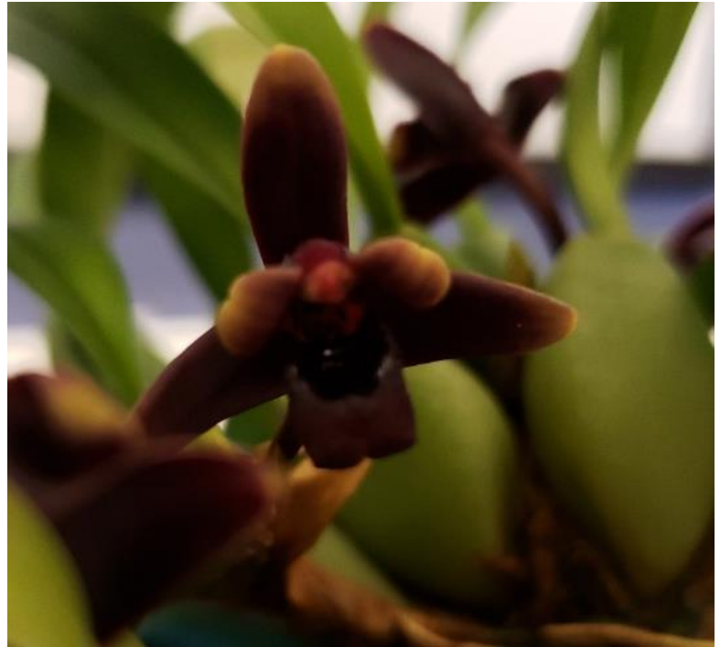
Lsz. Lava Burst 'Puanani' AM/AOS and Max. species