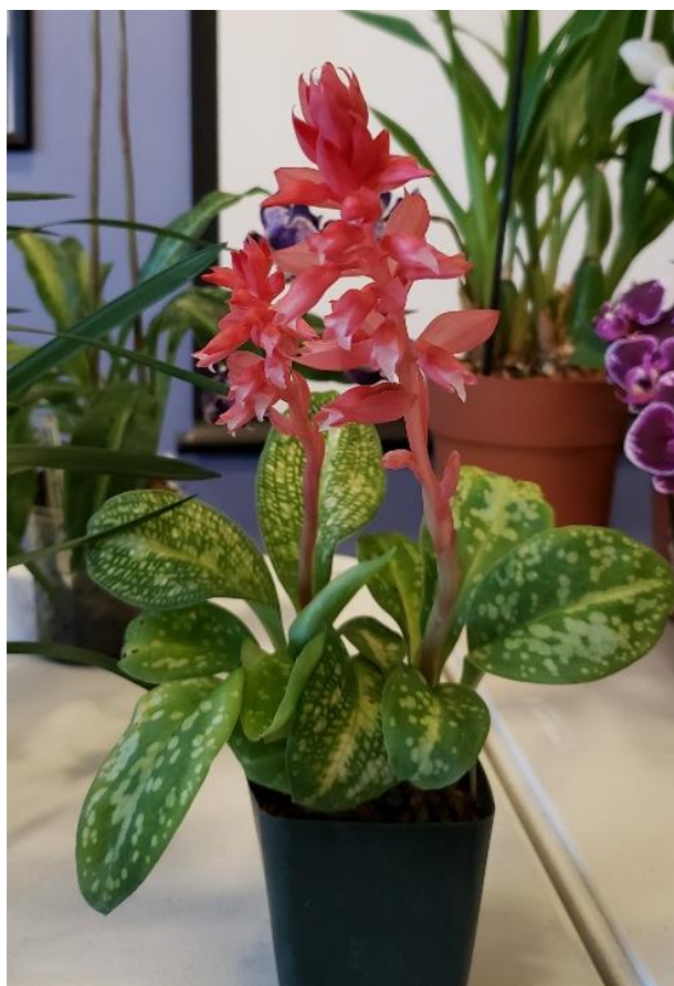
Ddc. yuccifolium and Strs. speciosum