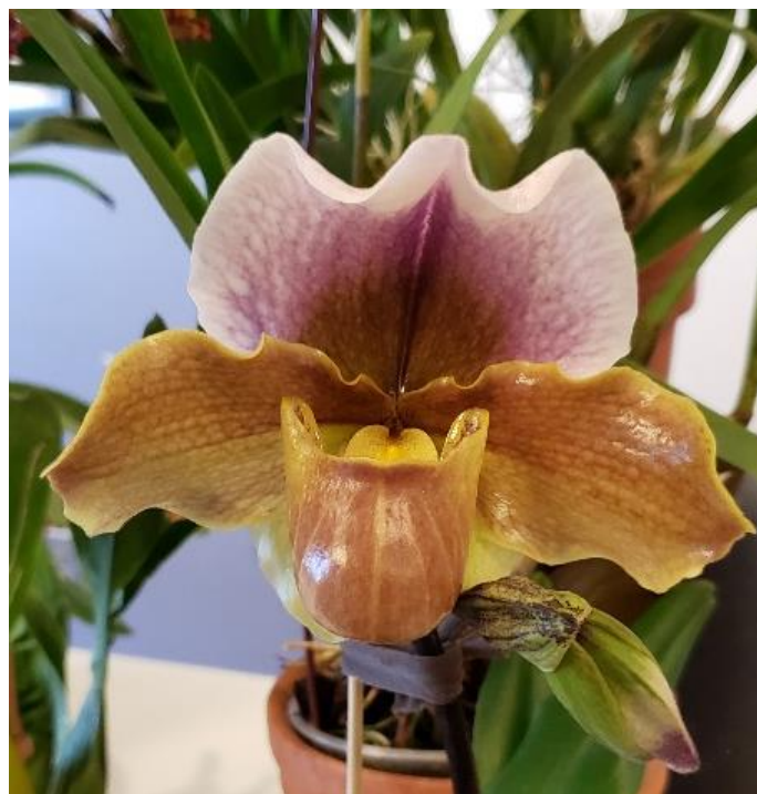
Alca. Marfitch 'Select' and Paph. Unknown