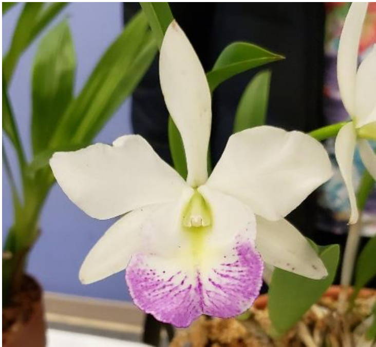
Bc. Hawaii Stars 'Pink Lace'