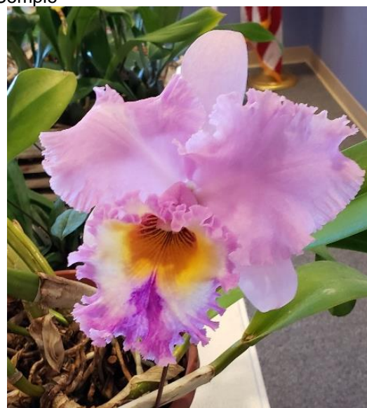
C. Orglade's Grand 'Yu Chang Beauty' AM/AOS and Lavender Cattleya