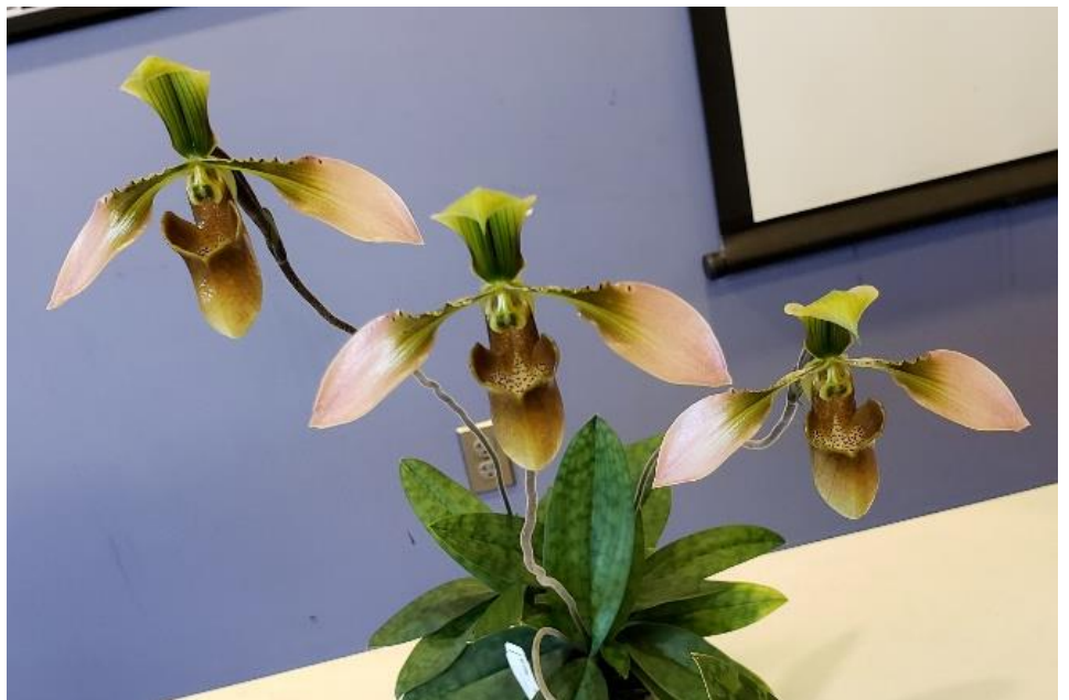
Paph. fairrieanum and Paph. appletonianum