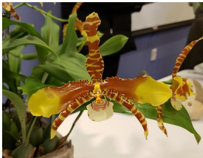
Paph. Toni Semple and Ros. Grande