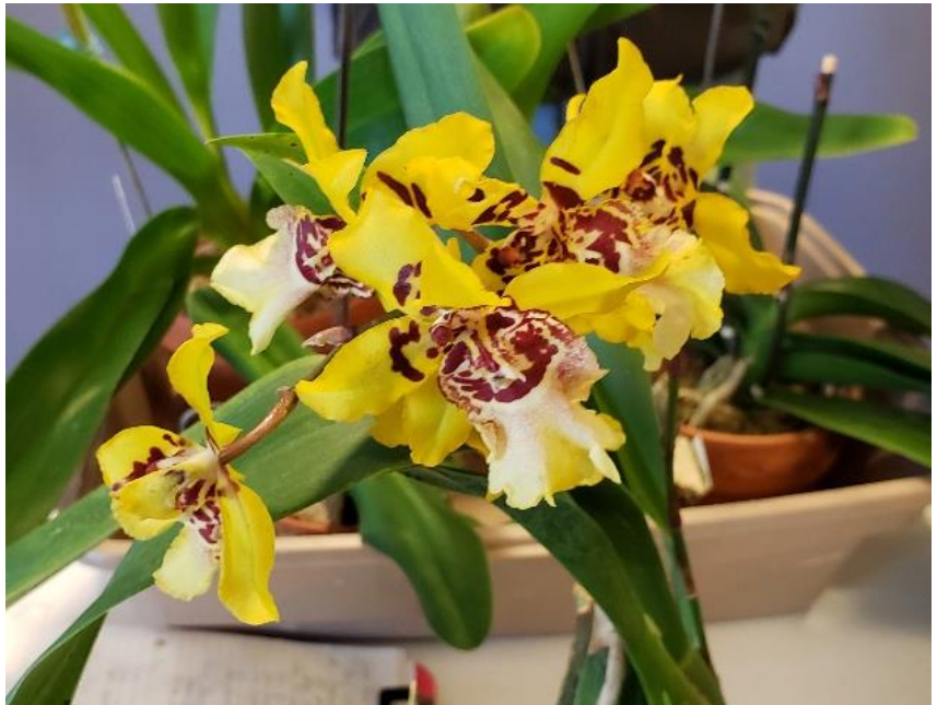
Paph. Rosefire and Ons. Wildcat