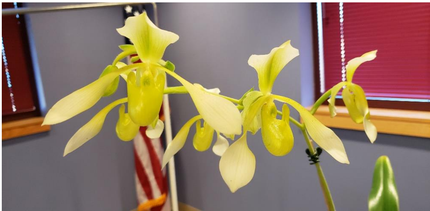
Paph. Toni Semple