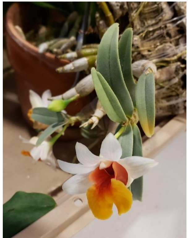
Paph. Cloud's Prime Crystal and Den. bellatulum