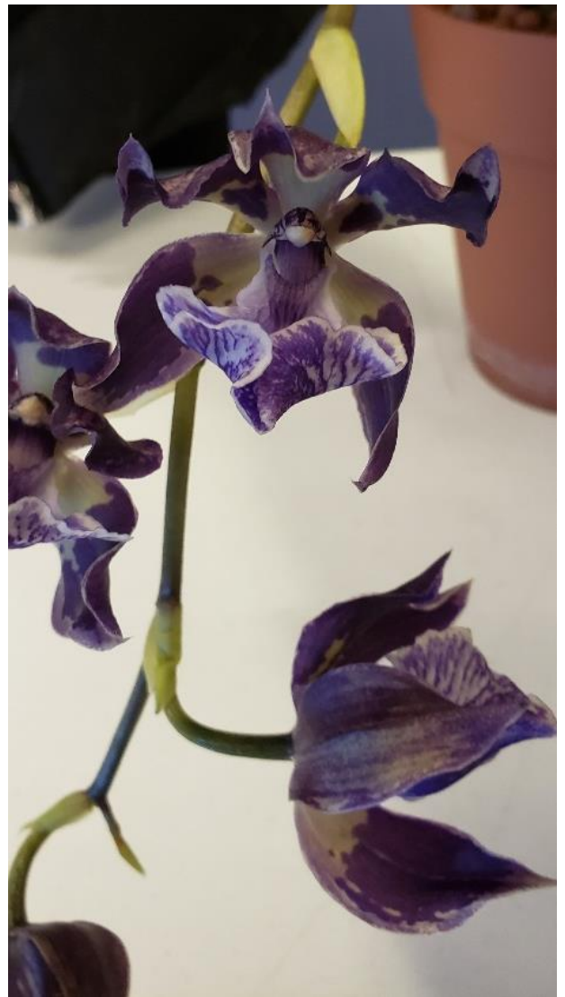
Dtps. Hybrid and Zns. Murasakikomachi