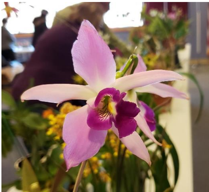
Tolu. Jairak Flyer and L. anceps h.f. guerrero