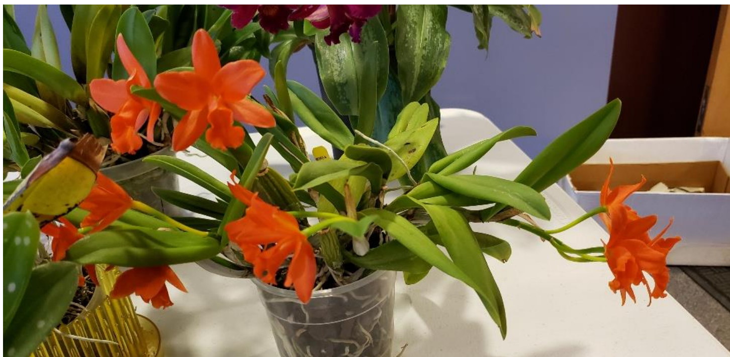
Rth. Young-Min Orange 'Golden Satisfaction' AM/AOS