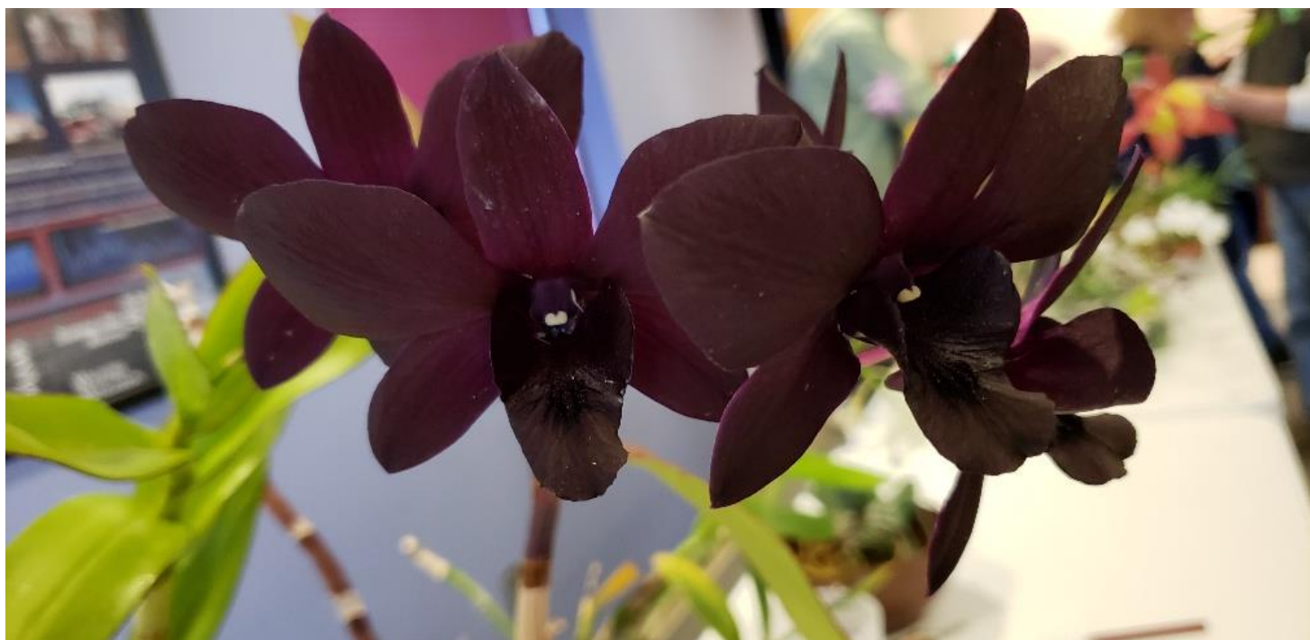
Den. (Hawaiian Velvet x Wave Rider)