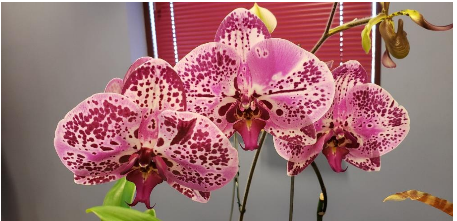
Phal. Unknown (Safeway)