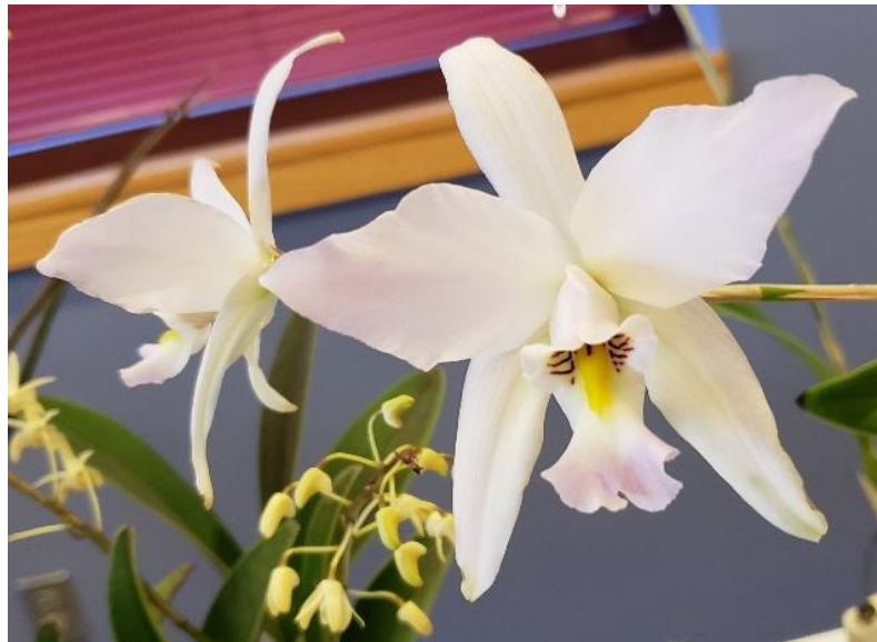
Lna. Dave's Dapper Dandee and L.anceps var. delicatum