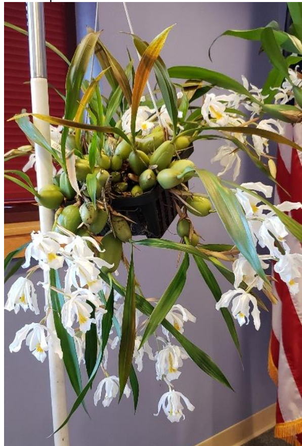
Stsc. Vanguard 'Fireball' and Coel cristata