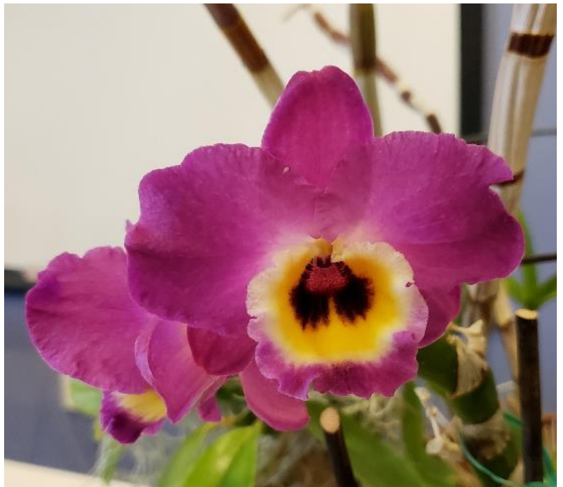
Phal. Fangmei Sweet 'Maui Sunset' and Den. Bridal Red 'Celebration'