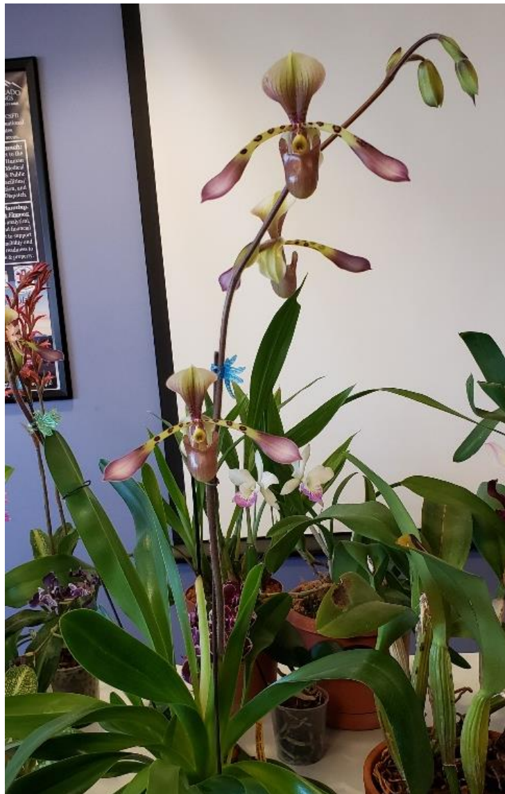
Paph. Toni Semple