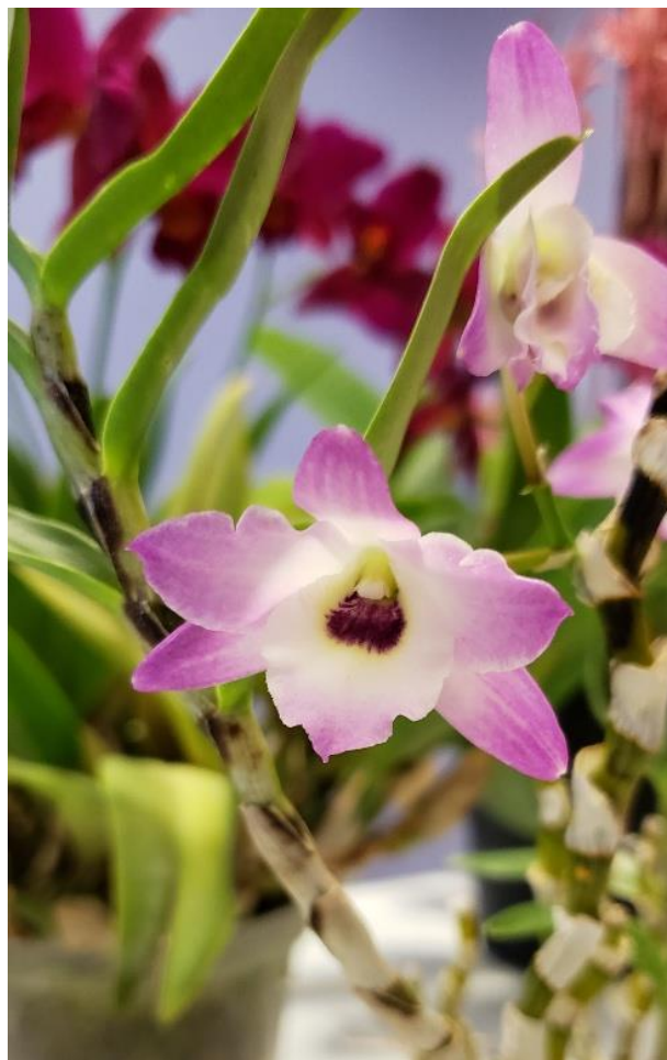
Max. pseudoreichenheimiana 'Karen' and Den. Angel's Breath