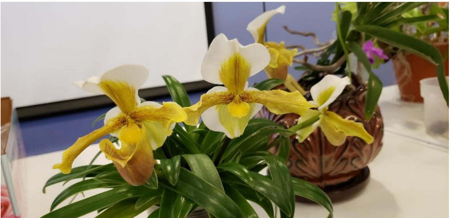
Paph. Barbi Playmate