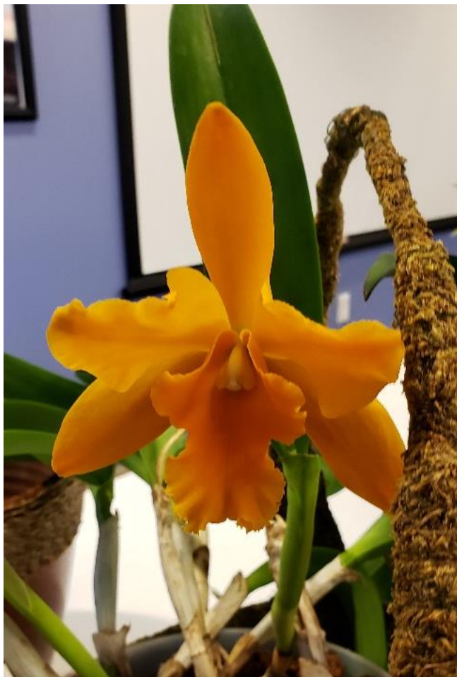
Rth. Wattana Gold 'No. 2'