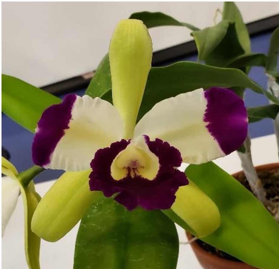
Ctyh. Mae Bly 'Ching Hua Splash' AM/AOS grown by Stan Brown