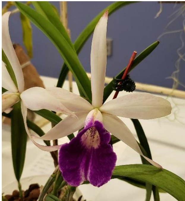
Bc. Clear Stars