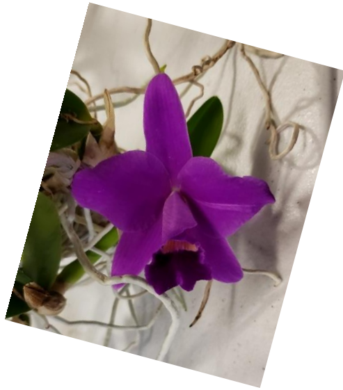
C. Love Psychedelic Orchestra