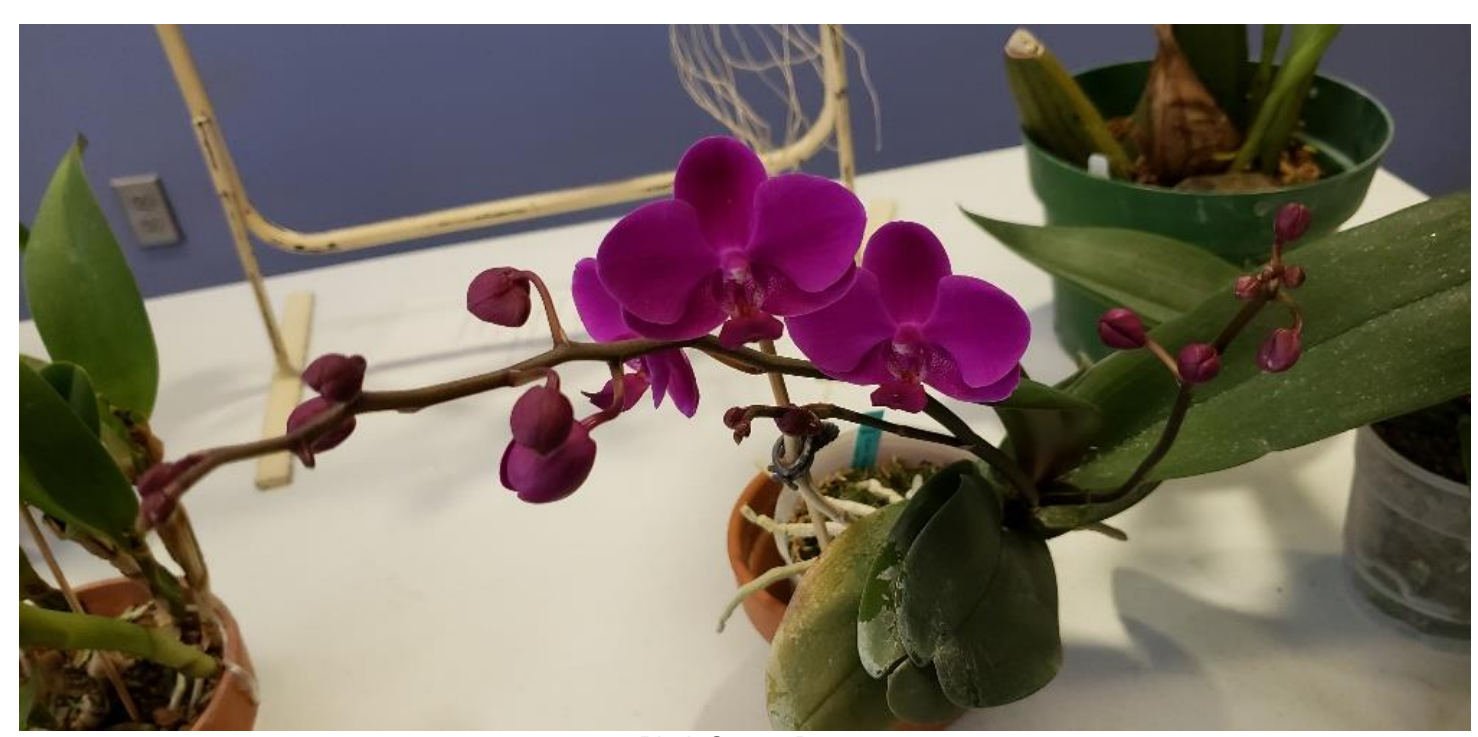
Phal. Queen Beer