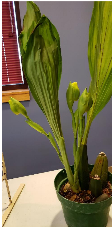
Ang Clowesii in bud at our August Meeting.

And pictures of it in bloom that Roger sent in September.