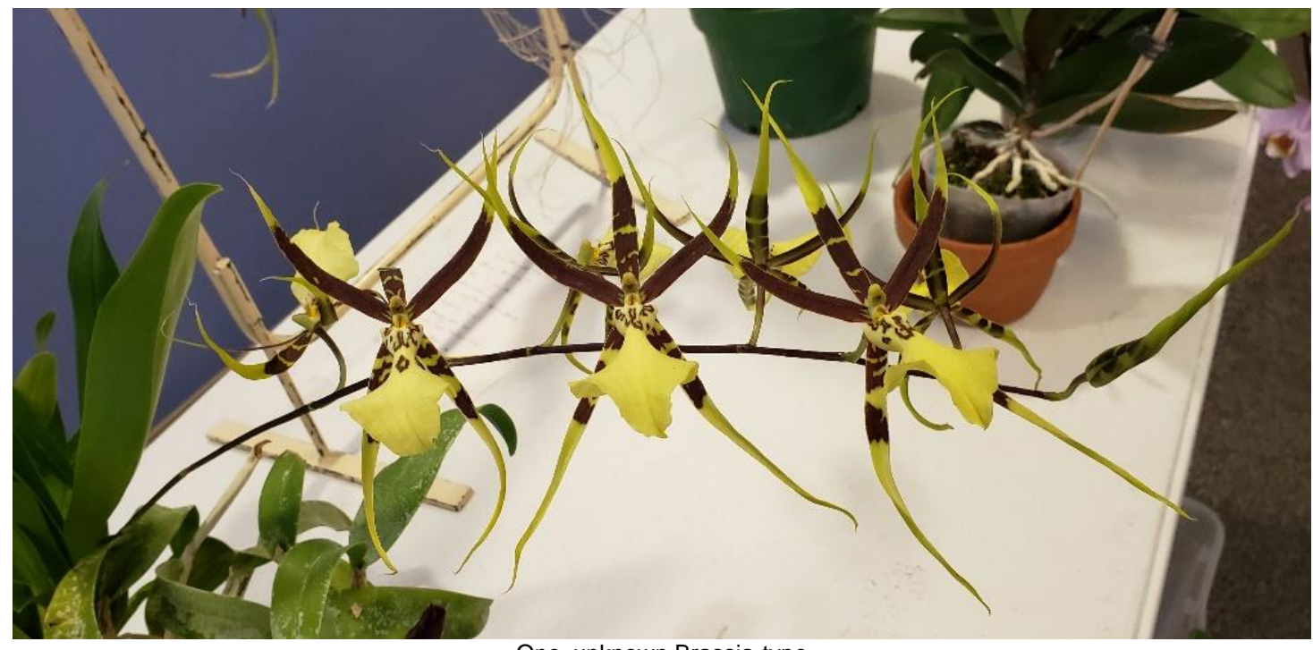
Onc. unknown Brassia-type