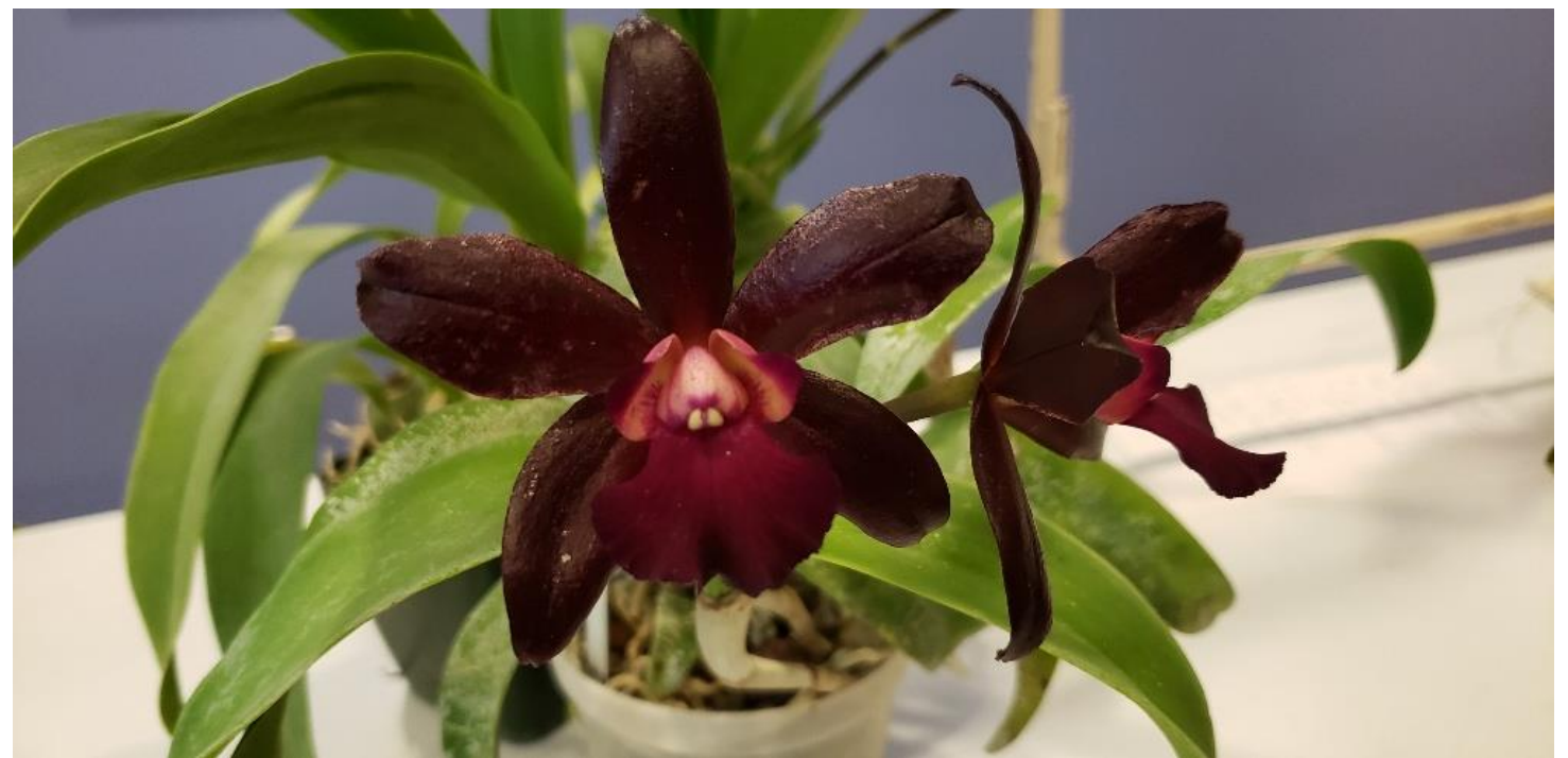
Lc. Crimson Dragon