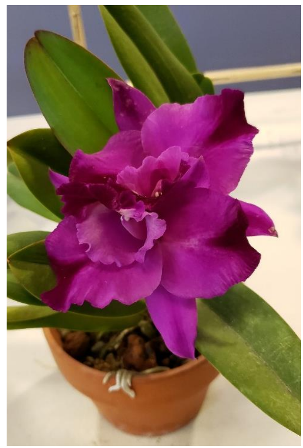
Ctt. Loog Tone 'African Beauty' AM/AOS