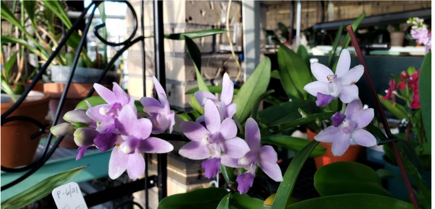
Phal. Rose 'Blue Star' HCC/AOS