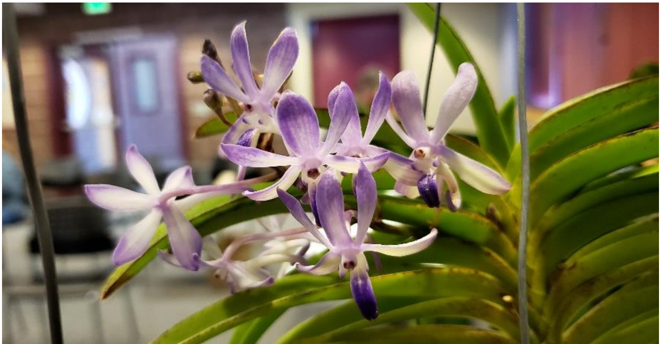
Van. Lou Sneary 'Bluebird' JC/AOS