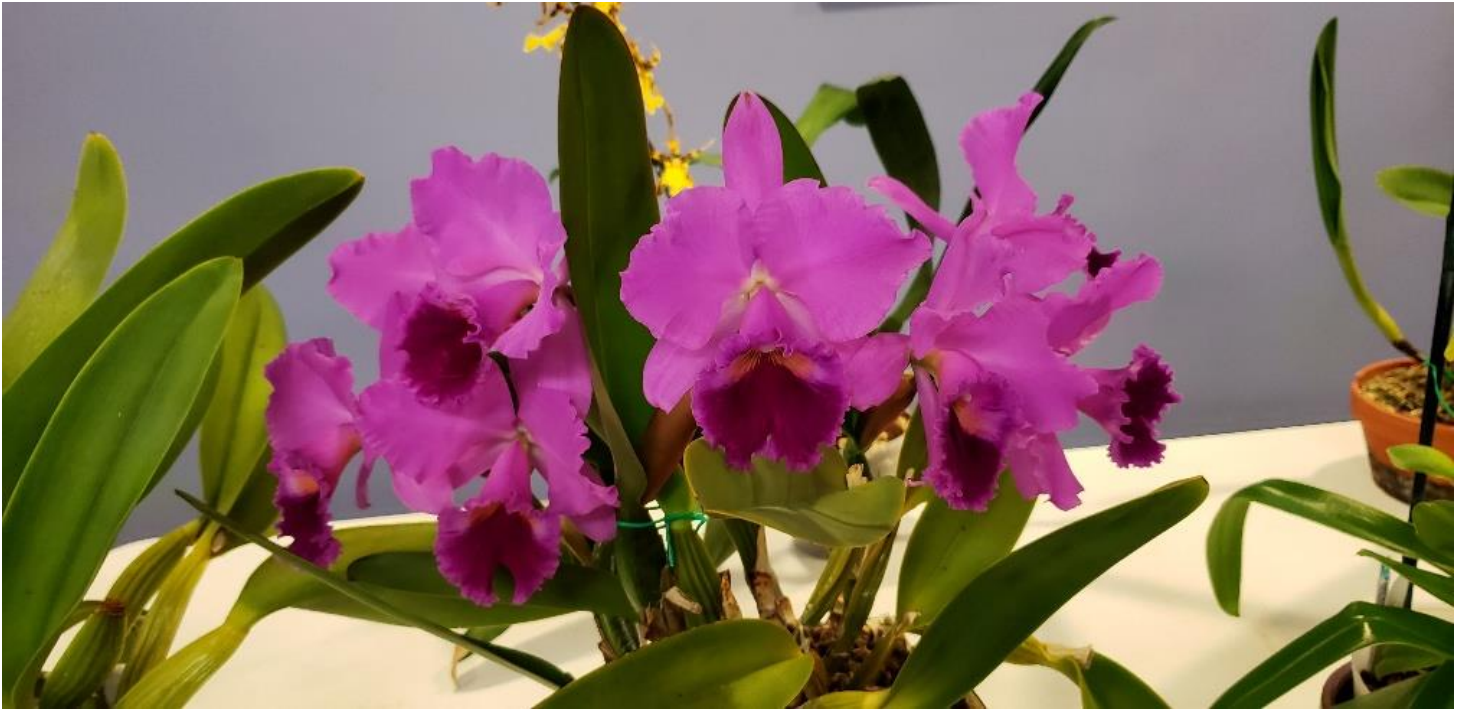
C. labiata (h.f. rubra) 'Schuller's' x self