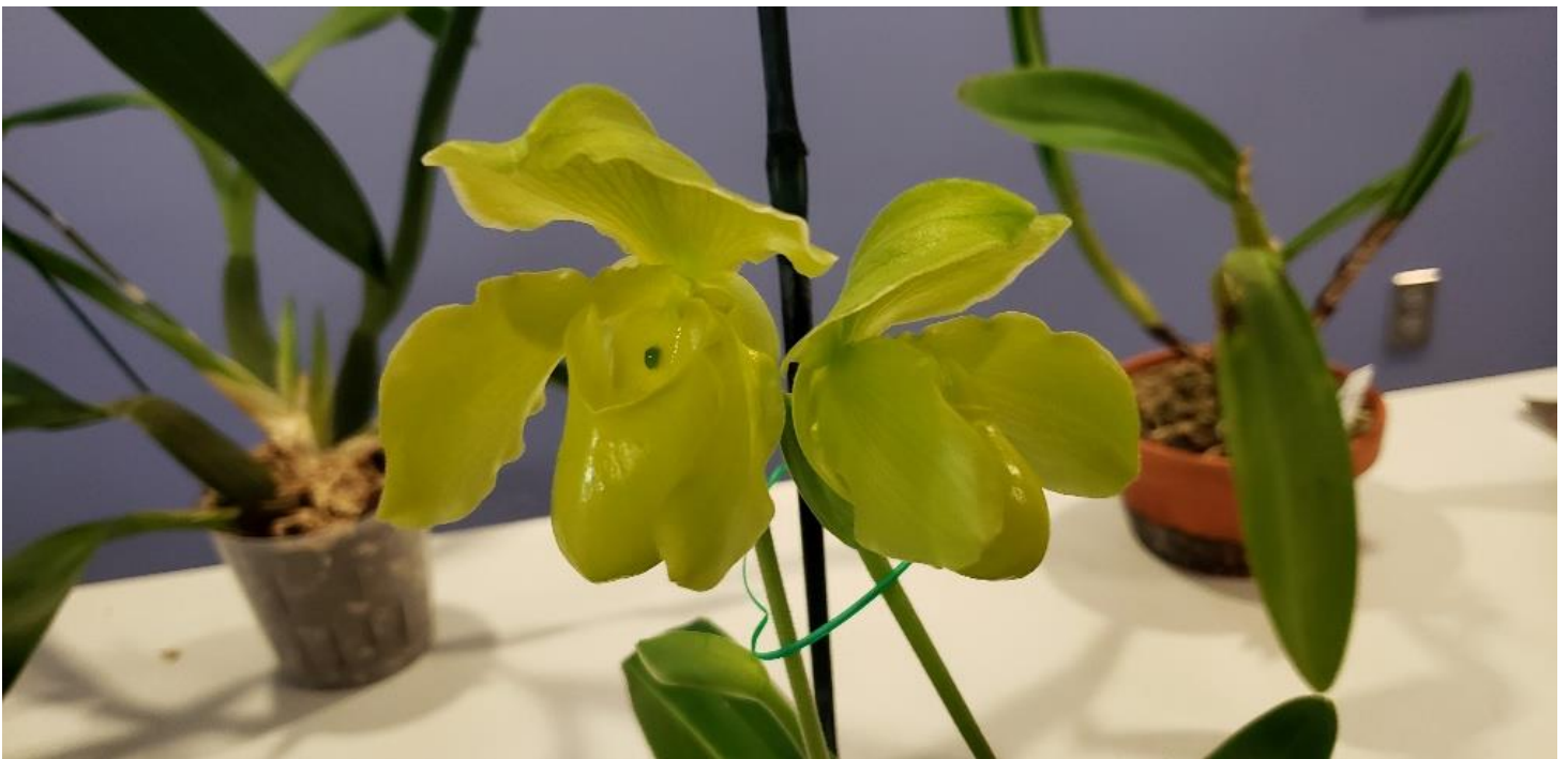
Paph. Charmingly Golden