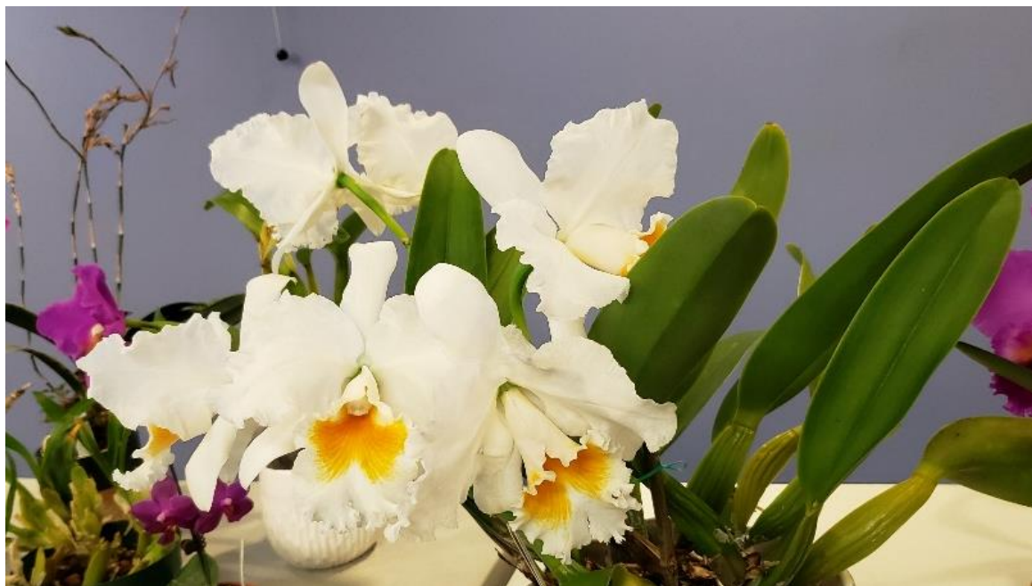
C. Empress Bells 'Vici' AM/AOS