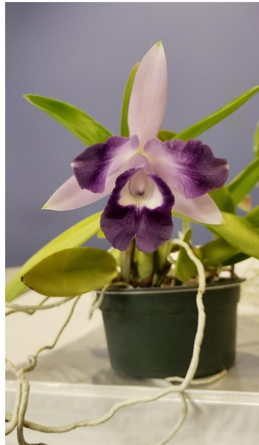
C. Mini Quini 'Angel Kiss'