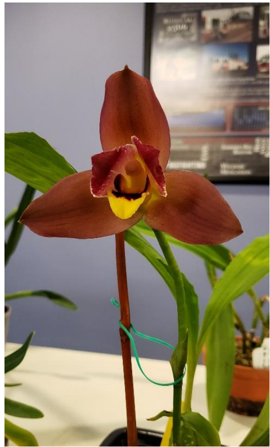
Lys. Red Jewel 'Hilo Girl'