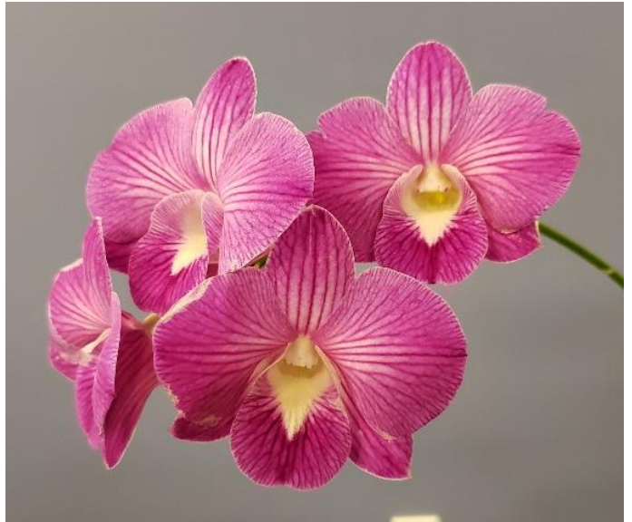
Den. (Burana Pearl x Burana Stripe)