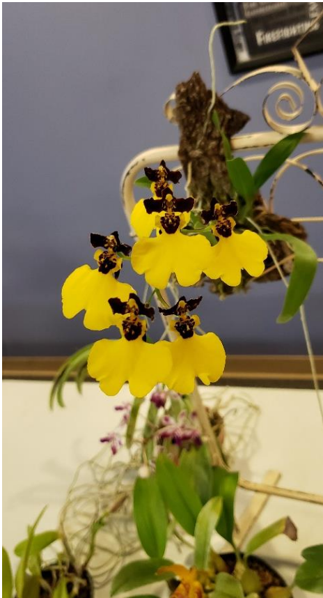
Gom. Moon Shadow