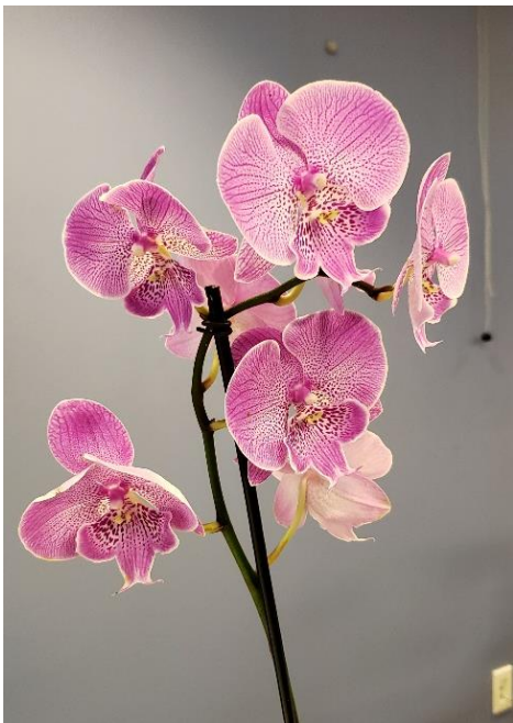
Phal. Cao-Tun Beauty