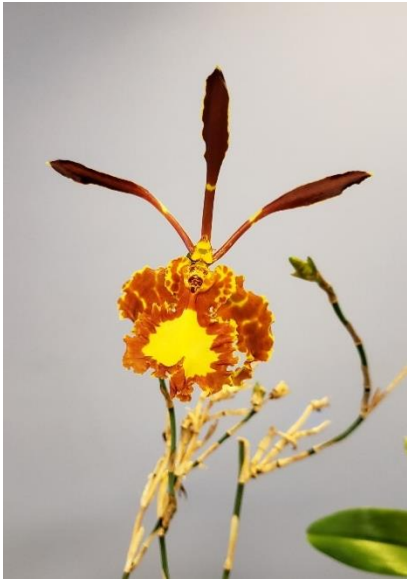
Pyp. Mendenhall 'Monarch' AM/AOS