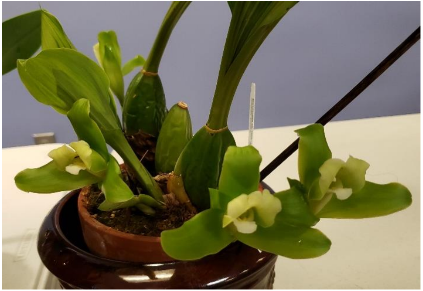
Lyc. macrophylla var. alba