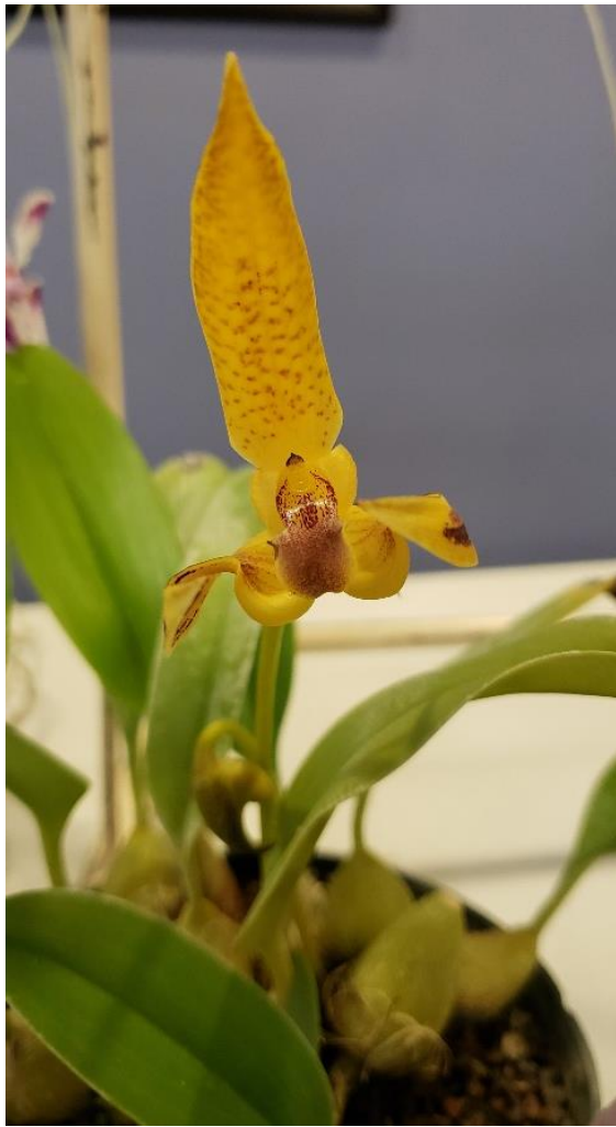
Bulb. Wilmar Galaxy Star