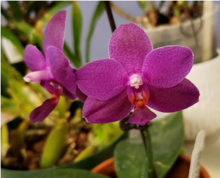
Phal. YangYang Black Grape

Three more of Joan McCann's September Blooms: