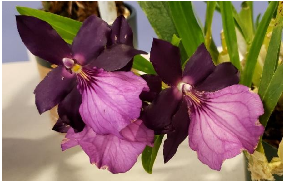
Milt. spectabilis var. moreliana 'Newberry' AM/AOS