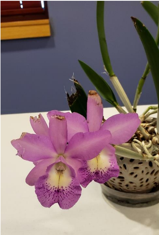
Bct. Little Mermaid grown by Kaoru Stabnow