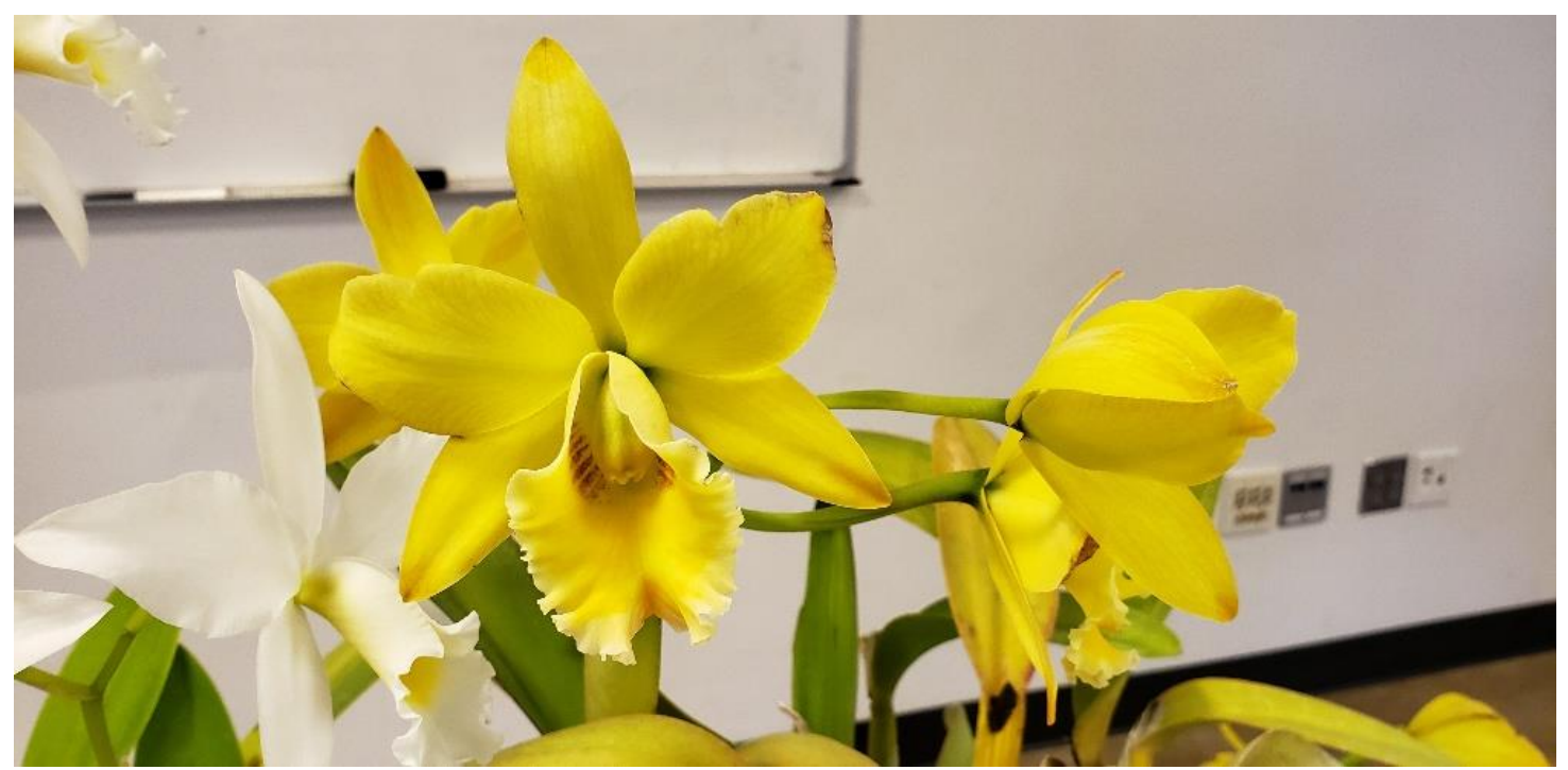
Rlc. Majestic Light 'Hidden Treasure'