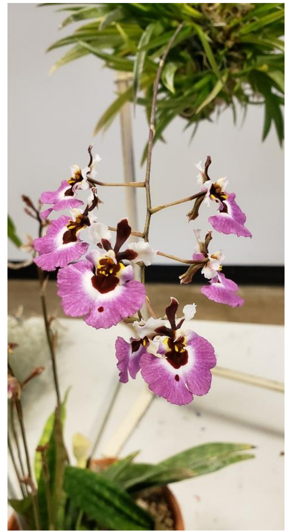
Tolu. Pink Panther