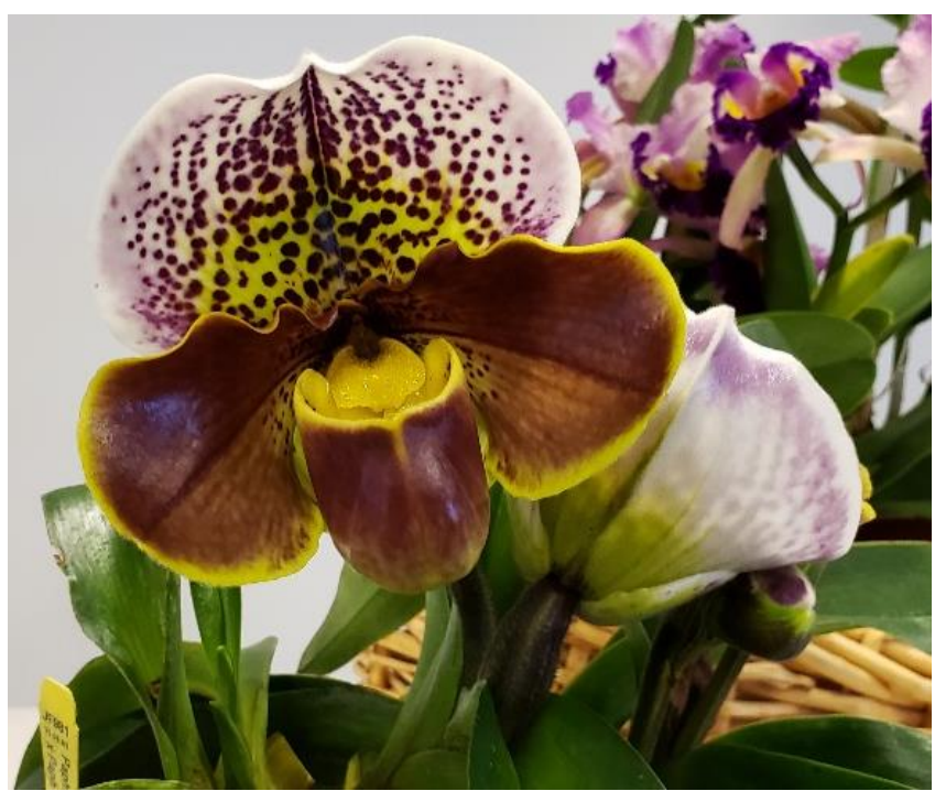
Paph. Perfect Spots grown by Jack Willcox