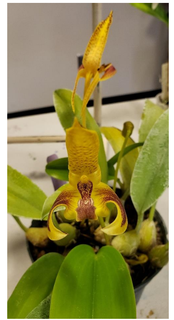
Bulb. Wilmar Galaxy Star