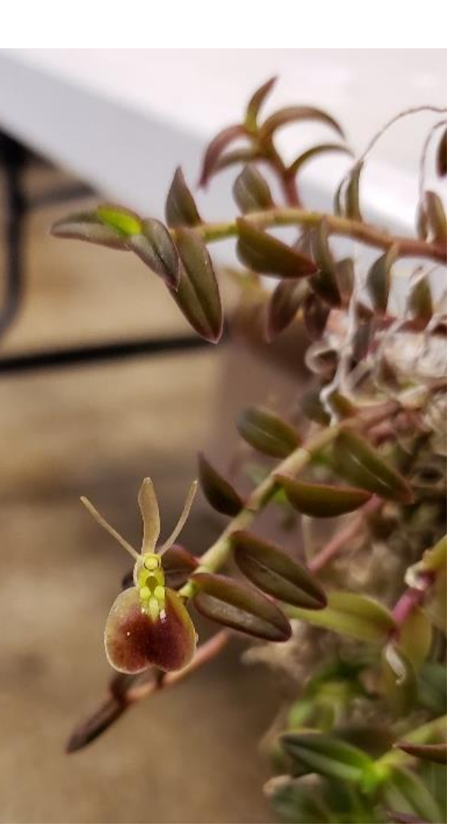
Ctt. (Ctt. Orchidglade 'Trout' x C. milleri 'Big Island' AM/AOS)