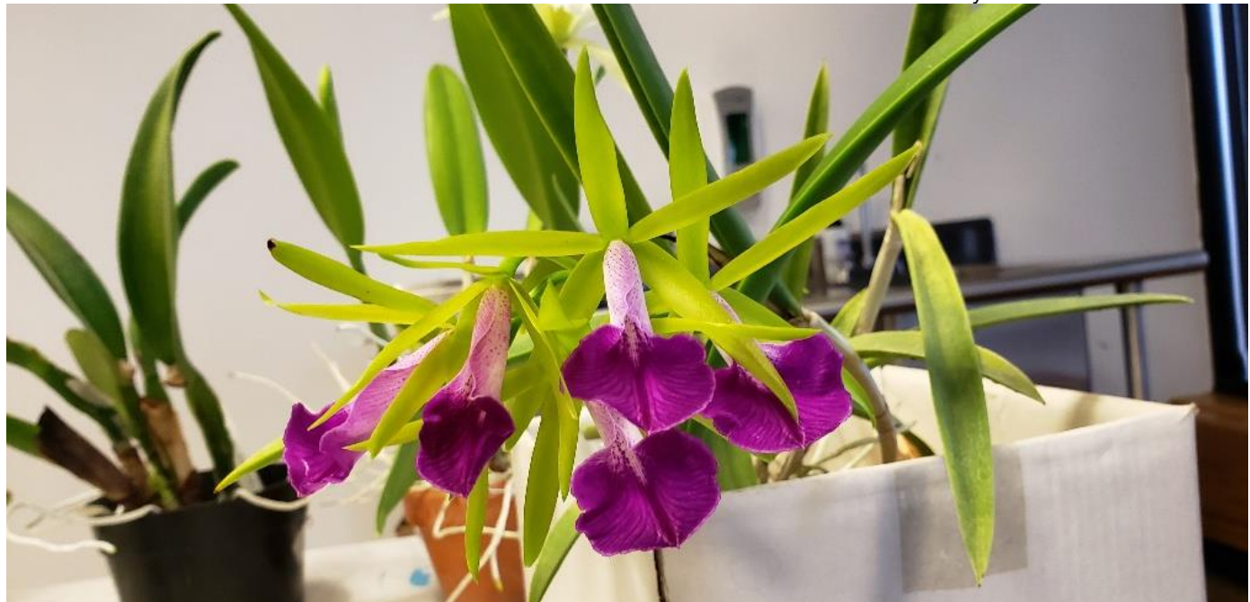
Bc. Gulfshore's Beauty 'Green Gem'