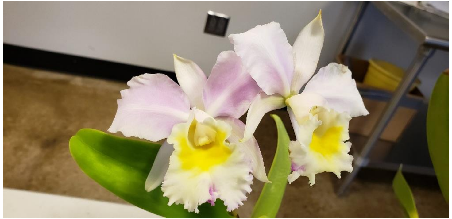
Psv. Moon Mist 'Lunar Dawn'