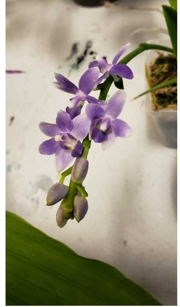
Phalaenopsis unknown (4)