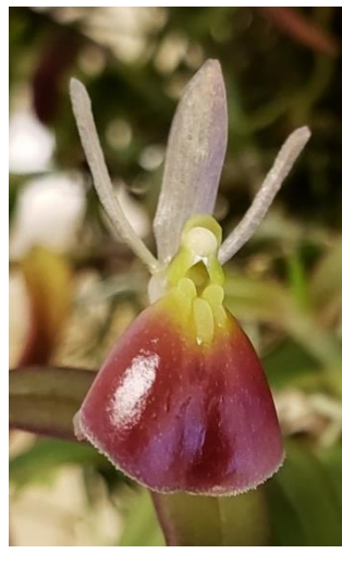
Epi. porpax and a close-up