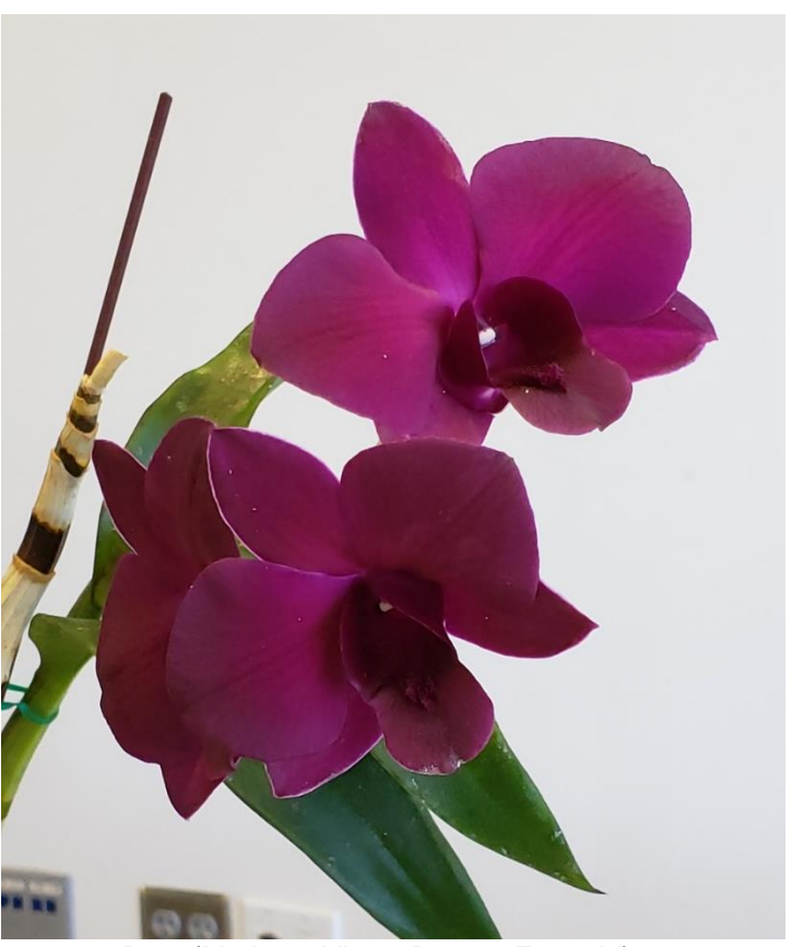
Den. (Madame Vipa x Burana Emerald)