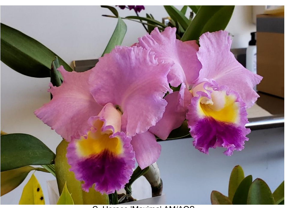
C. Horace 'Maxima' AM/AOS