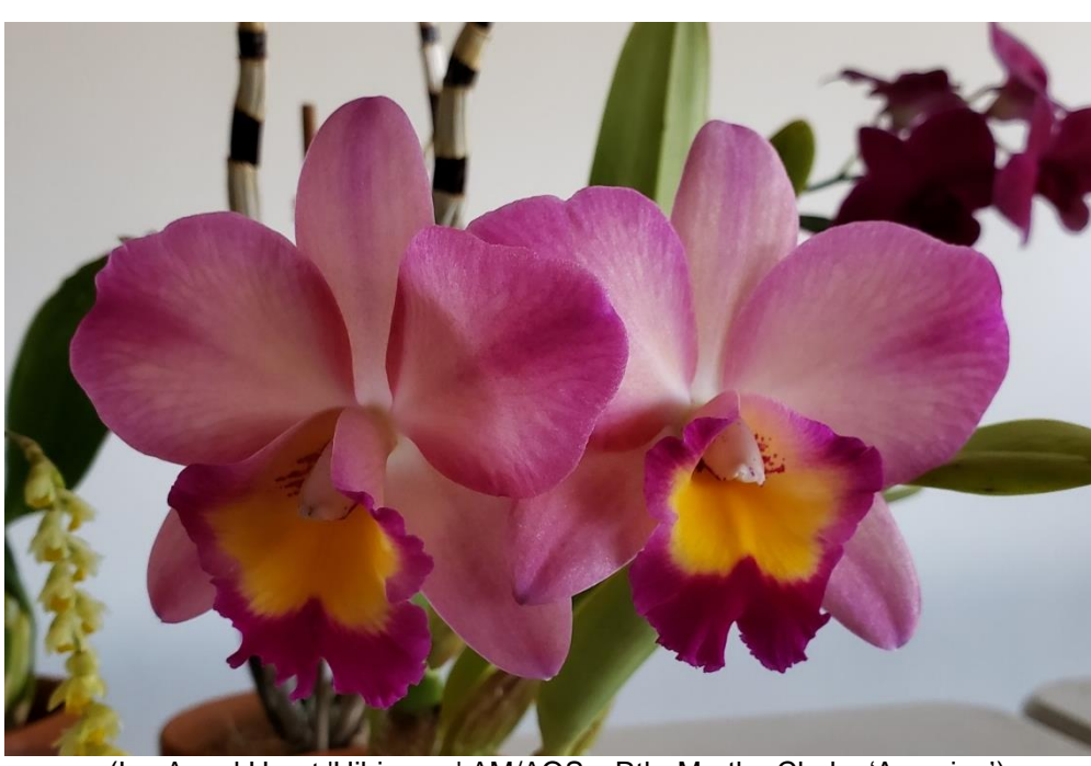
(Lc. Angel Heart 'Hihimanu' AM/AOS x Rth. Martha Clarke 'Amazing')