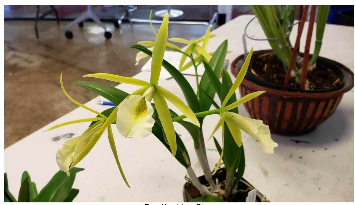
Pcv. Key Lime Stars