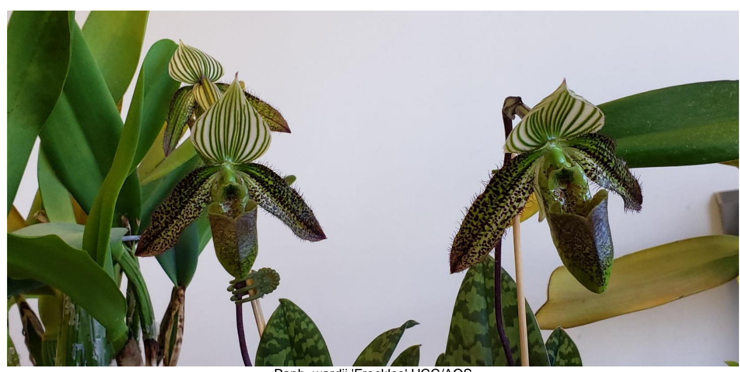
Paph. wardii 'Freckles' HCC/AOS