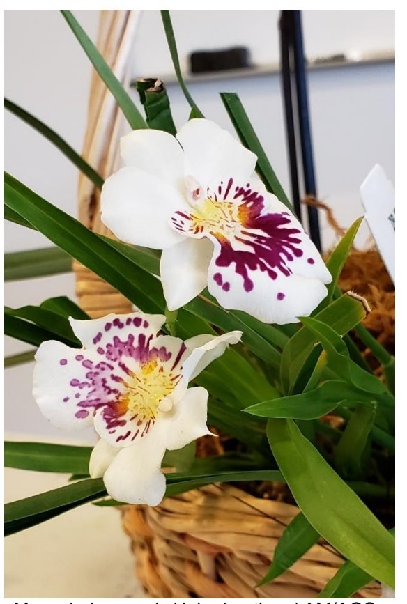
Mps. phalaenopsis 'John Leathers' AM/AOS