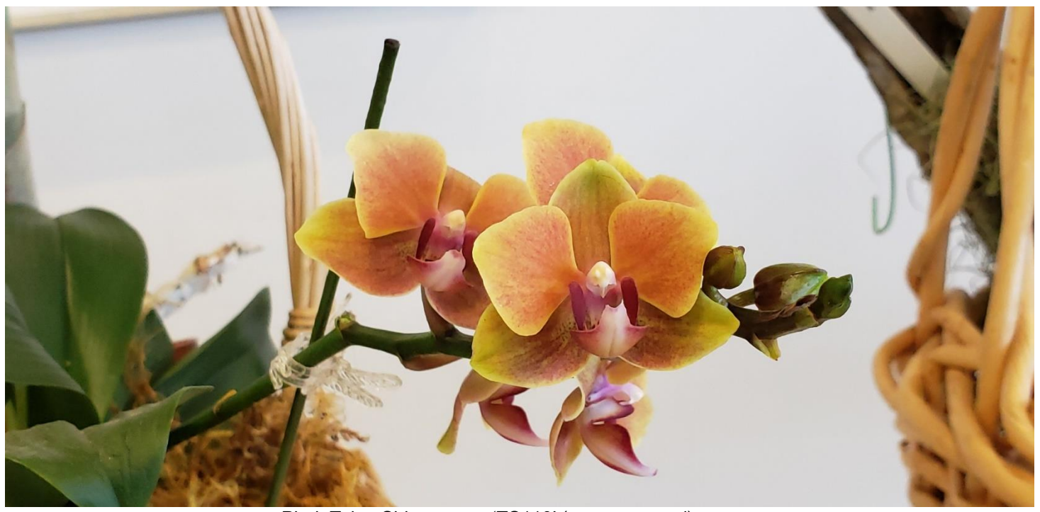
Phal. Tying Shin _____ 'TS110' (not yet named)