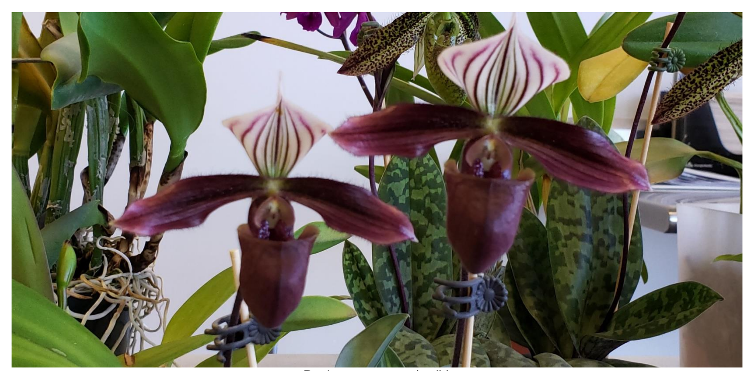
Paph. purpuratum (x sib)