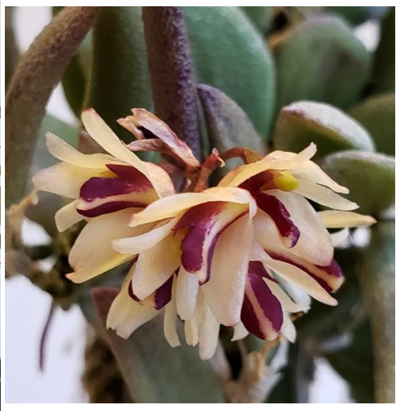
Den. rigidum and a close-up