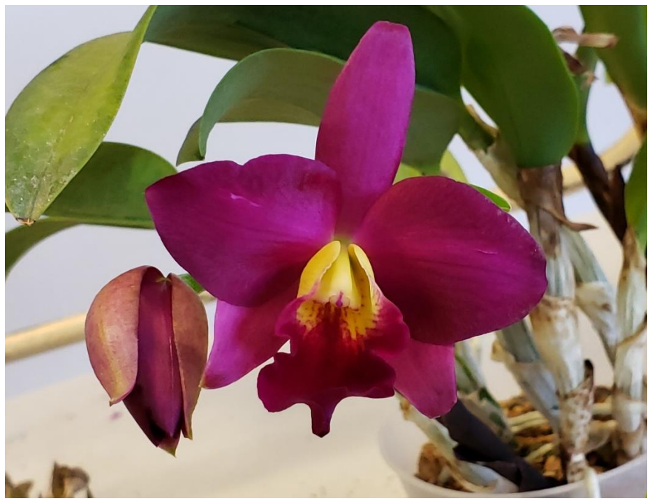
Rth. (C. Purple Doll x Rth. Alpha Plus Nuggett)