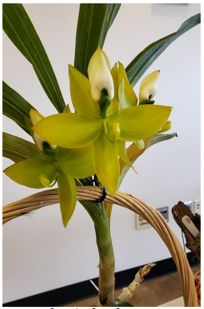
Cycnoches Super Cooper