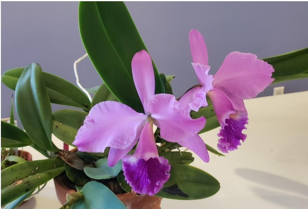
C. labiata (h.f. rubra) grown by Kaoru Stabnow