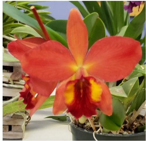
Rlc. Mark's Valentine