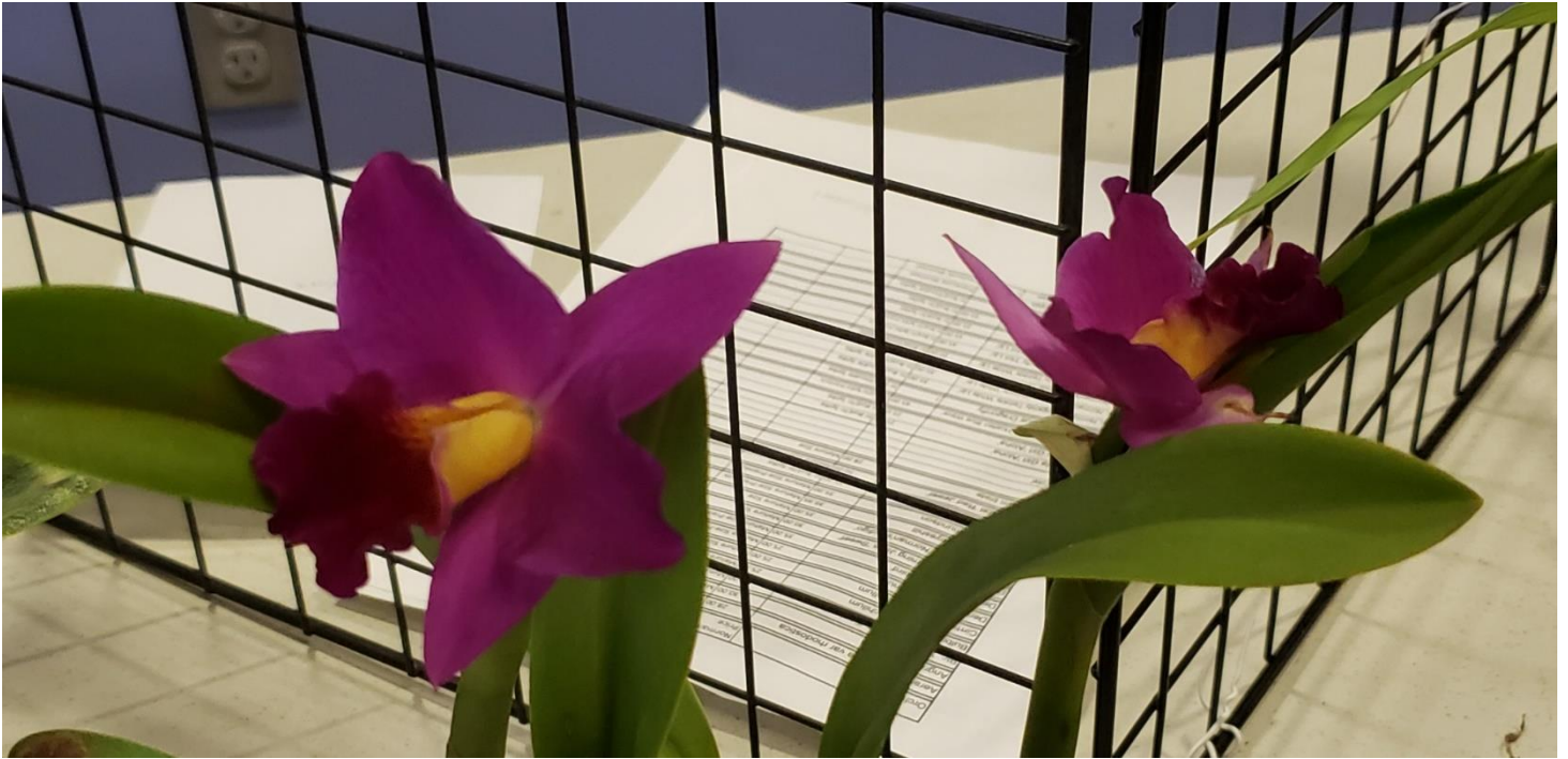
C. Purple Doll x Rth. Alpha Plus Nuggett