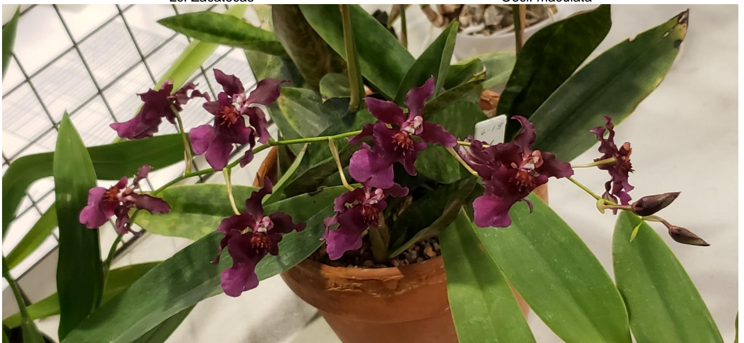
Onc. "No Name"