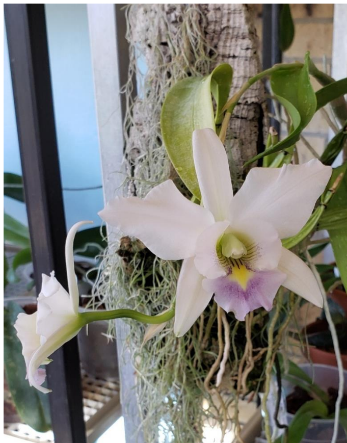
Lc. Twilight Song fma. coerulea 'Big Ben' 4N