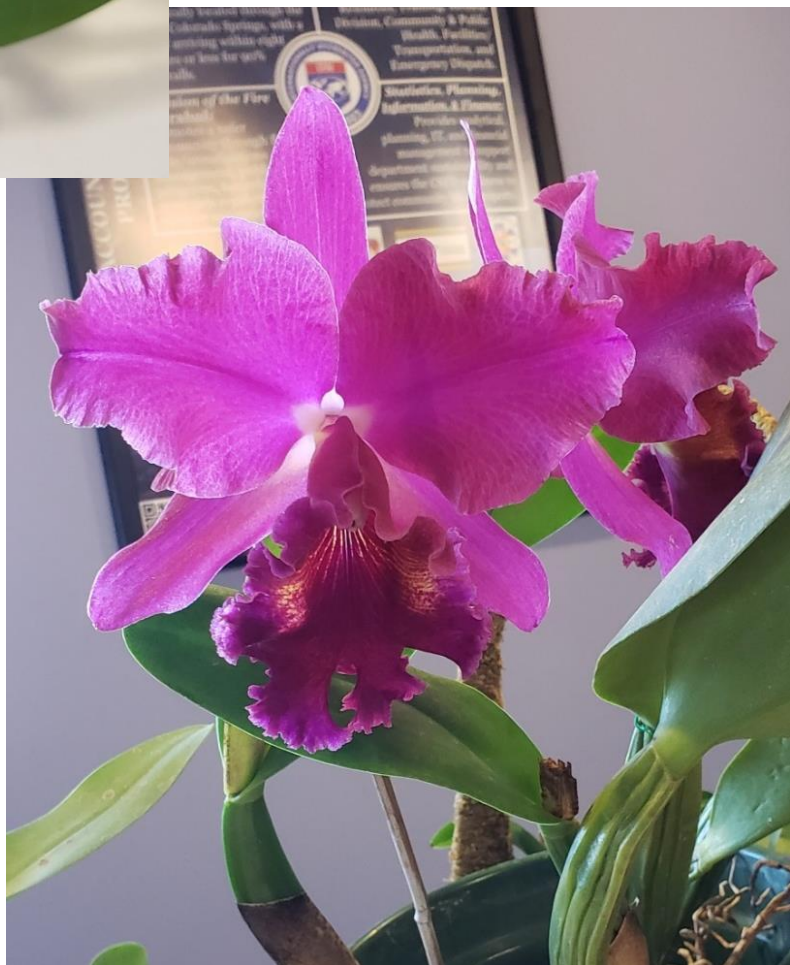
Rlc. Yonges Island