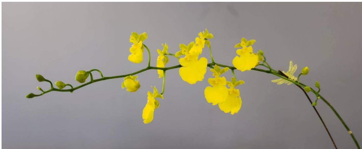
Onc. Lemon Drop