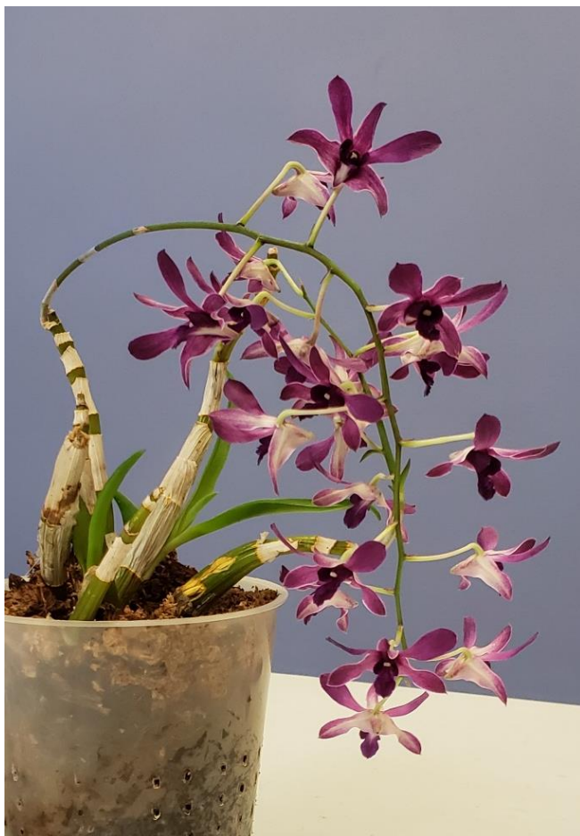
Den. (Hisako Haraguchi 'Short' x Blue Twinkle) grown by Patsy Gaglione