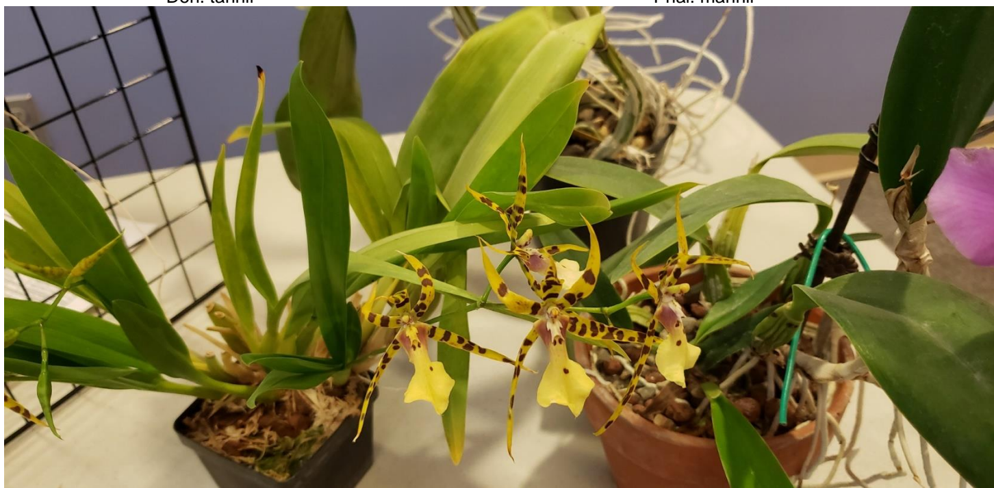
Brat. Golden Spider