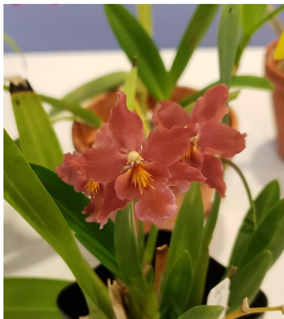
Onc. Space Mine 'Red Rendezvous' HCC/AOS