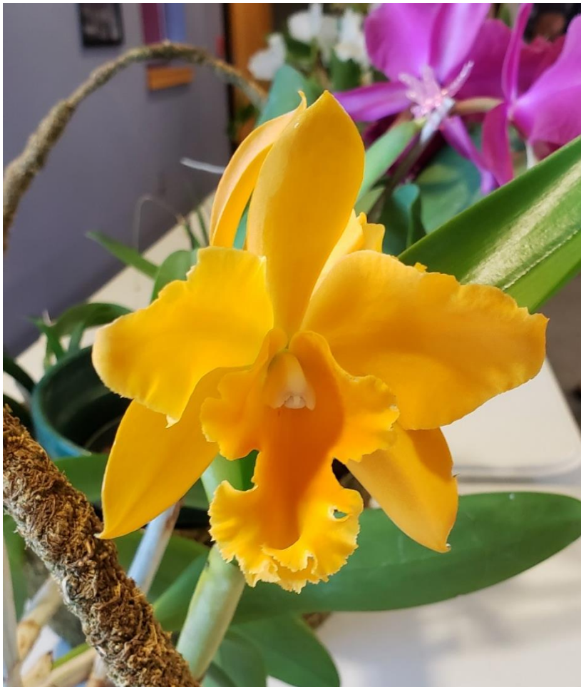
Rth. Wattana Gold