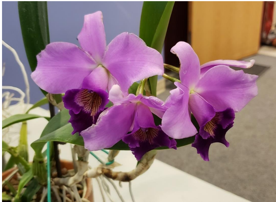
Lcn. Jewell's Good Hope