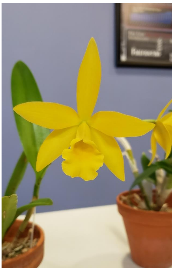
Rby. Golden Tang