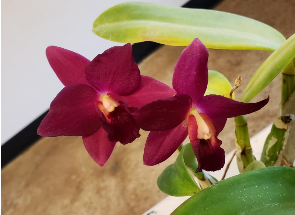
Rth. Cape Scarlet Glow 'NN'