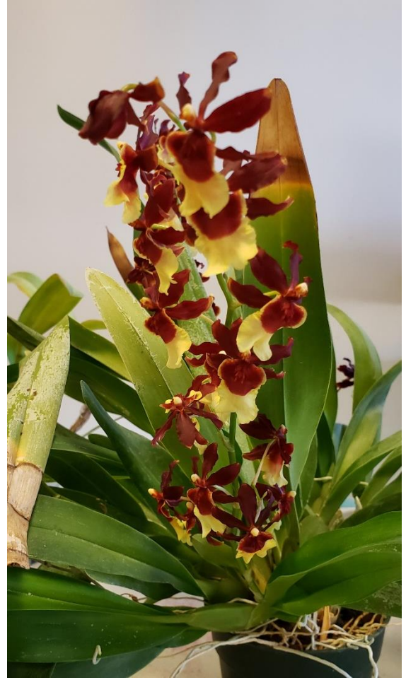
Onc. Volcano Hula Halau 'Volcano Queen'