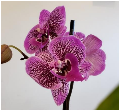
Phal. Tying Shin ___ ‘TS110’ (not yet named)

Correction to November 2021 Show and Tell Pictures – The names on two of Amal’s blooms below were switched in last month’s newsletter. The correct names and pictures are below.