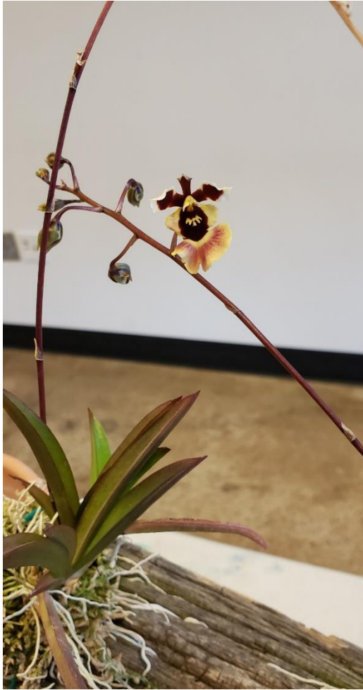
Tolu. Jairak Flyer