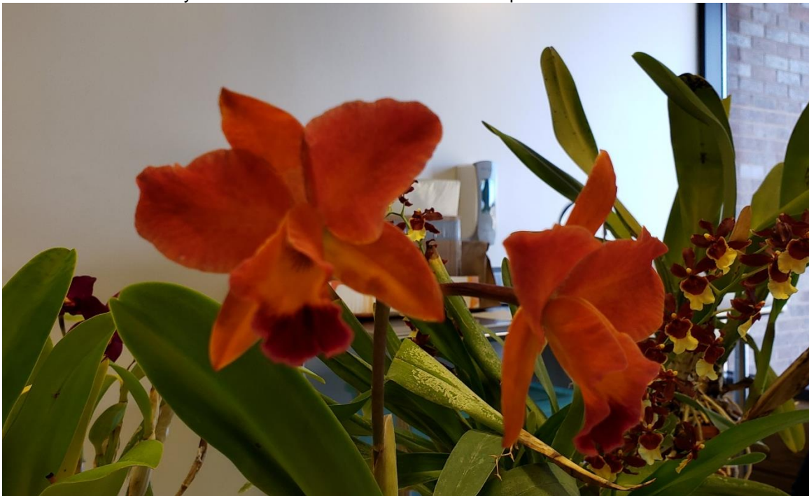
Rth. Princess Su-Lyn