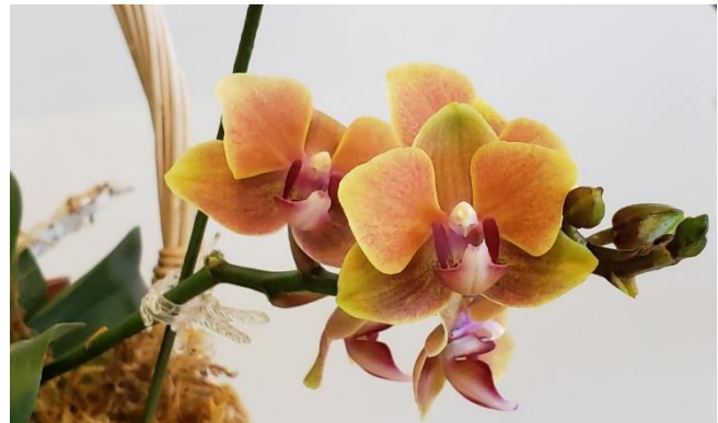
Phal. NOID (anaconda lip type)