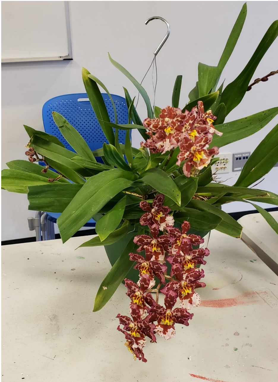
Ons. Eye Candy 'Pinkie' AM/AOS grown by Amal Cooke