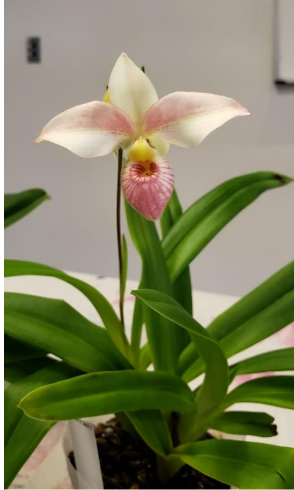
Phrag. 'Hanne Popow'