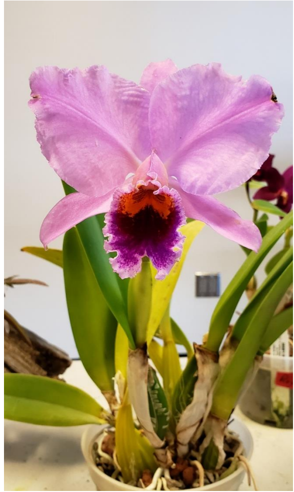
C. percivalliana 'Summit' FCC/AOS