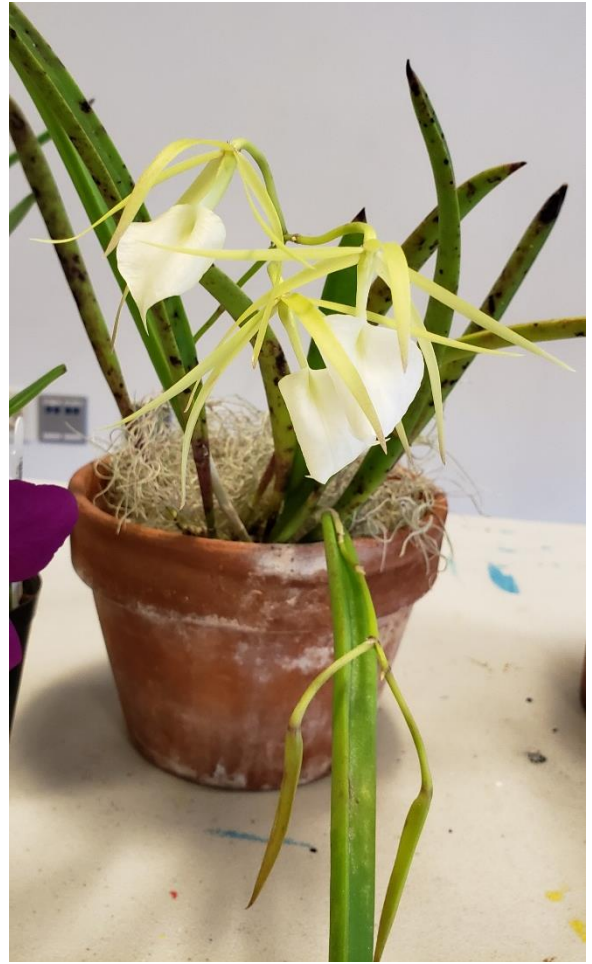
B. Little Stars