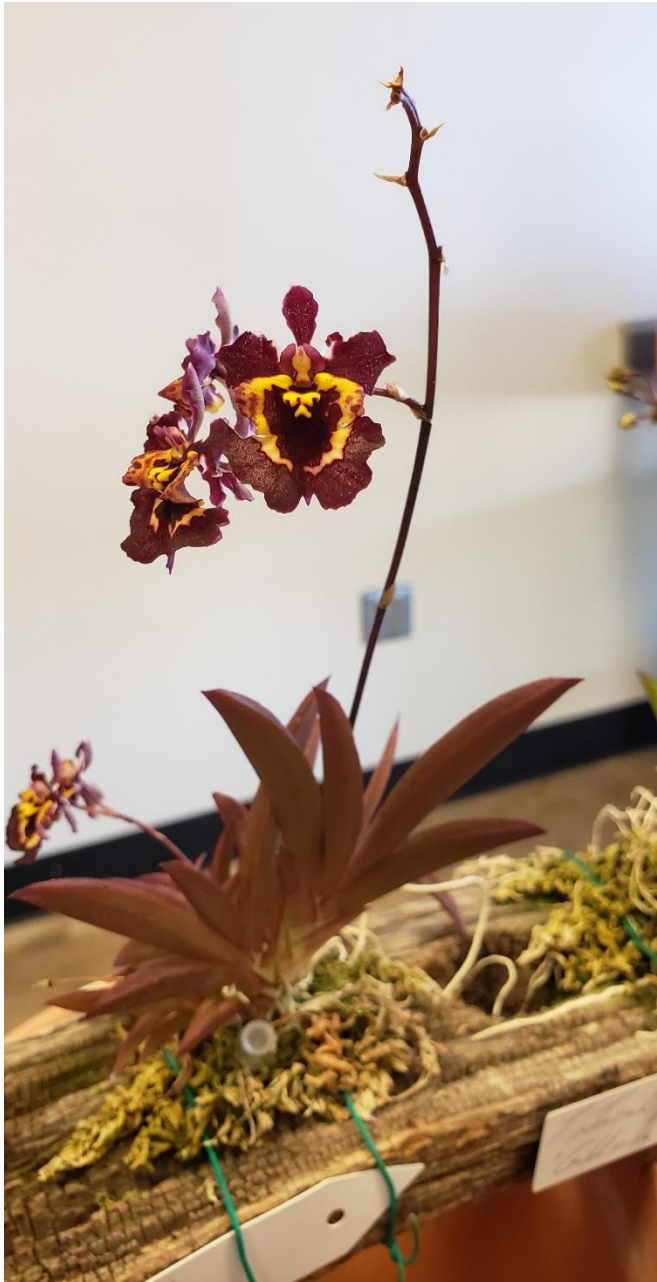
Tolu. Jairak Firm 'Hickory'

And two more of Roger's December Blooms: