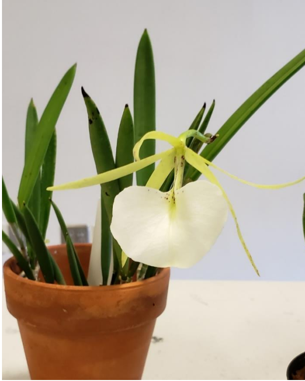
B. nodosa (Belize 84)