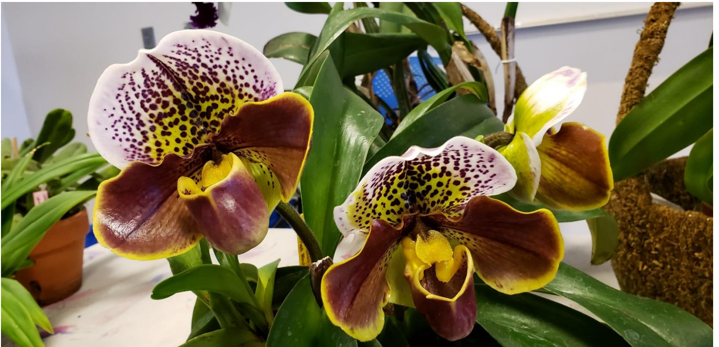
Paph. Perfect Spots