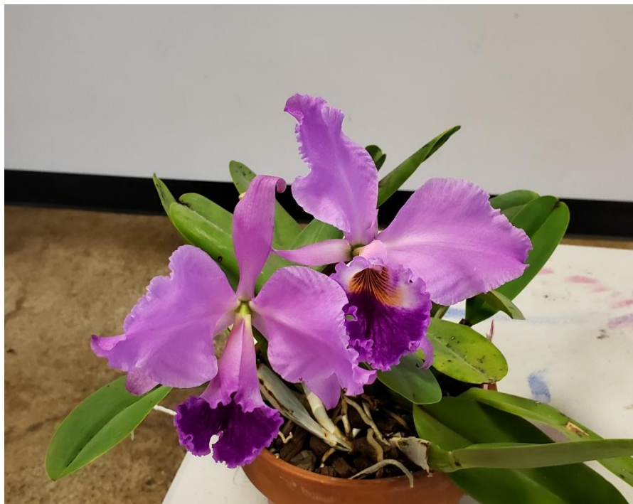
Cattleya labiata (h.f. rubra)