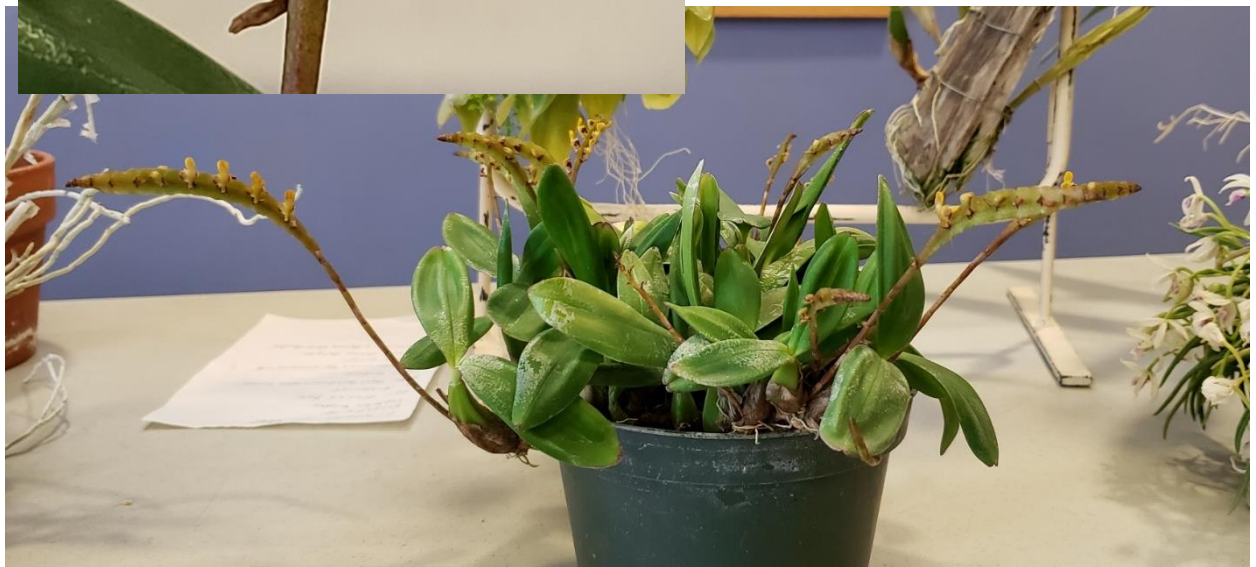
Bulb. falcatum (h.f. flavum ) 'Gold Country' HCC/AOS