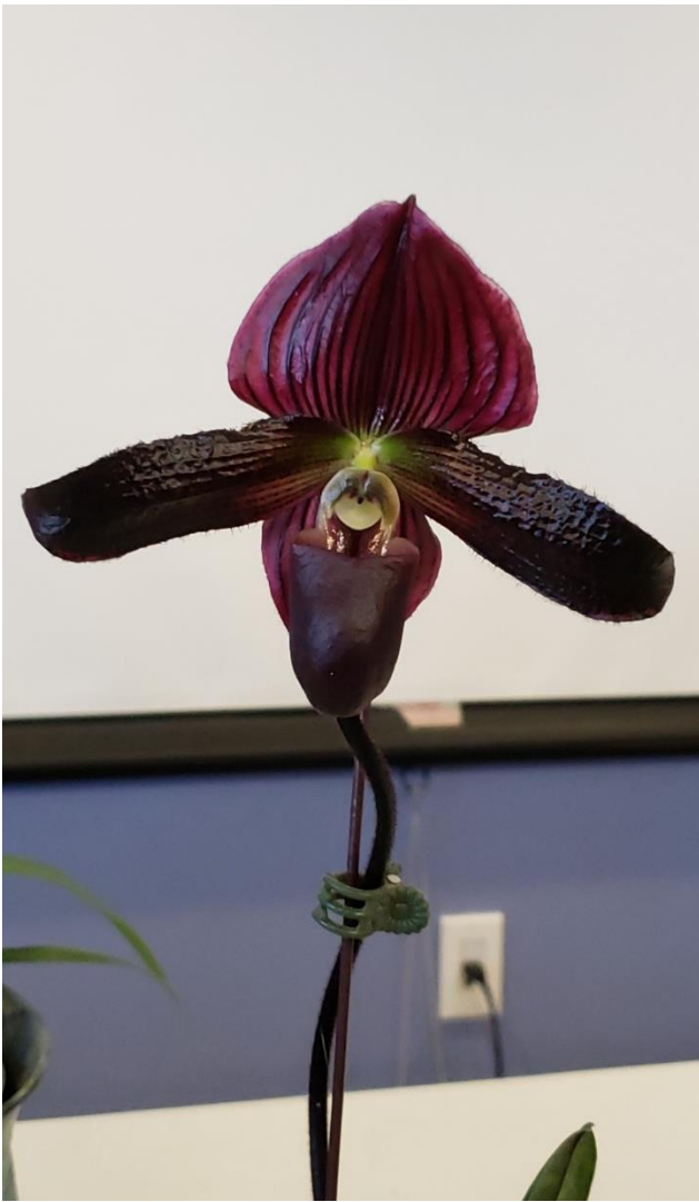
Paph. Tristar Mabo