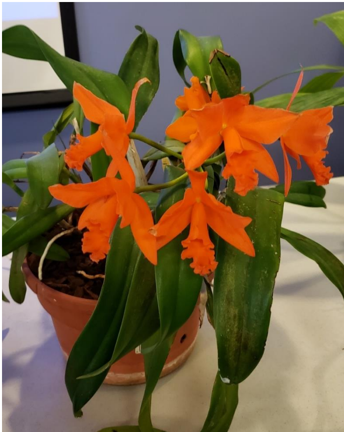
Rth. Love Passion 'Orange Bird' AM/AOS