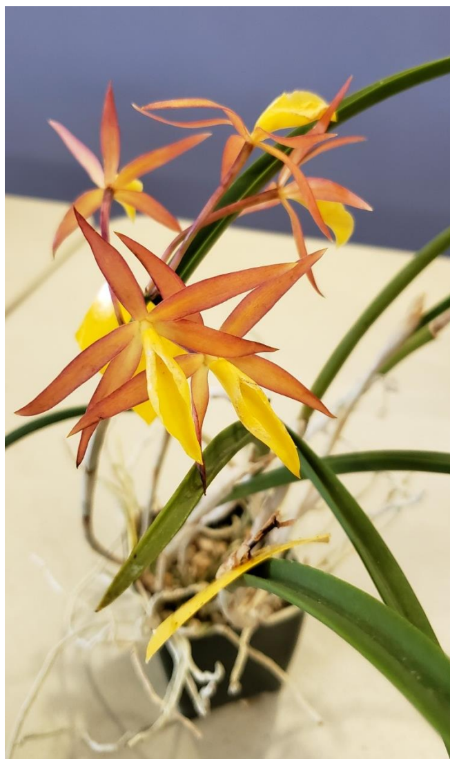
Bsn. Sunny Delight