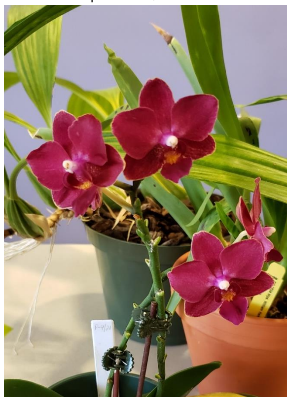
Phal. hybrid (dark rose)