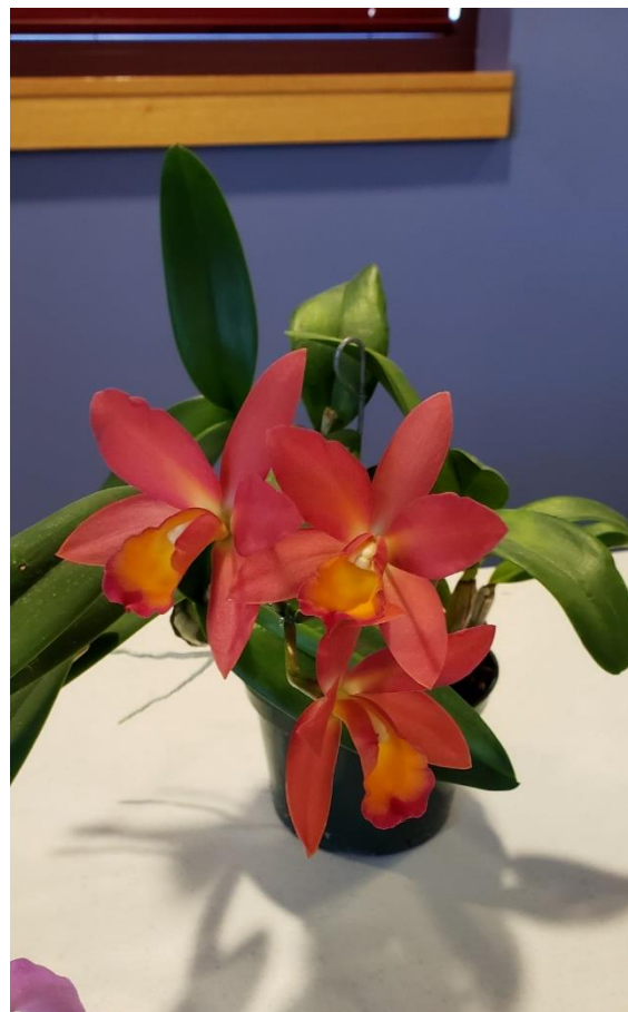
Ctt. Caribbean 'Orange Bowl' HCC/AOS