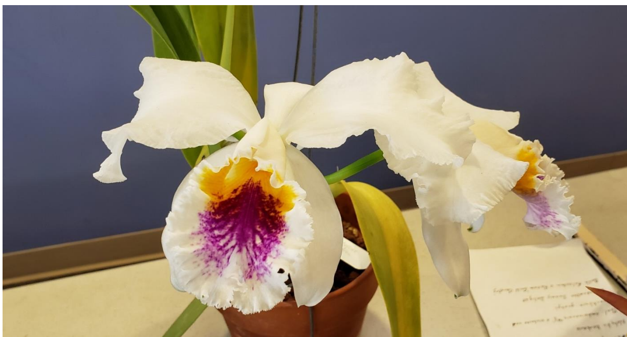
C. mossiae (h.f. semialba)