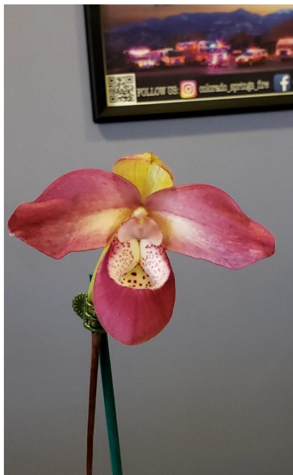
Phrag. Ecuagenera Dream

A few of Lois Dauelsberg's April Blooms: