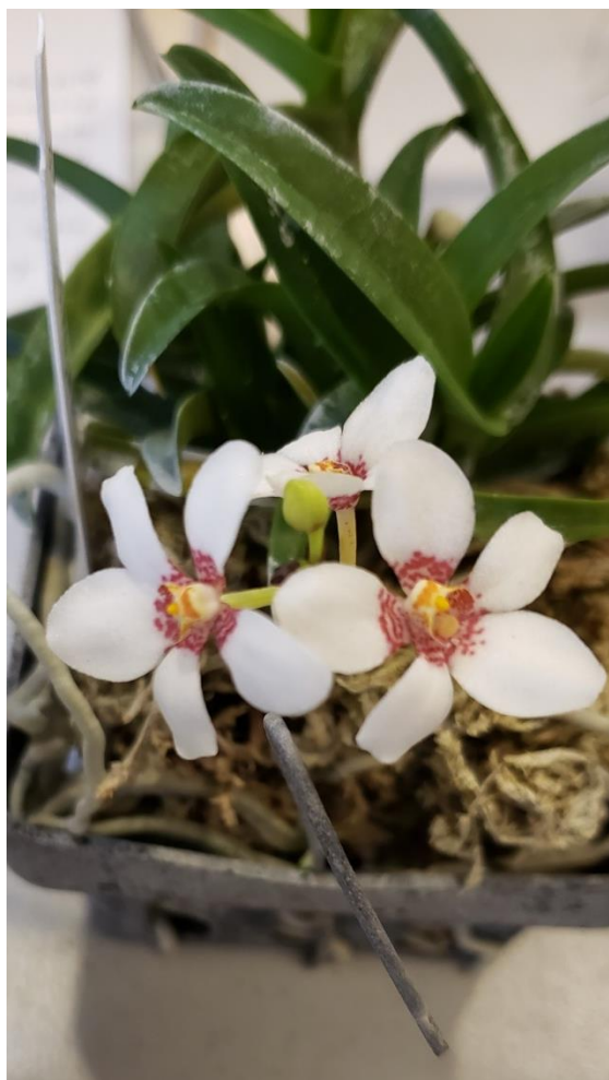
Sarco. (Royal Red x Camira White '50 Cents')