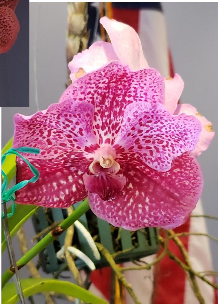
V. Crownfox Avocado Honey