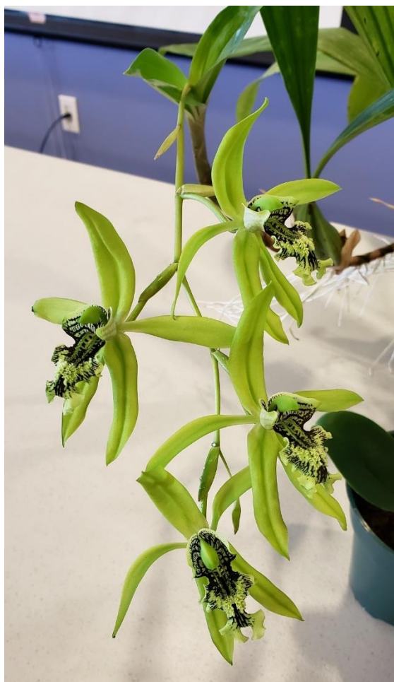
Coel. mayeriana x self