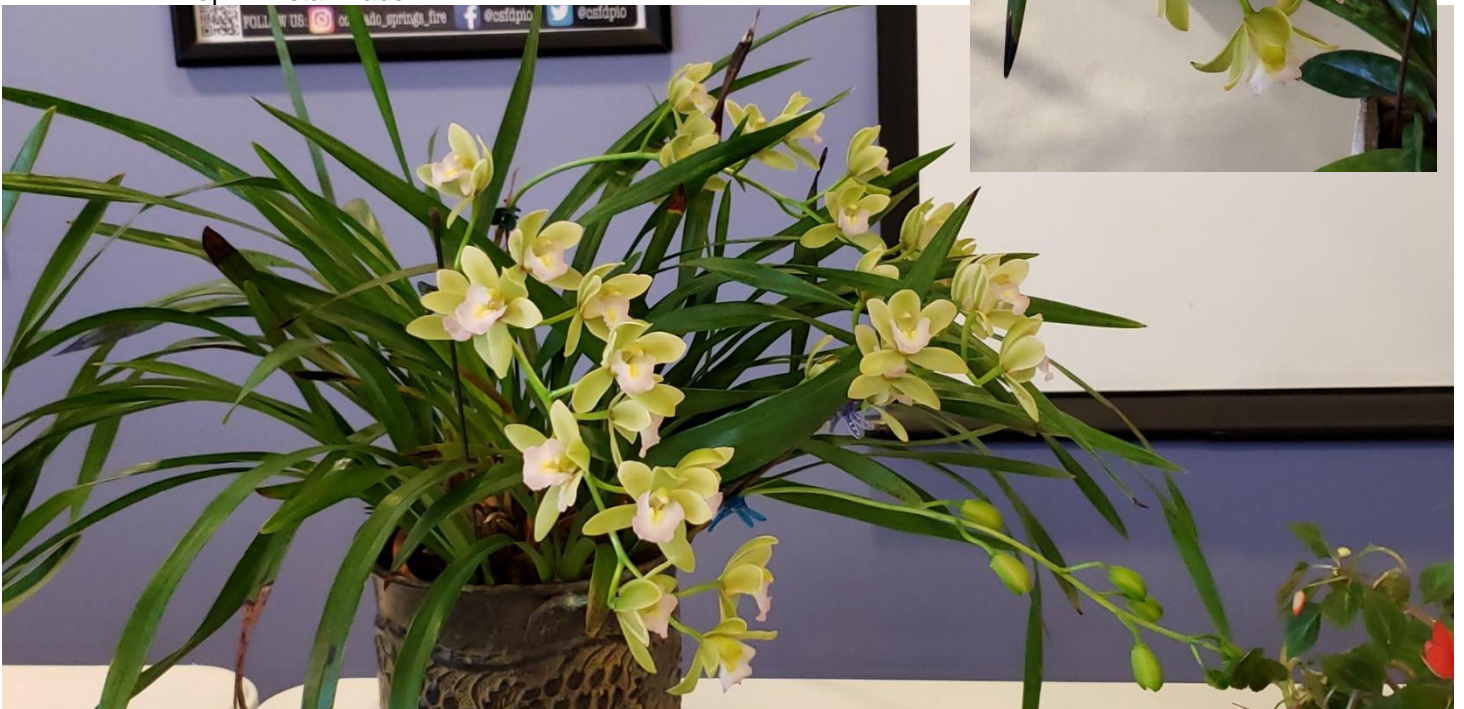
Cym. Sweetheart 'Spring Pearl' AM/AOS