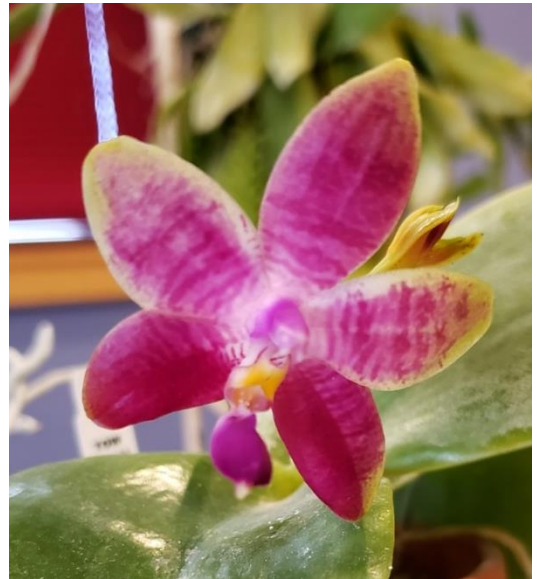
Phal. Princess Kaiulani