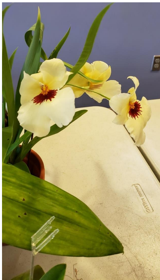
Mps. Kaila Quintal