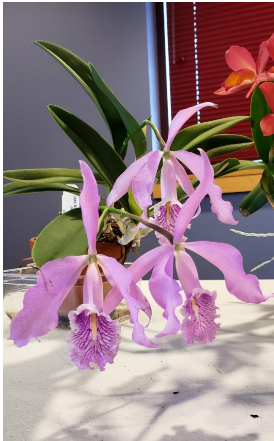
C. maxima (h.f. coerulea )