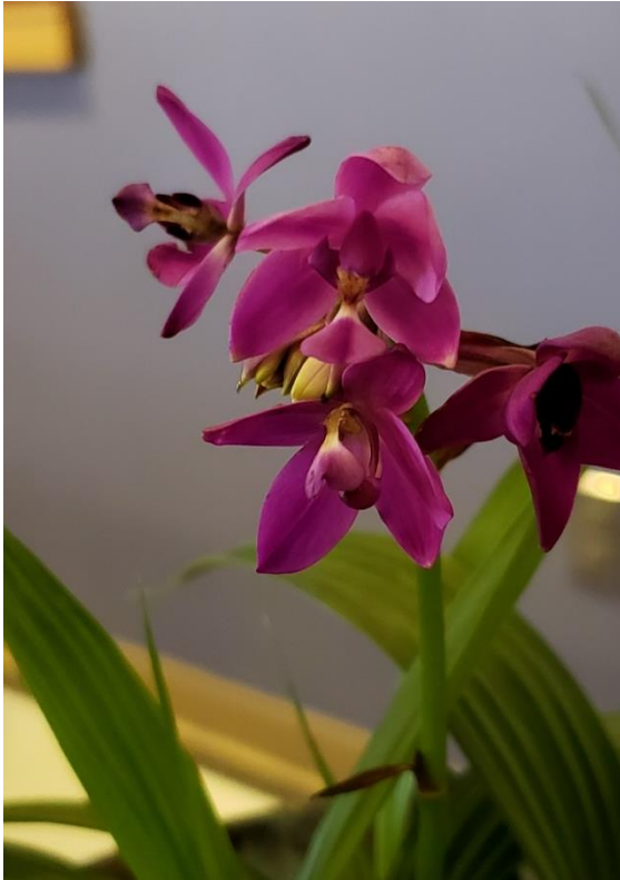
Unknown Orchid (from Ace Hardware)