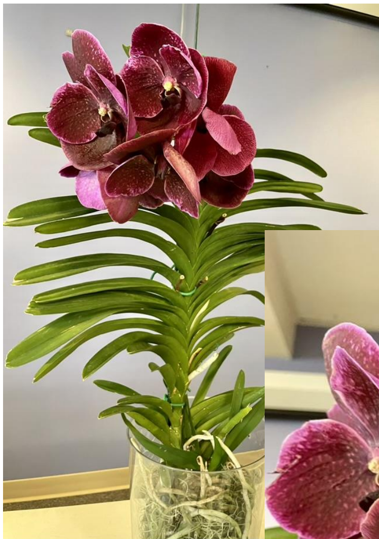
V. Robert's Delight 'Red'