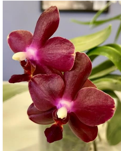
Phal. Pylo's Princess