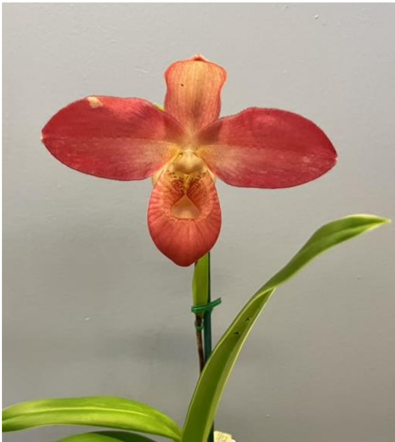
Phrag. Ecuagenera Dream