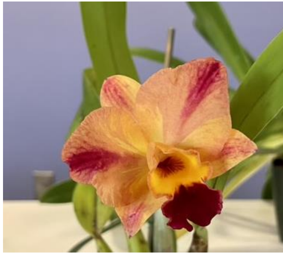
C. Tokyo Life