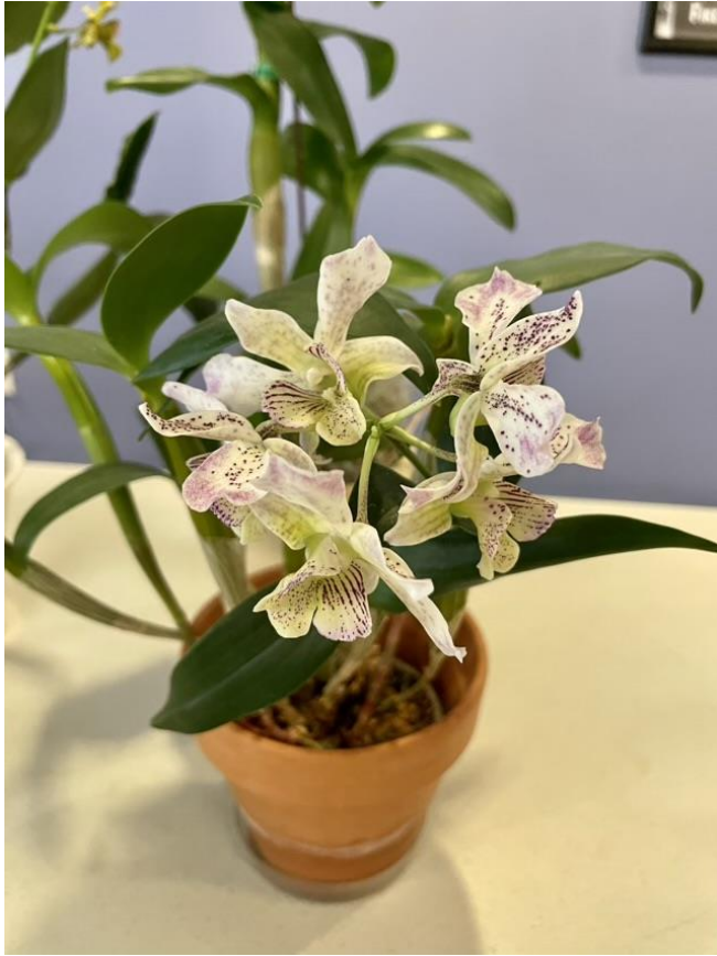
Den. (Royal Chip x Roy Tokunaga)