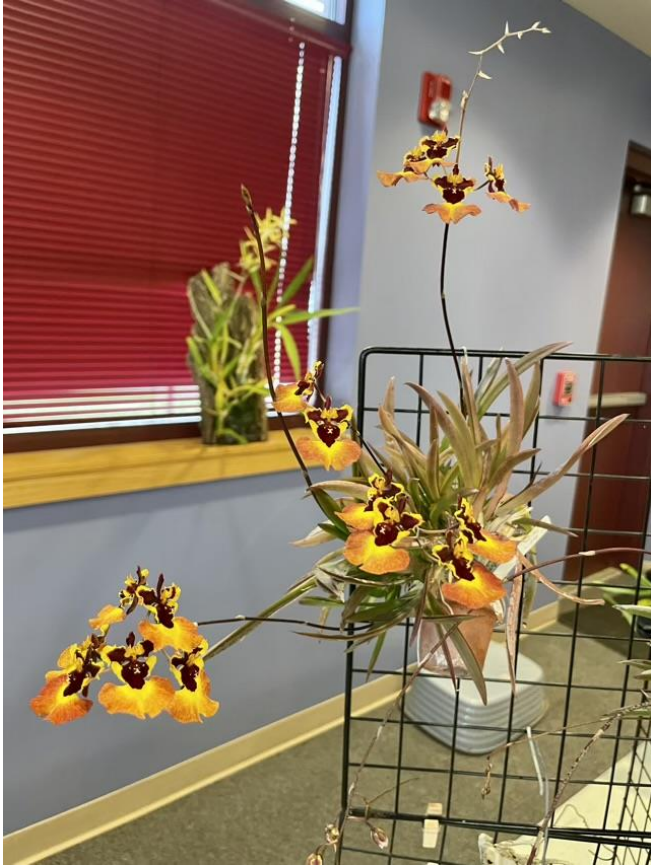
Tolu. Genting Orange