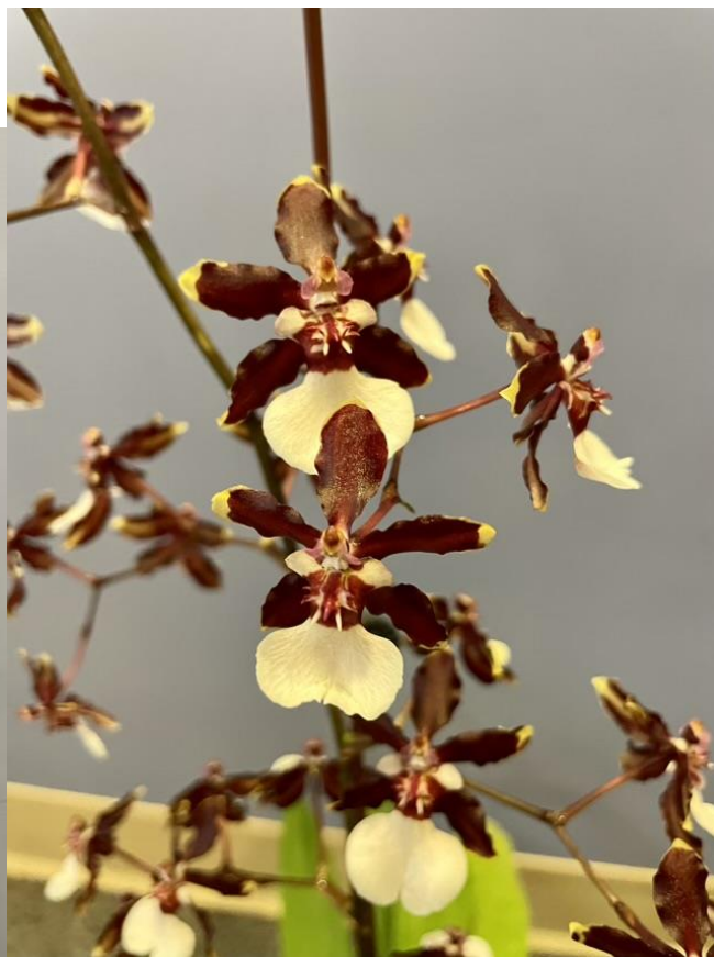
Onc. Odorous Princess 'Y H Twinstar'