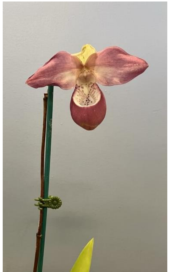
Phrag. La Vingtaine