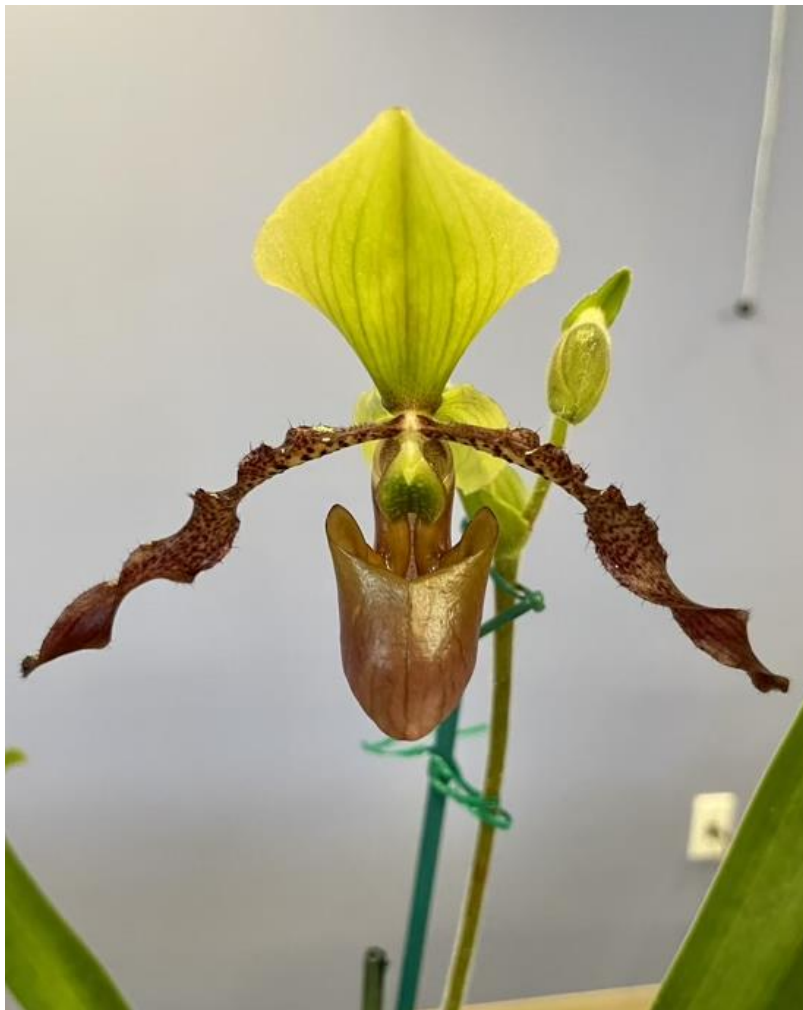
Paph. Vicky's Twirls