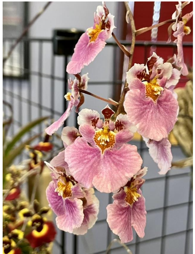
Tolu. Keyes Oka