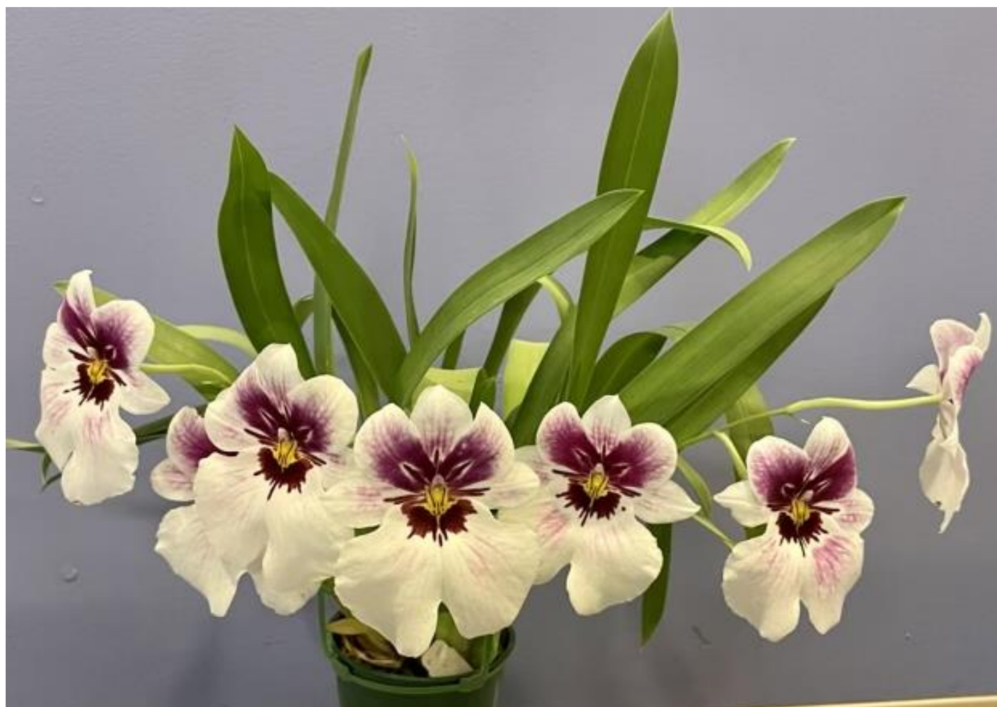
Mps. White Truffle