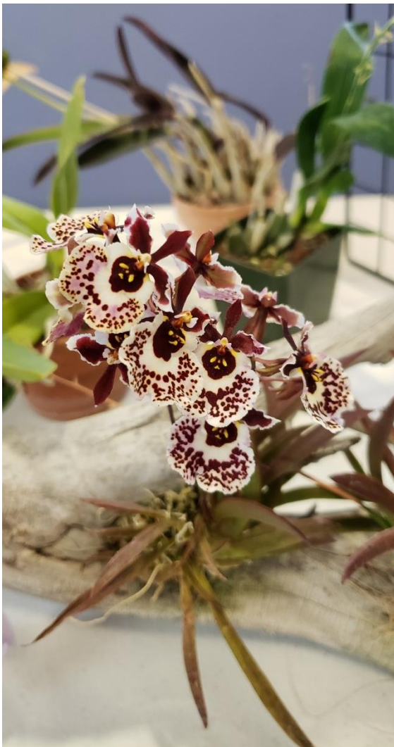
Tolu. Jairak Firm 'Mocha Spots'