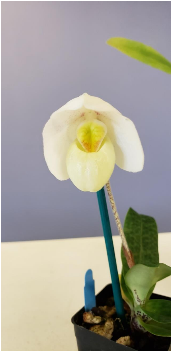
Paph. Sugar Suite