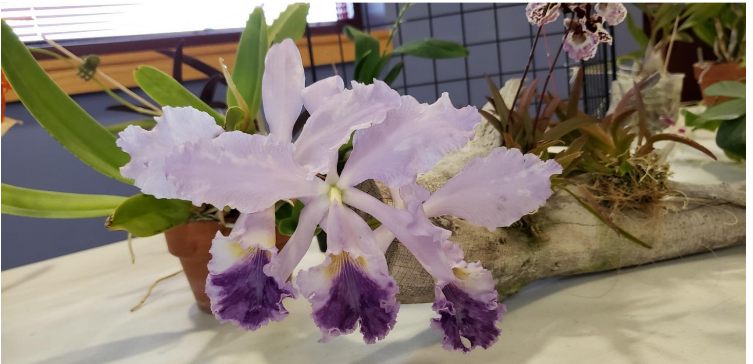
C. warneri (h.f. coerulea )