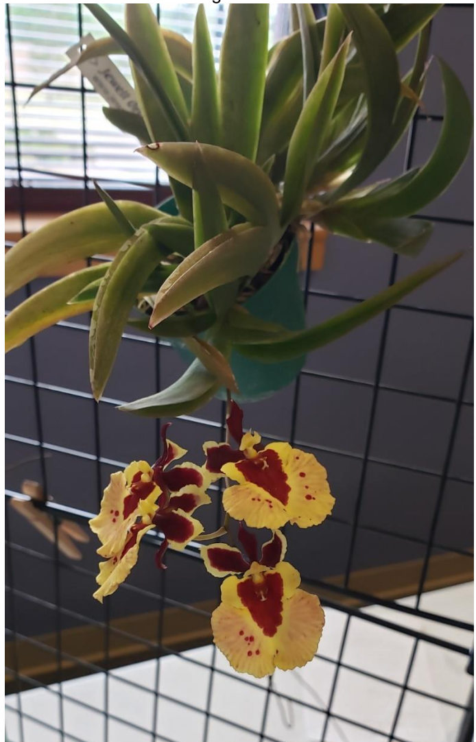
Tolu. Esther Oka 'Lakeview'