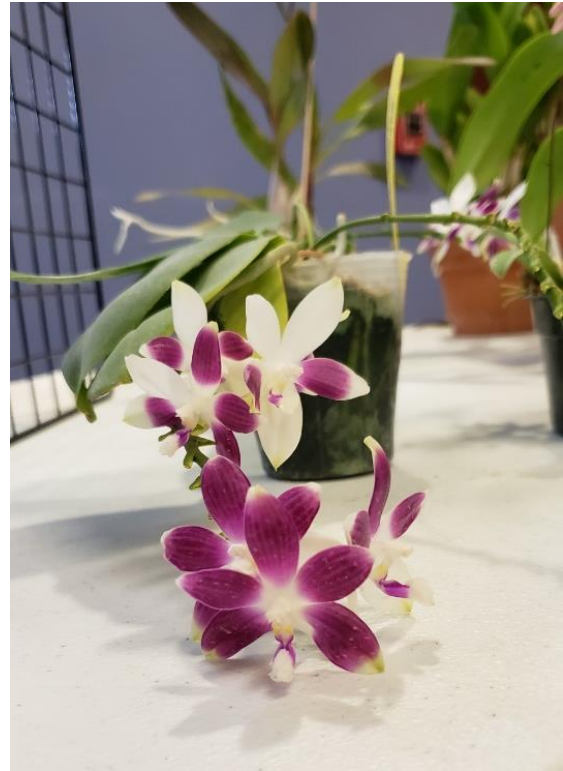
Phal. speciosa 'Mainshow'