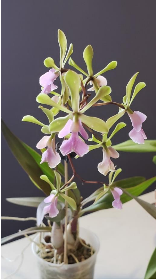
Epy. Serena O'Neill