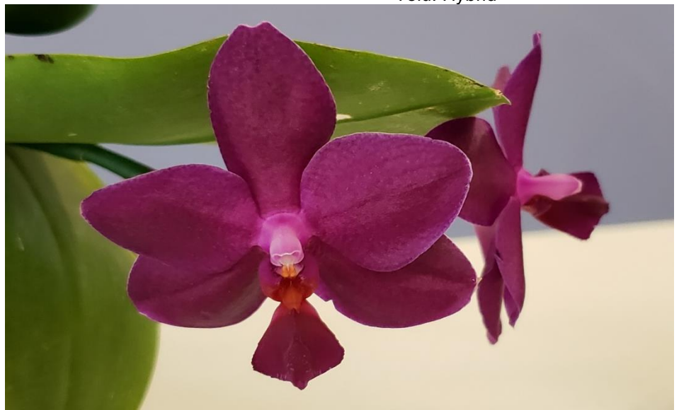
Phal. YangYang Black Grape