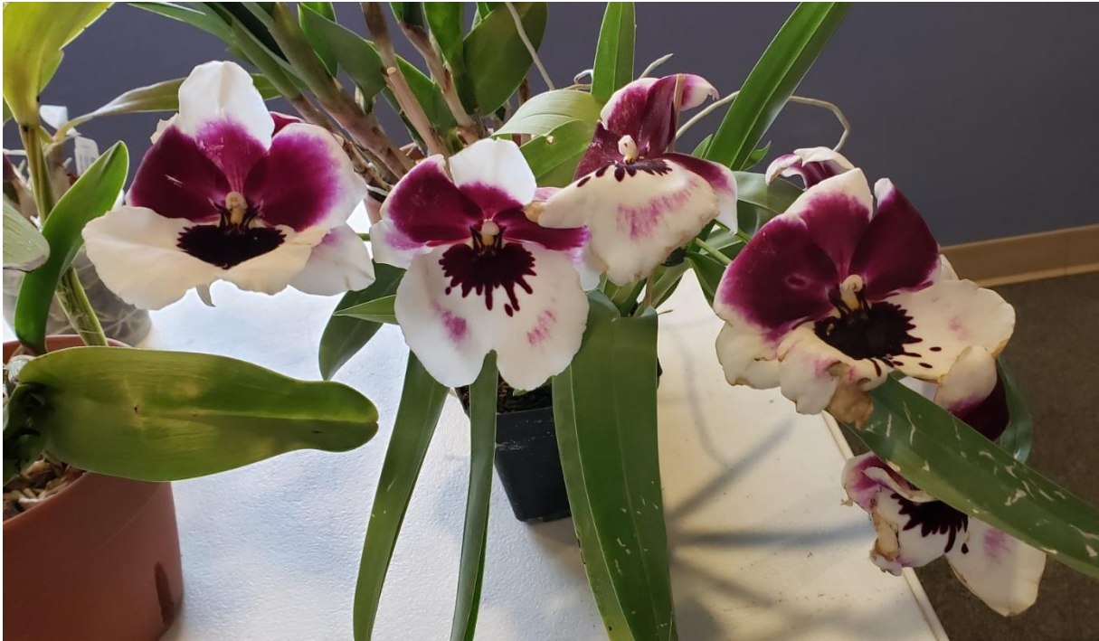
Milt. Unknown 'King Soopers'