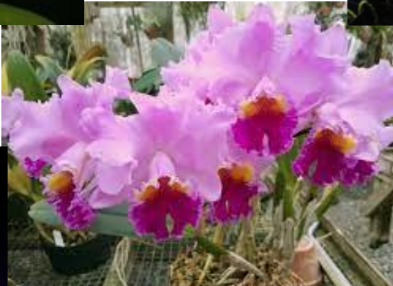
Lc. Ptarmigan Ridge 'Mendenhall'