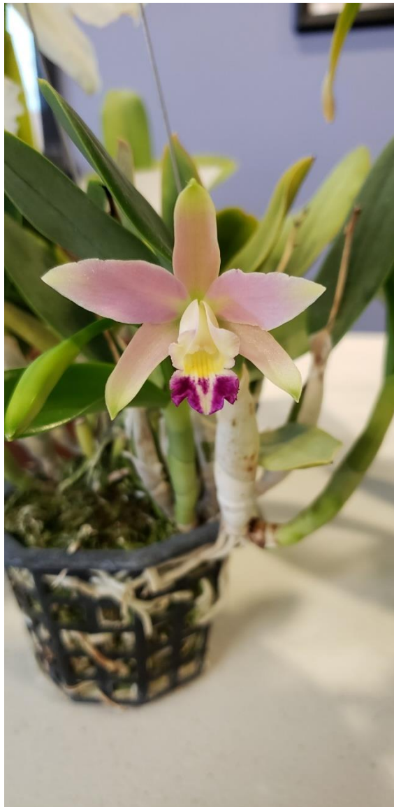
Lcn. Long Life Angel 'Paradise'