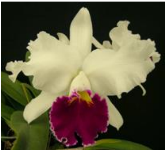
Ble. Toshie's Magic 'Doris'

Wishing you & your family a Merry Christmas & a Happy New Year. The Colorado Springs Orchid Society