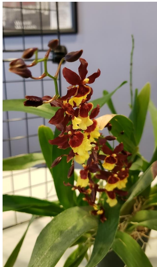
Onc. Volcano Hula Halau