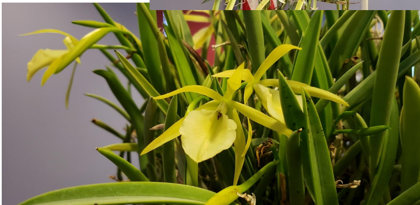
Rvt. ((B.) nodosa x (Ryn.) Daffodil)