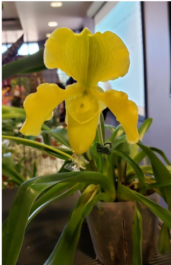
Paph. Charmingly Golden