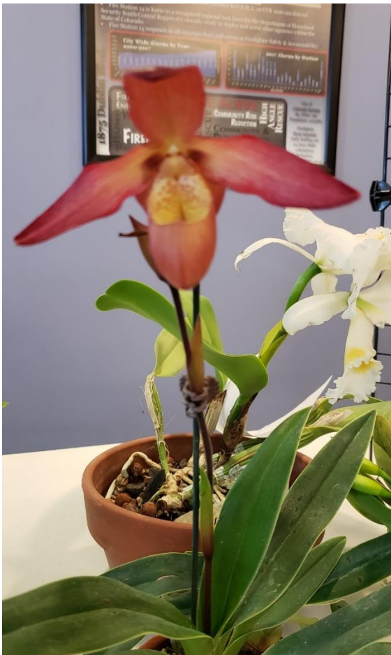
Phrag. Inca Embers