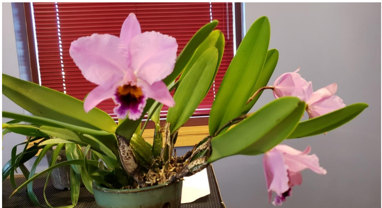
C. percivaliana 'Summit' FCC/AOS