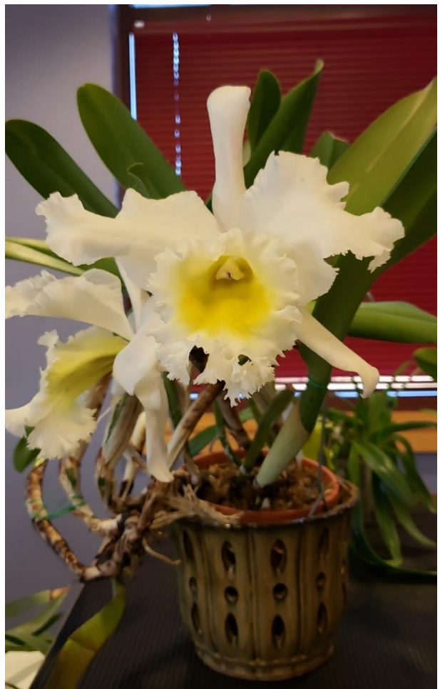
Rlc. Mount Hood 'Mary' AM/AOS