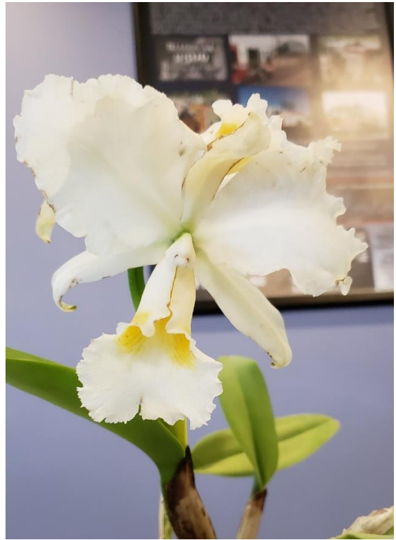
C. Jewell's Slokje