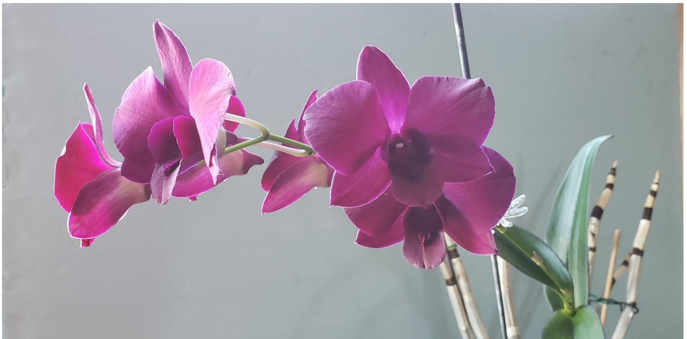
Den. Madame Vipa x Den. Burana Emerald