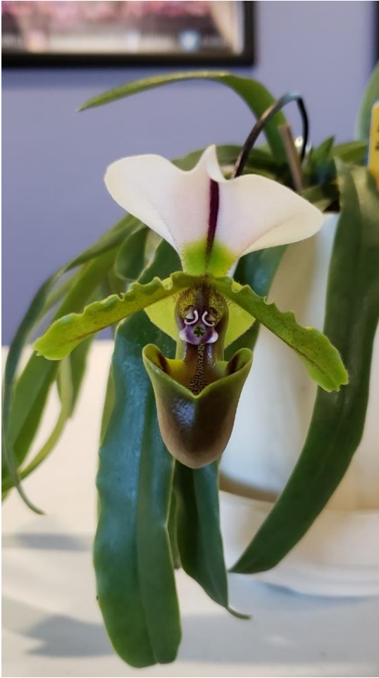
Paph. spicerianum '#2' grown by Alison Dino