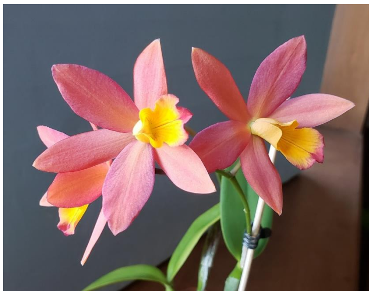
Ctt. (Orchidglade 'Trout' x C. milleri 'Big Island')