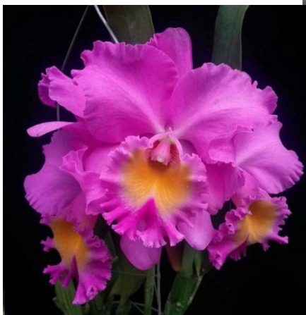
Ble. Triumphal Coronation 'Seto'