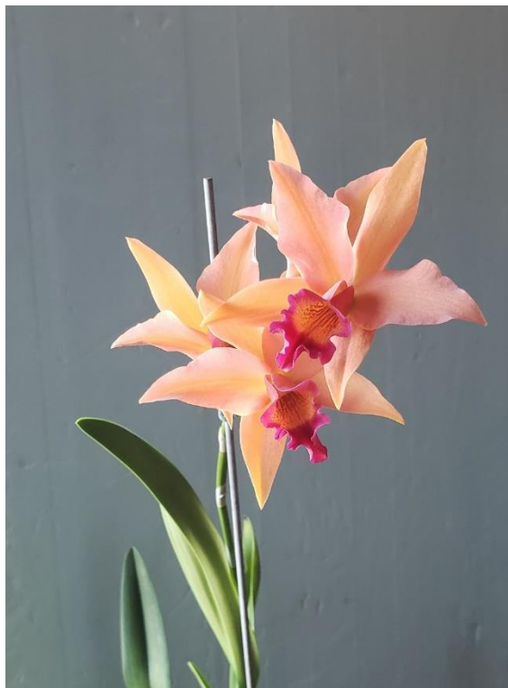
Rchg. Ancep Passion