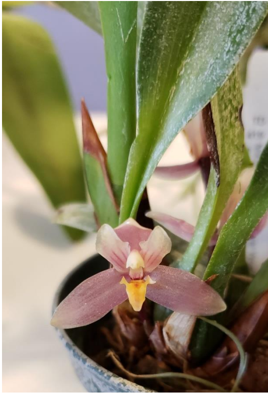
Max. richii 'Natural World' CBR/AOS