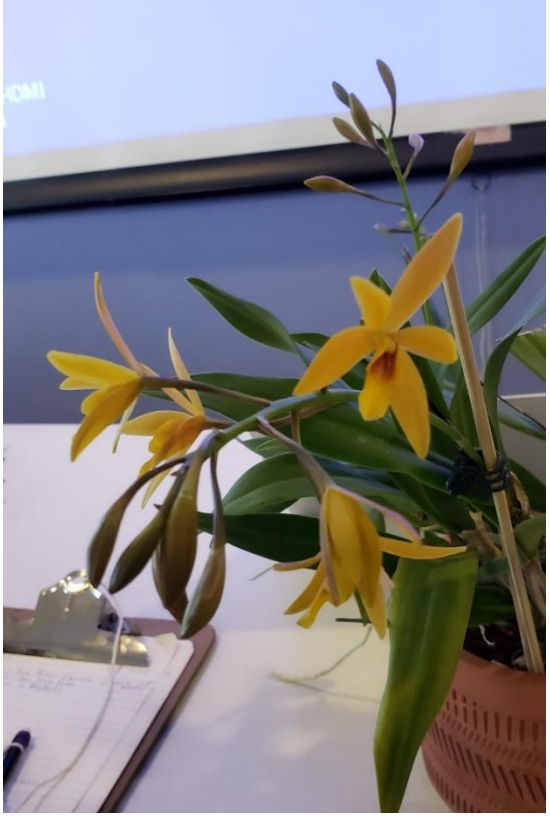
Ett. Butterfly Kisses 'Mendenhall' AM/AOS