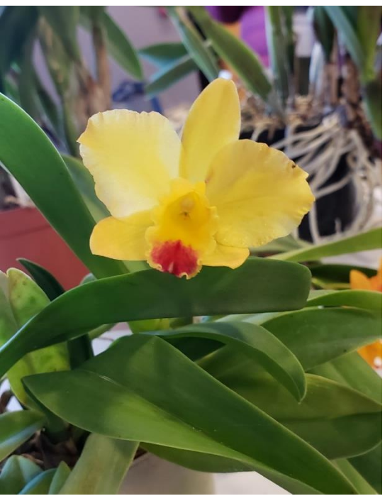
C. Mango Spice