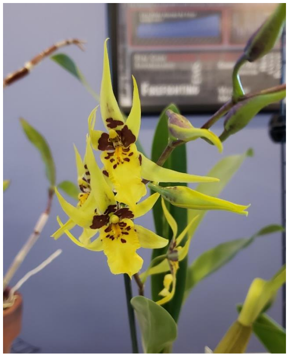
Aranda. Yellow Star 'Golden Gambol'