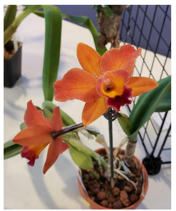
Rth. Princess Su-Lyn