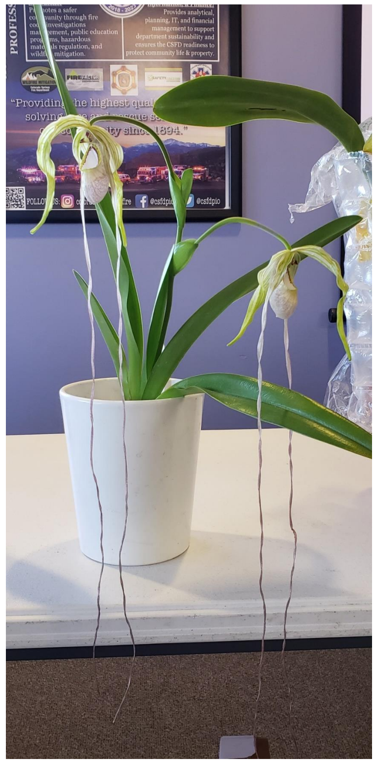
Phrag. warszewiczianum (var. wallisii) grown by Amal Cooke