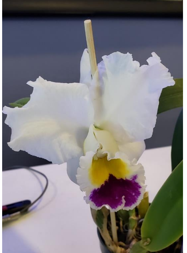
C. Lake Wateree 'Mendenhall' x C. Melody Fair 'Mishima'