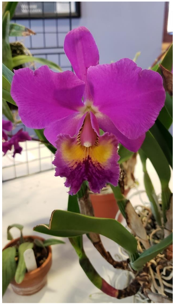
Rlc. Encantos en Grande