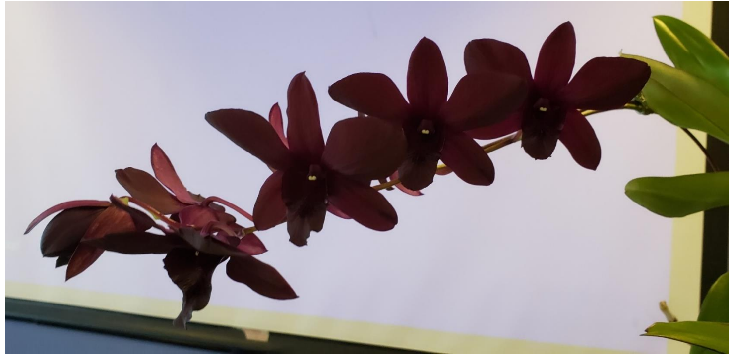
Den. Hawaiian Velvet x Den. Wave Rider