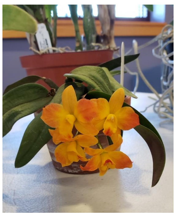
C. Seagulls Tiny Tim