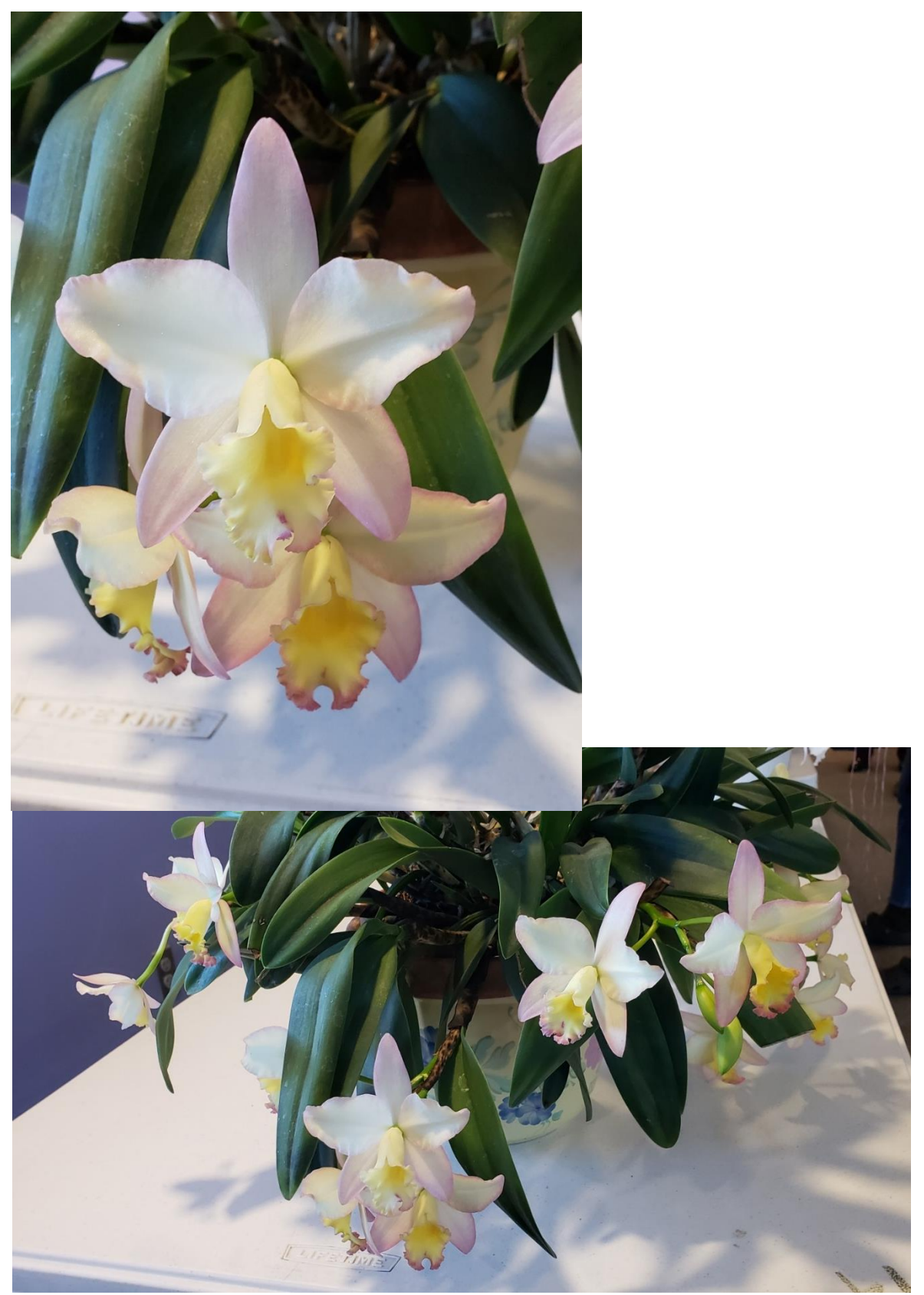
Ctt. Fairyland 'Ai' grown by Cheryl Graysar