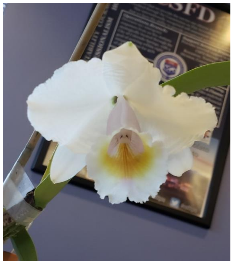
C. quadricolor grown by Kaoru Stabnow