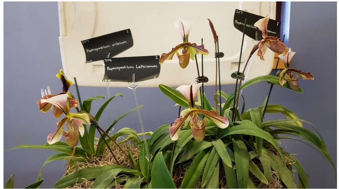
Paph. spicerianum, Paph. villosum and Paph. lathamianum