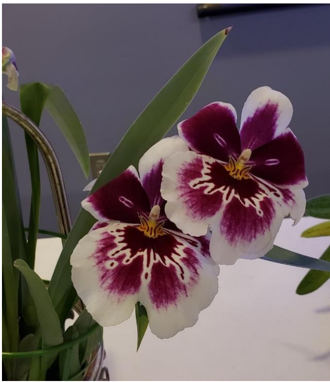
Mps. Rouge 'Calf Plum'