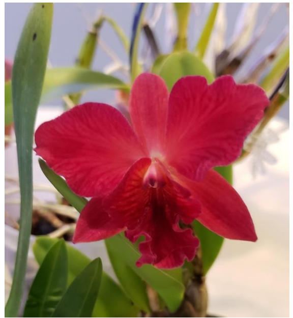
Pot. Rubescent Fire 'Fire Bomb' x Pot. Martha Clarke 'Bali Flare' HCC/AOS