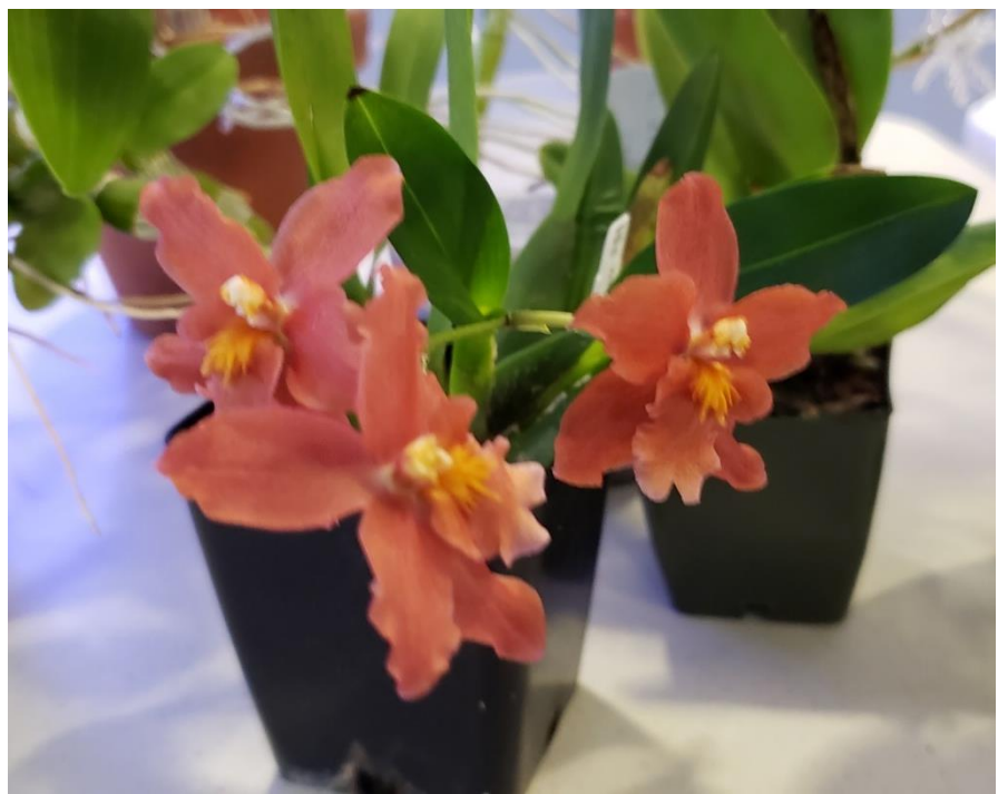
Wils. Space Mine 'Red Rendevous' AM/AOS