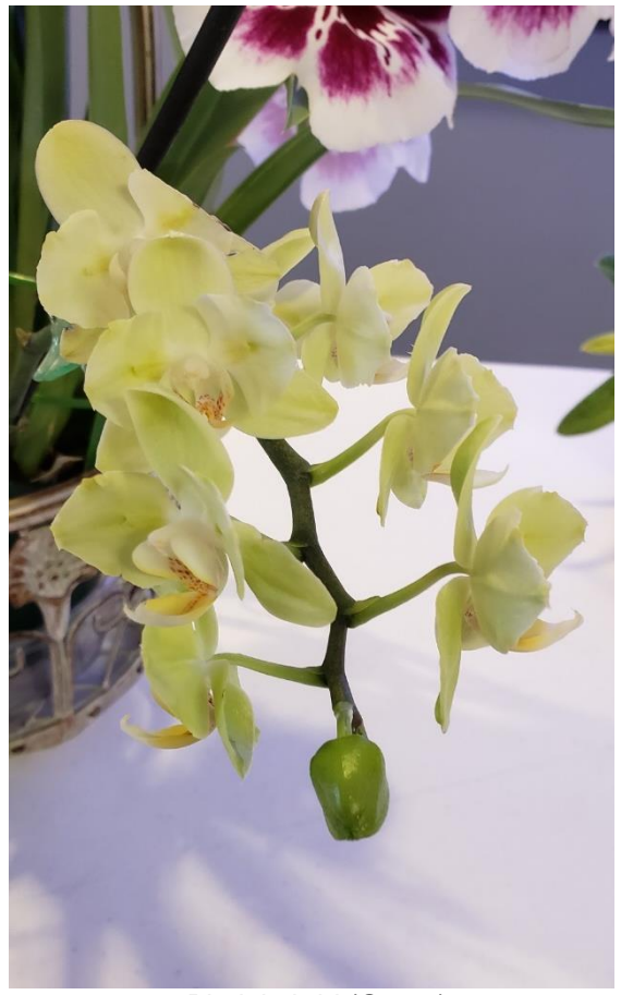
Phal. hybrid (Green)