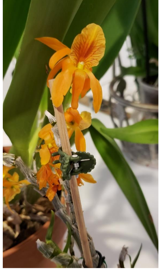
Den. Stardust 'Firebird' HCC/AOC