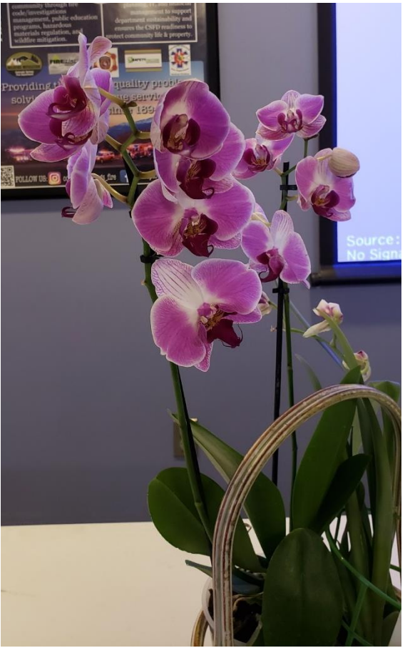
Phal. (Tinny Honey x Jiuhboa Rose)