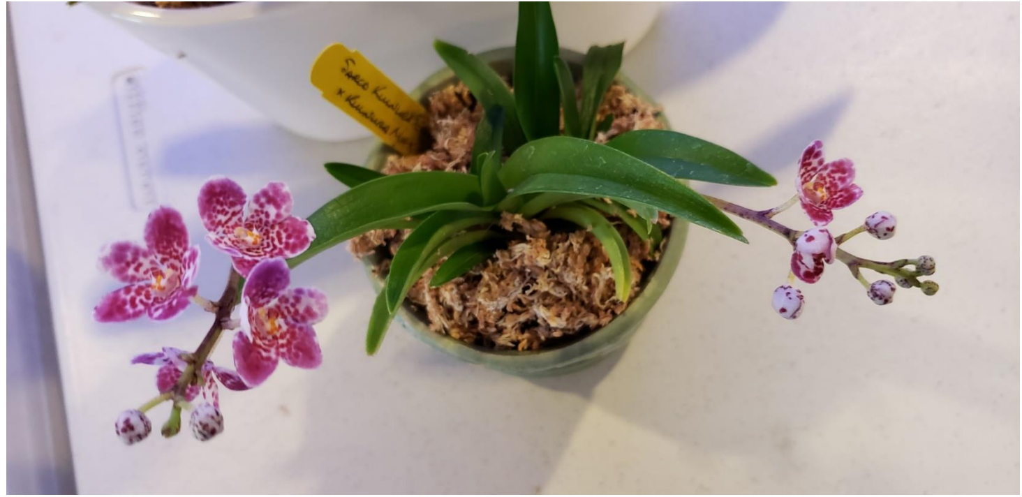
Sarco. (Kulnura Secure x Kulnura Max)