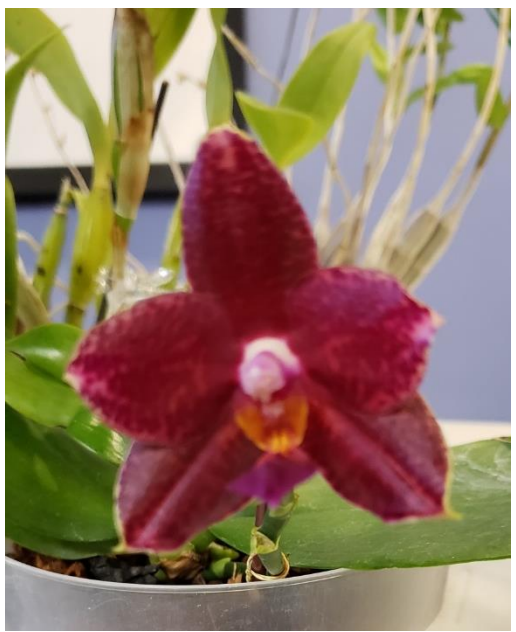
Phal Yang Yang Hawaii Girl