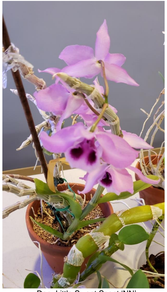
Den. Little Sweet Scent 'NN'