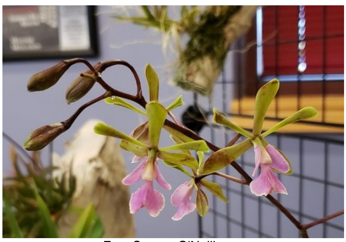
Epy. Serena O'Neill