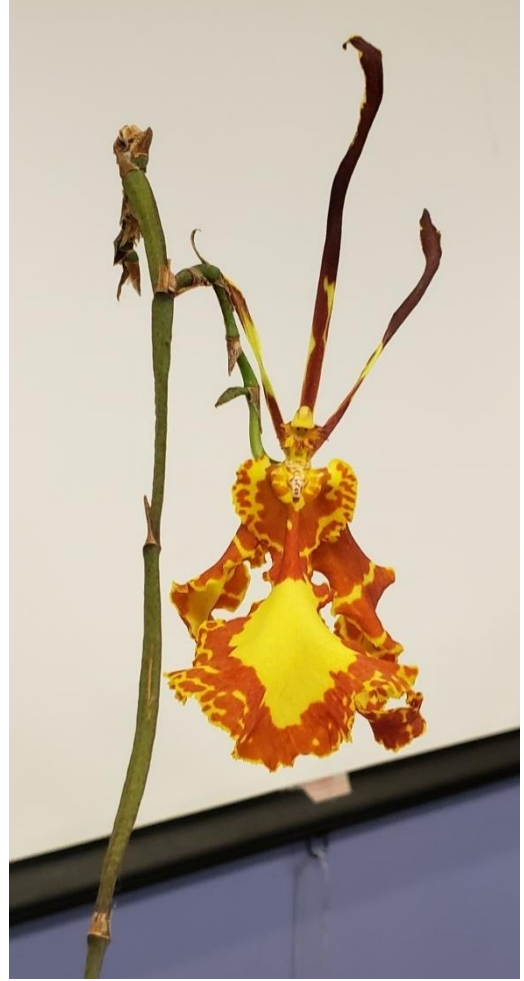
Onc. Mendenhall 'Hildos' AM/AOS

Now is a good time to consider how the conditions in your growing area are changing with the season. Even in a home with central air conditioning, areas that were cool growing orchid friendly in winter and spring may prove inhospitable in summer, and a rearrangement may be in order. Summer sun could also mean an extra sheer curtain is needed or an extra fan to ensure warmer air stays on the move, keeping fungal infections at bay. Higher light levels and temperatures in summer also translate into the most active growth period for many orchids. Active orchids "eat" more and nutrient requirements for many are also at their peak this time of year.