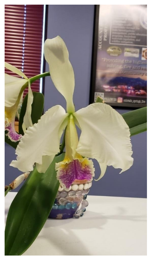
Cat. mossiae semi-alba