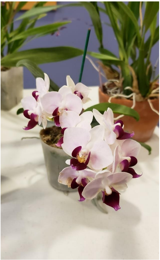
Phal. Younghome Little Spirit