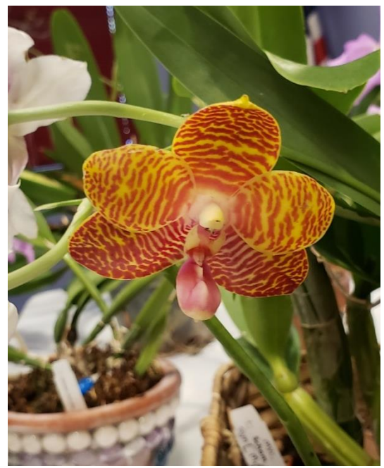
Phal. Joy Auckland Beauty