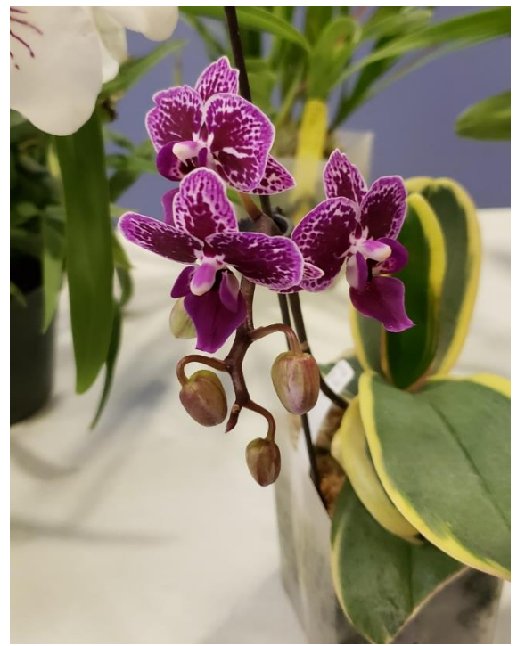
Phal. Chia E Yenlin