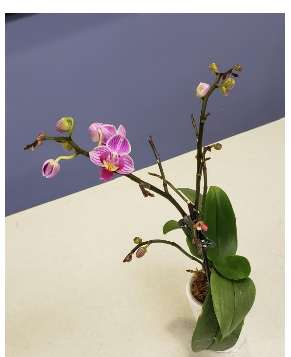
Two Phal. Unknowns