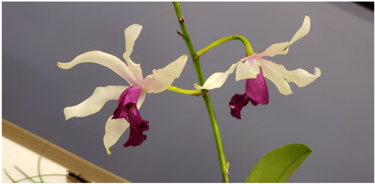
Schom. albopurpurea x C. violacea semi-alba