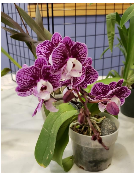
Phal. Norman's Burgundy Twinkle