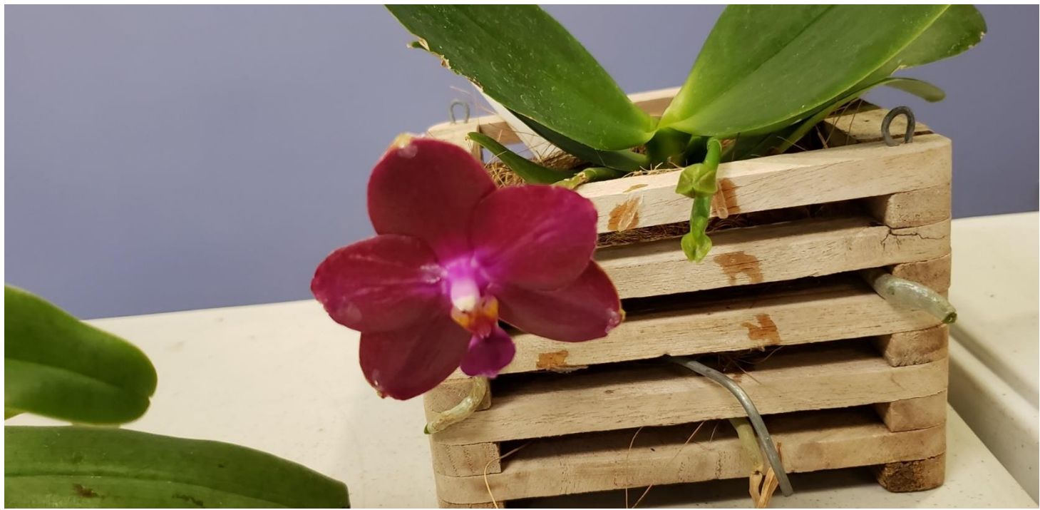
Phal. Pylo's Girl 'Best Red'