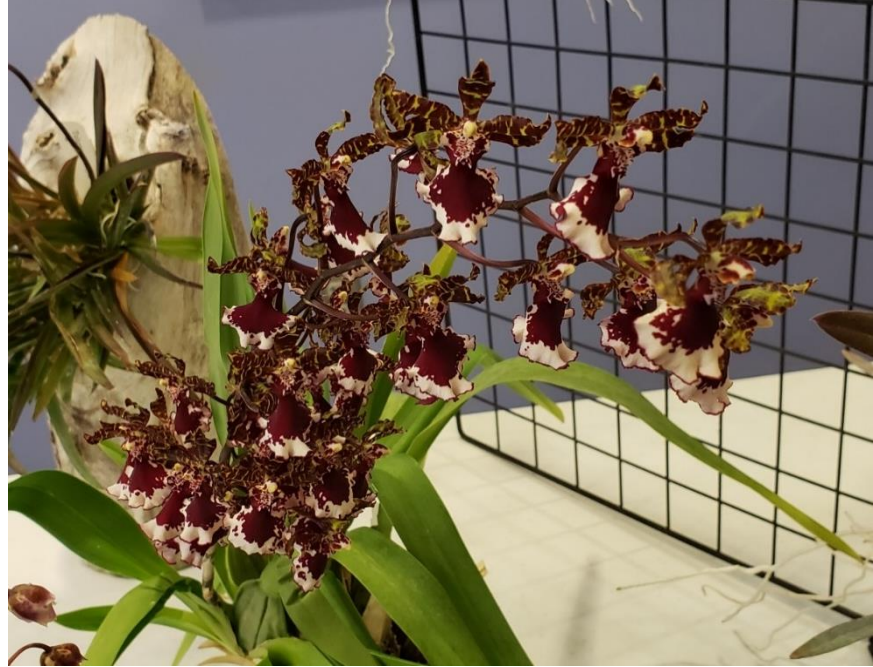
Ons. Everglades Elegance 'Nancy Lee' HCC/AOS