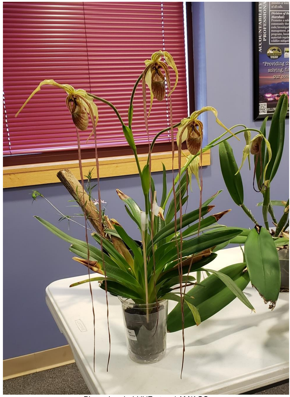
Phrag. humboldtii 'Fortuna' AM/AOS