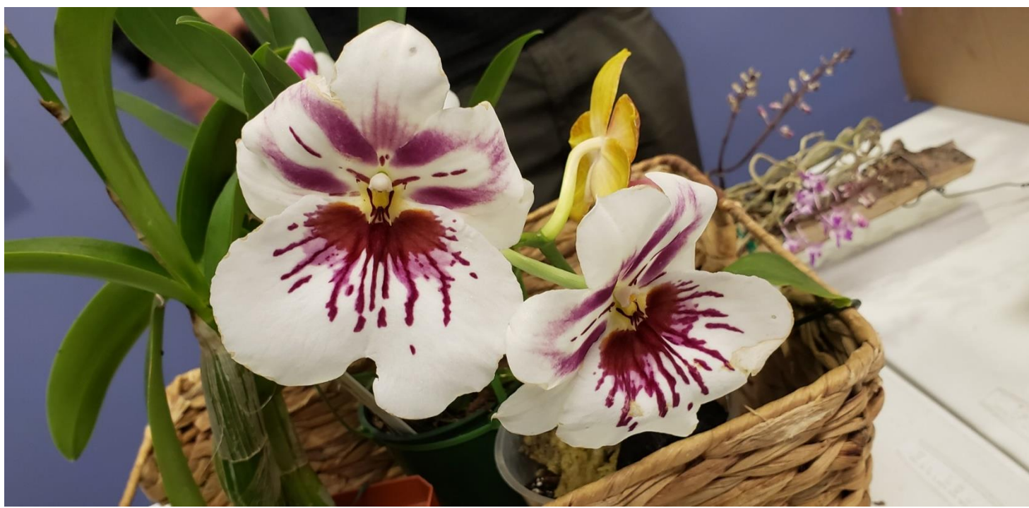
Milt. White Truffela "Bright Eyes'