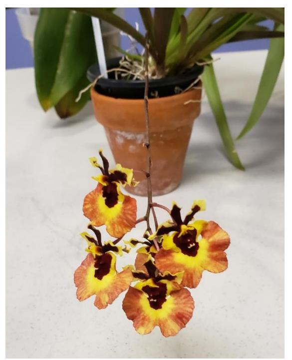
Tolu. Tequila Sunrise