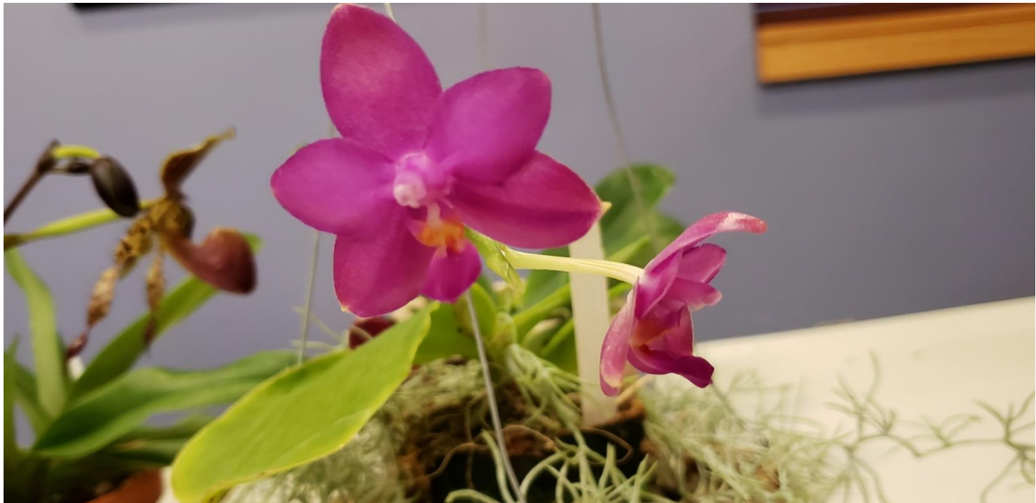
Phal. _____ 'Purple' (Mituo Sun Queen 'Lotus' x Samera 'Mituo #1')