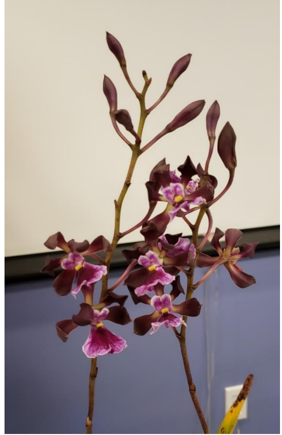
E. Nursery Rhyme