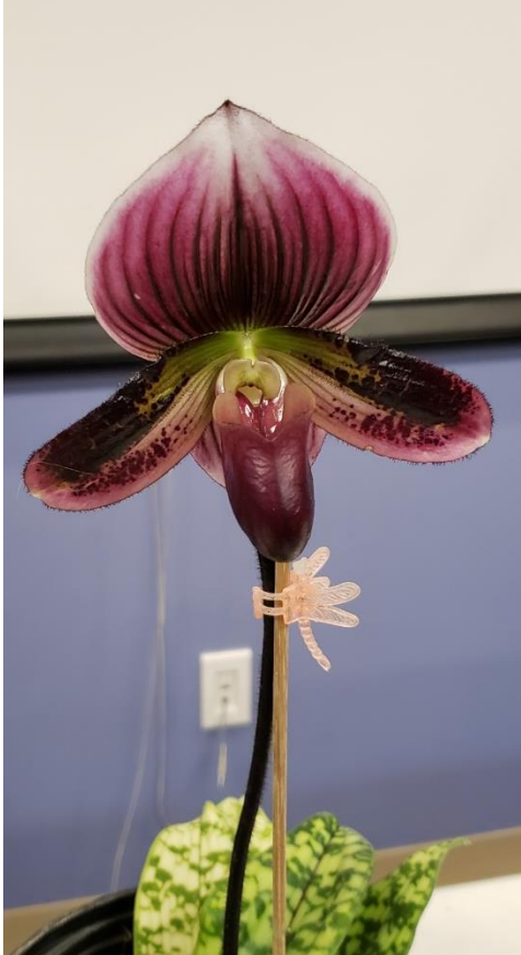
Paph. ((Hilo Ruby x Hilo Merlot) #1 x Captivatingly Wood 'Fireworks')