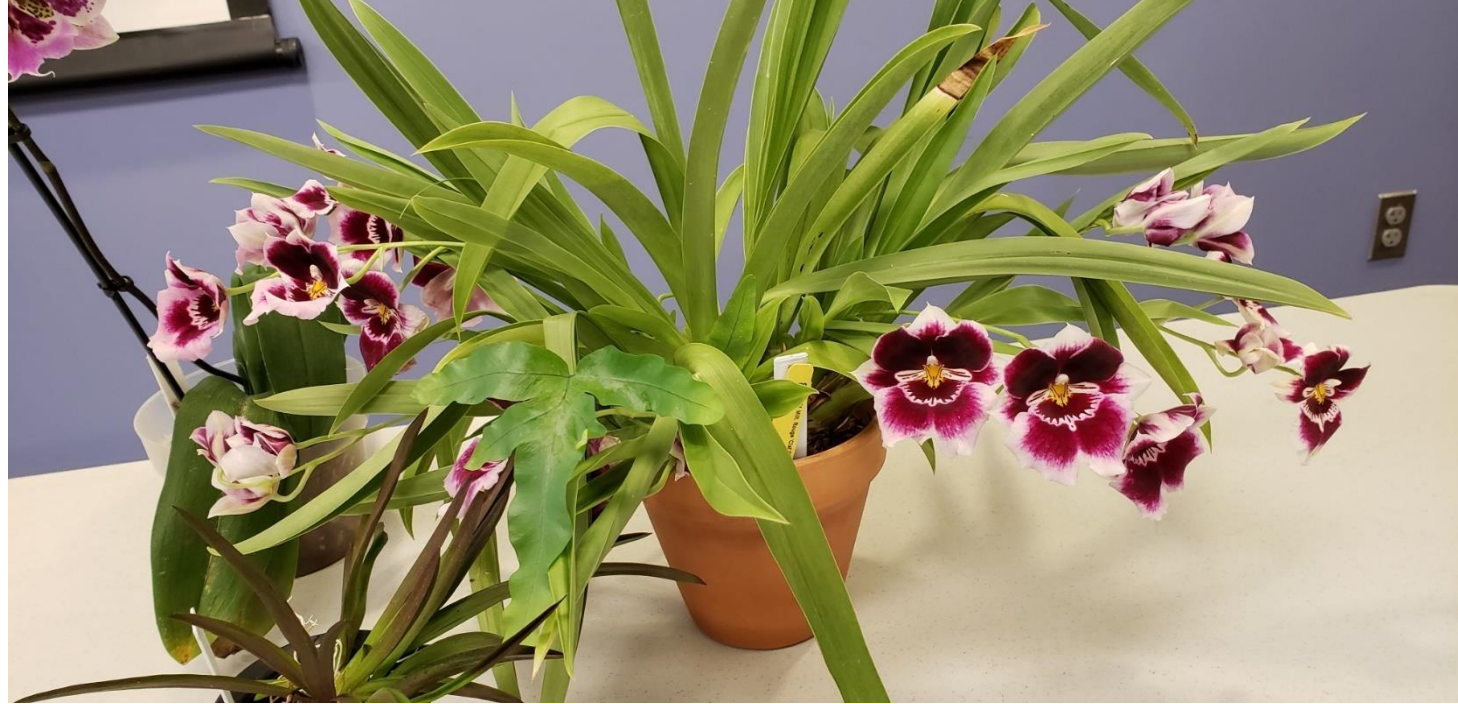
Mps. Rouge 'California Plum' HCC/AOS