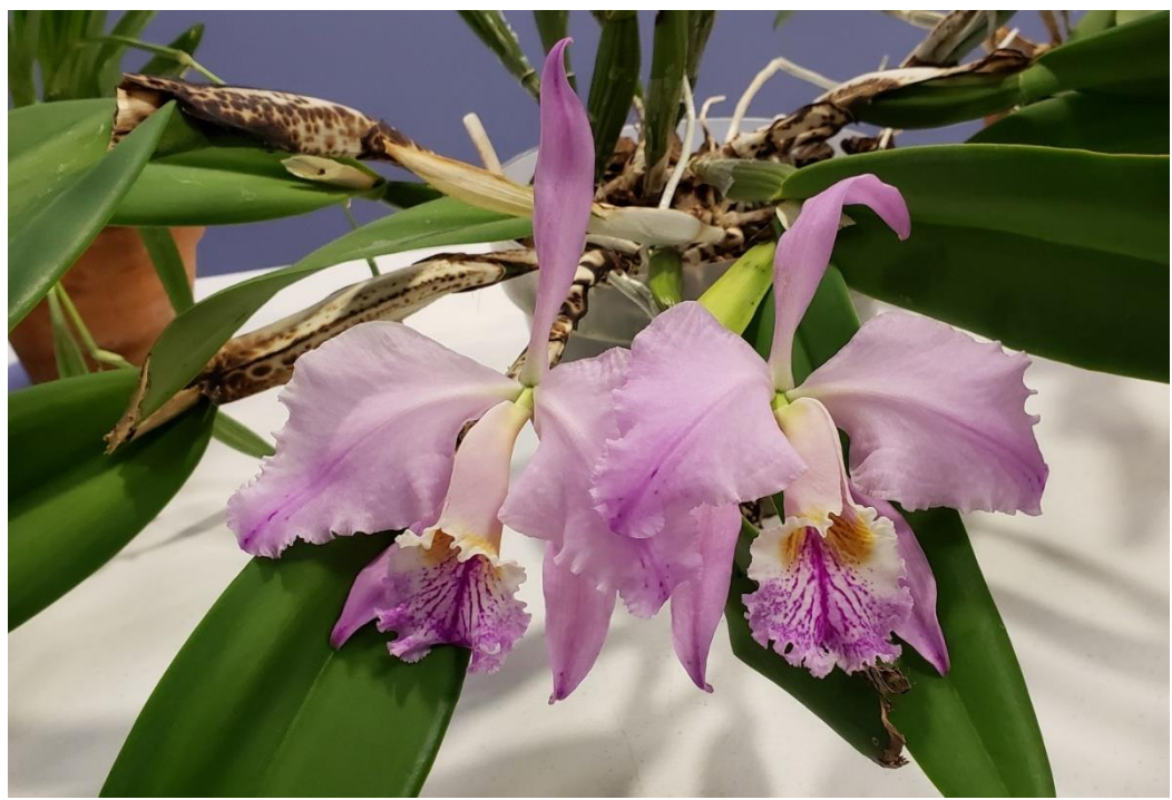
Cat. mossiae tipo