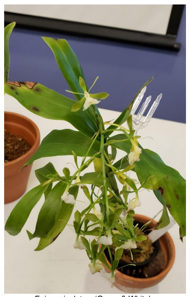
Epi. paniculatum 'Green & White'