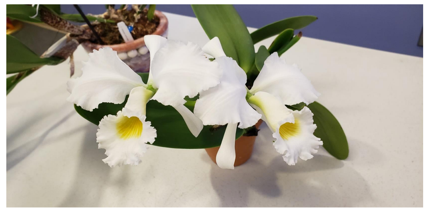
C. gaskelliana f. alba