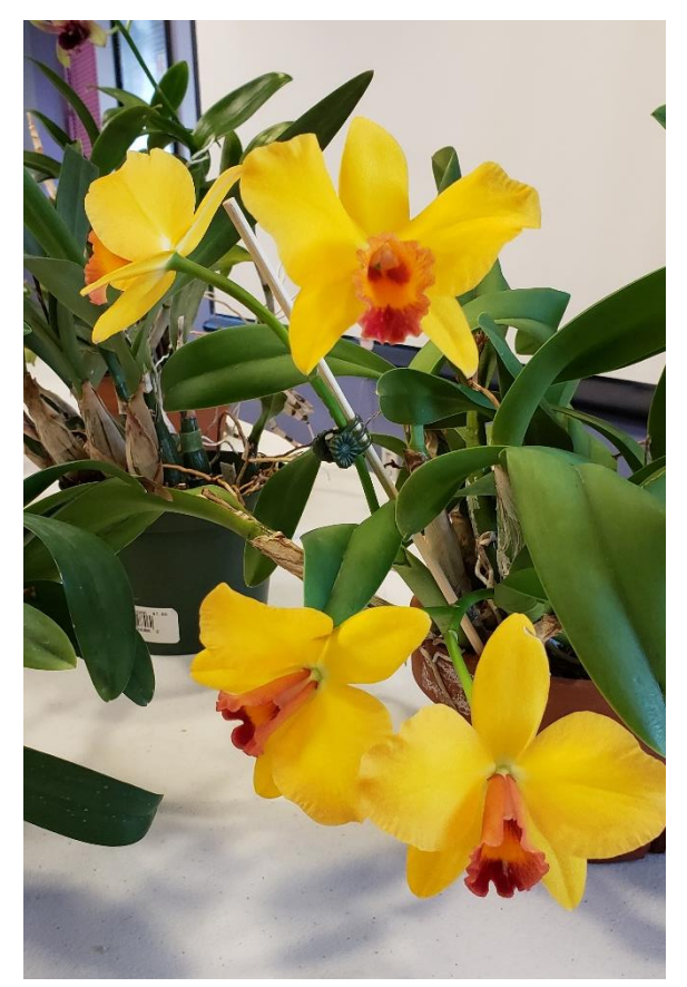
Rth. California Love