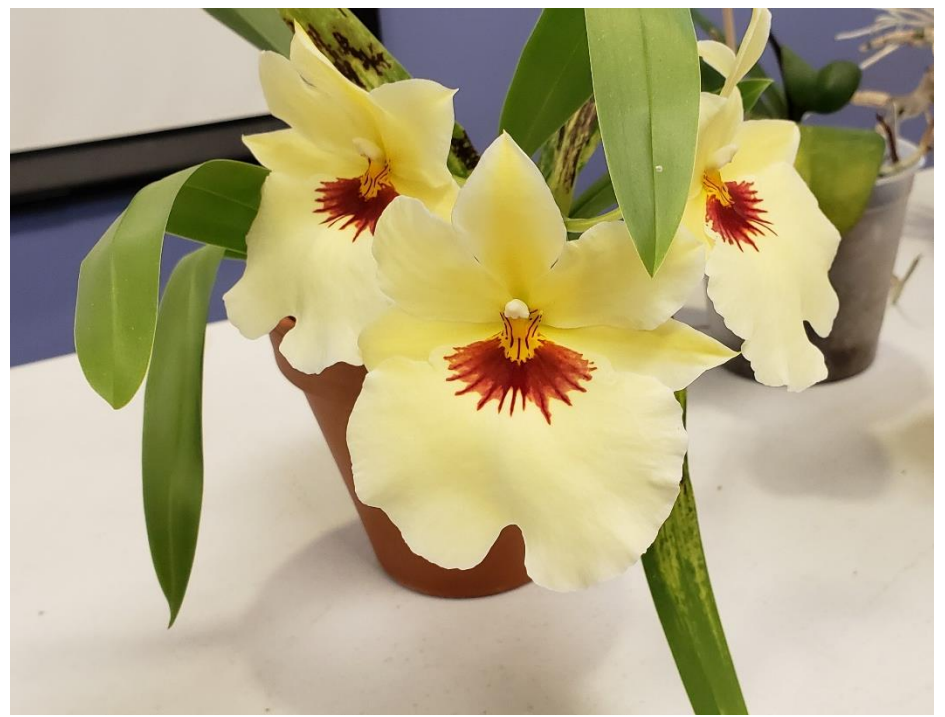
Mps. Kaila Quintal