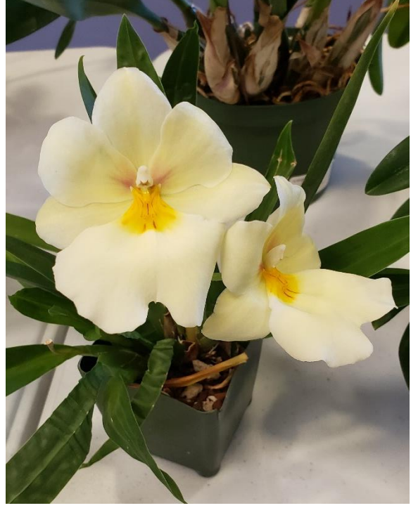
Mps, Komoda Marvel