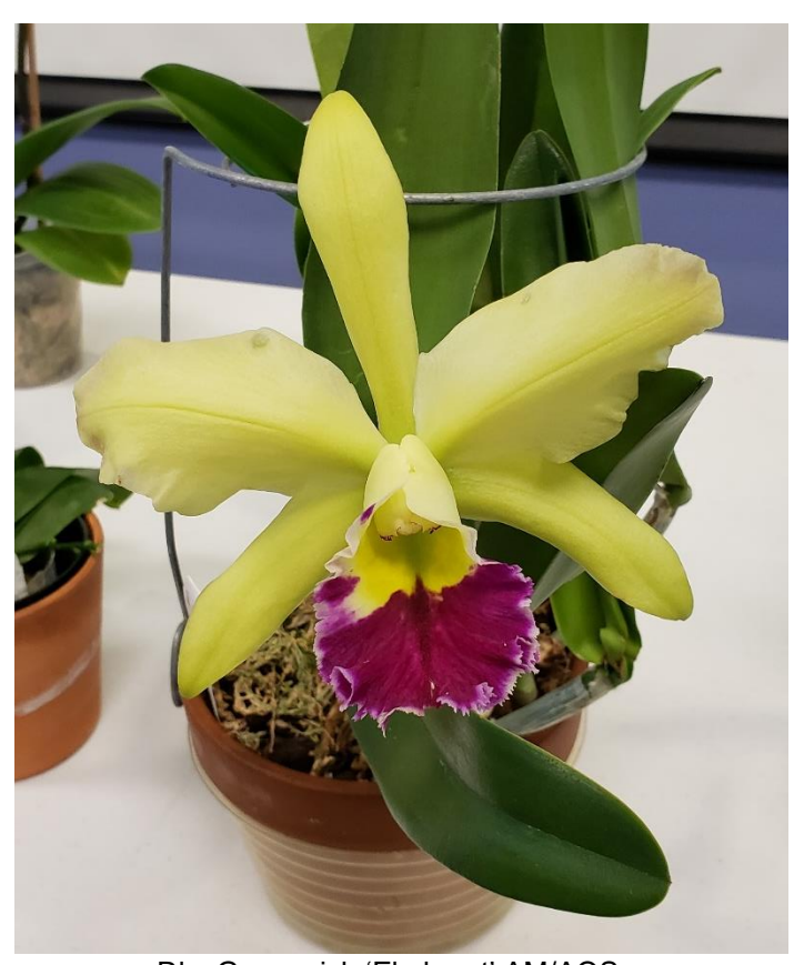
Rlc. Greenwich 'Elmhurst' AM/AOS