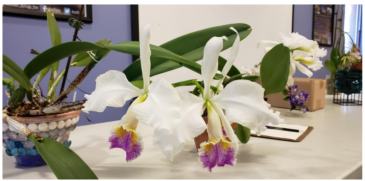
C. mossiae 'Okda'