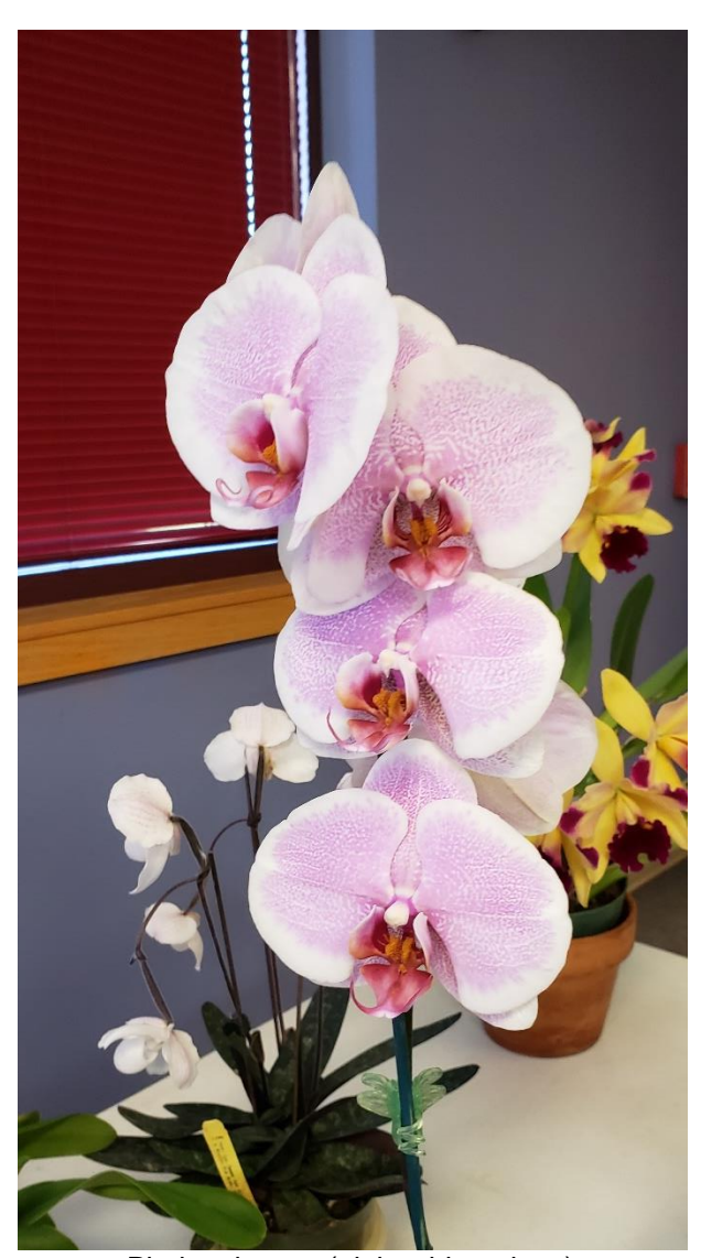
Phal. unknown (pink, white edges)