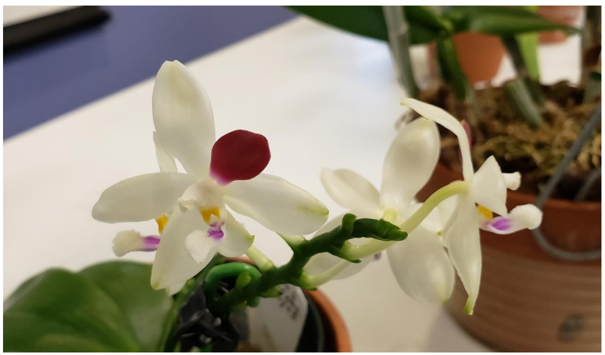
Phal. tetraspis 'C1' HCC/AOS