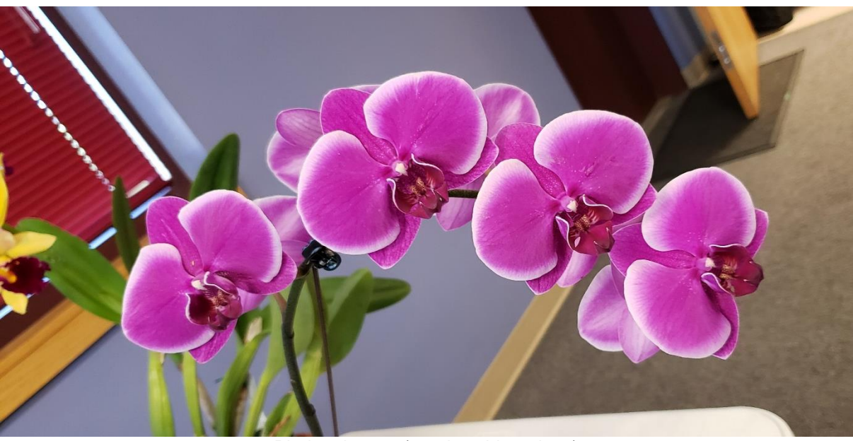
Phal. unknown (purple, white edges)