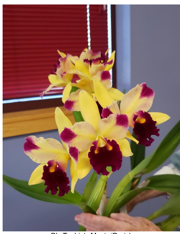
Rlc.Toshie's Magic 'Doris'