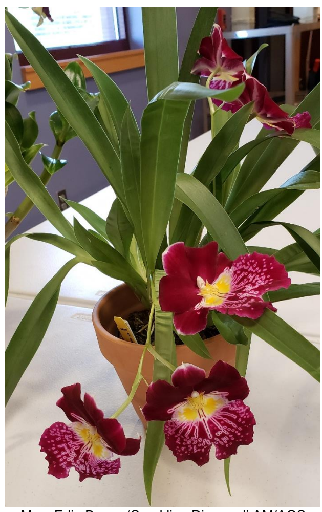
Mps. Edie Brown 'Sparkling Diamond' AM/AOS