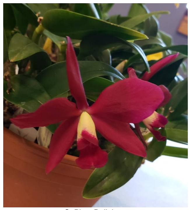
C. Plum Delight