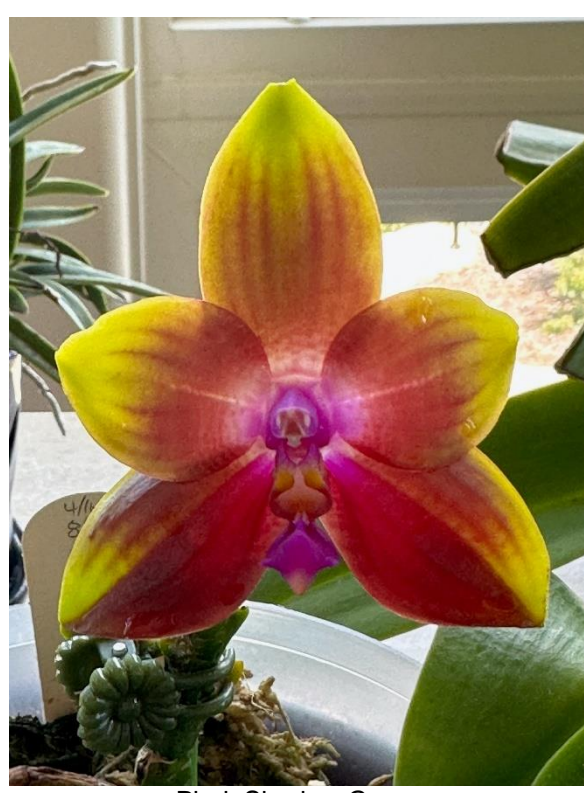
Phal. Shadow Goo