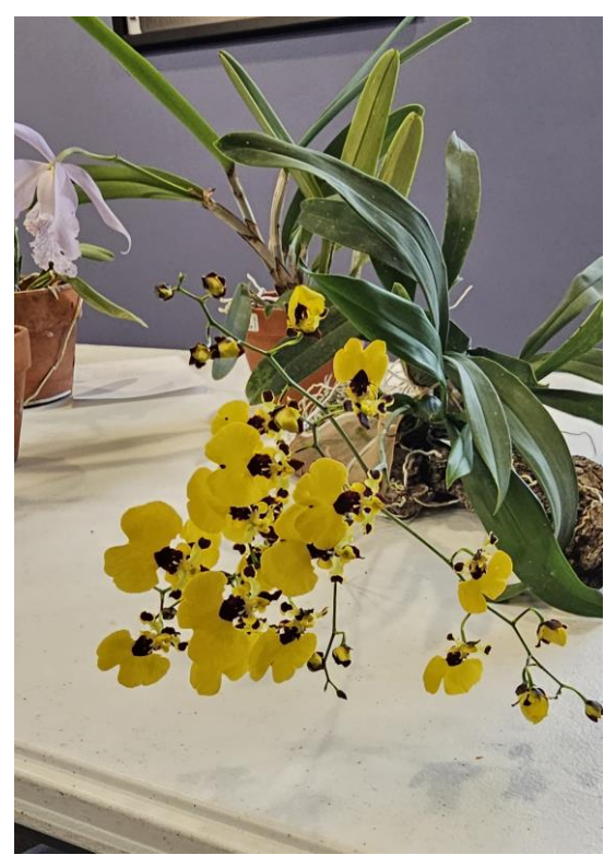
Gom. Alosuka 'Claire' AM/AOS