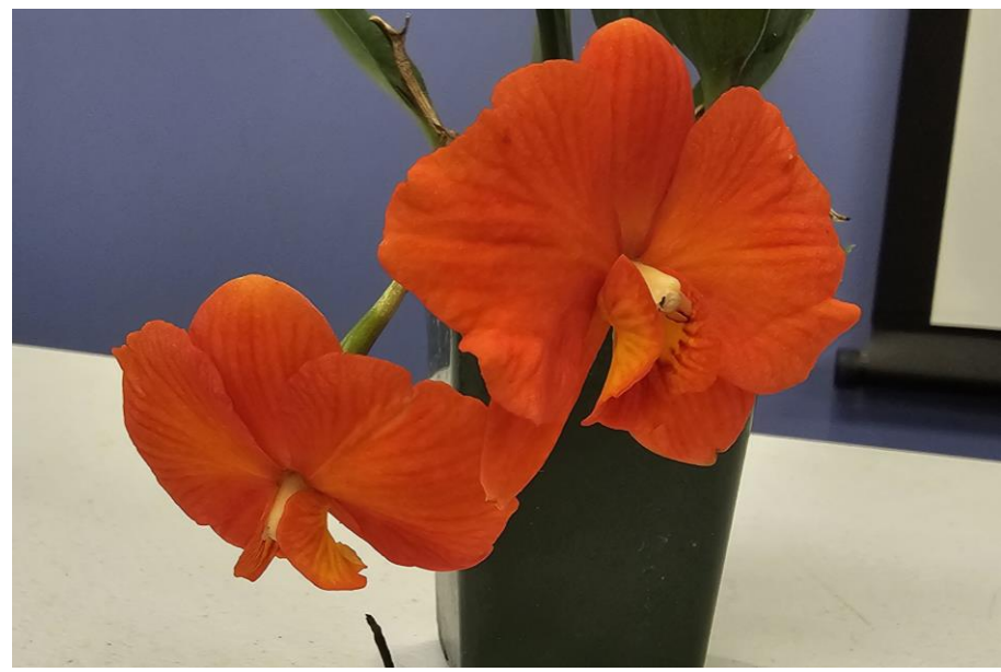
C. coccinea 4N