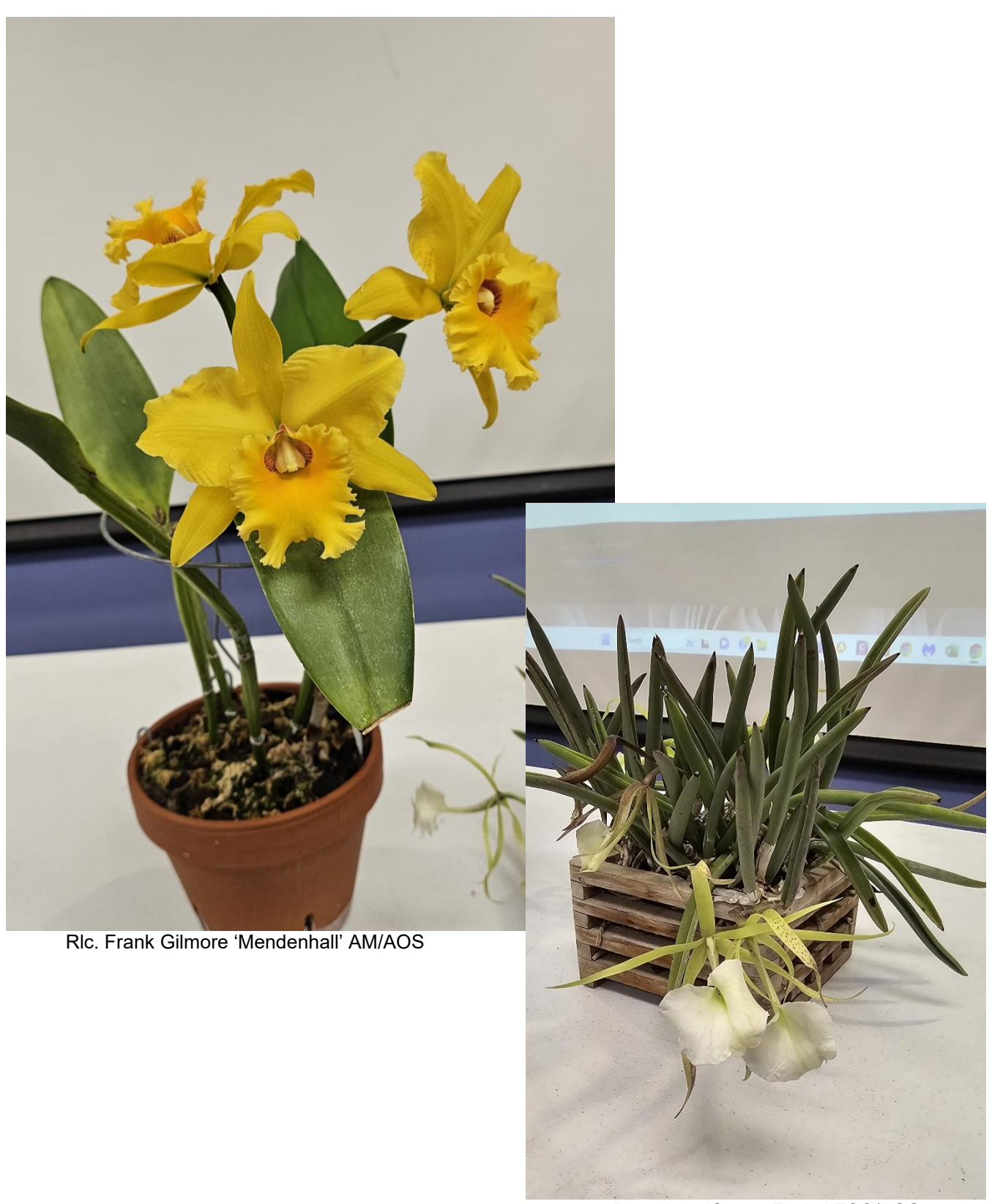
B. nodosa 'Susan Fuchs' FCC/AOS