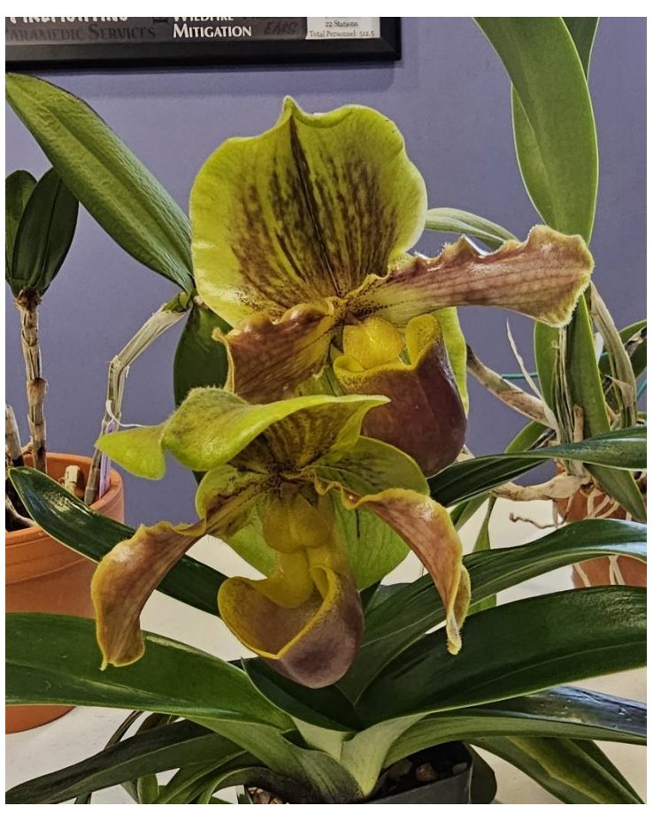
Paph. Hsinying Pinolime