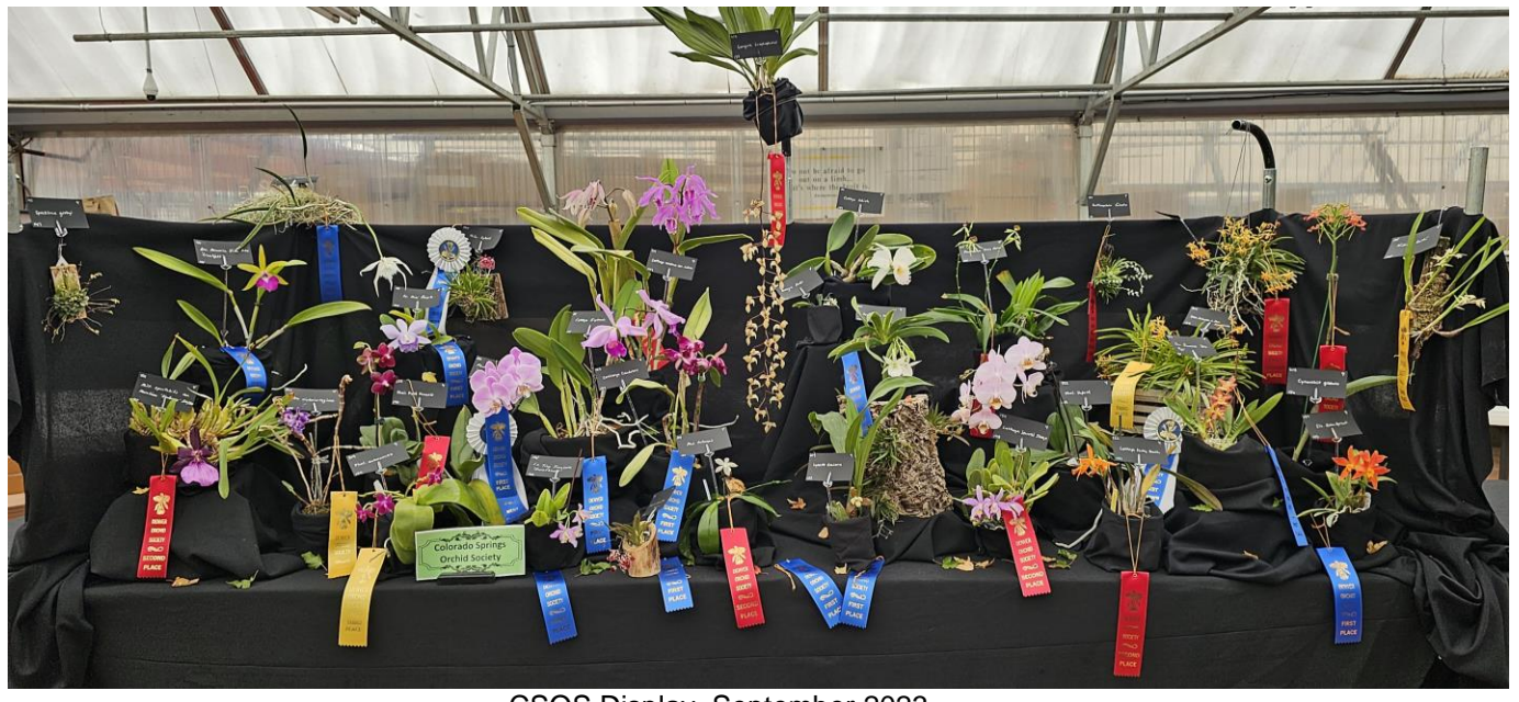
CSOS Display, September 2023

Display and Award Photos: A few pictures of some displays and awards from the DOS Show and Sale this past weekend: