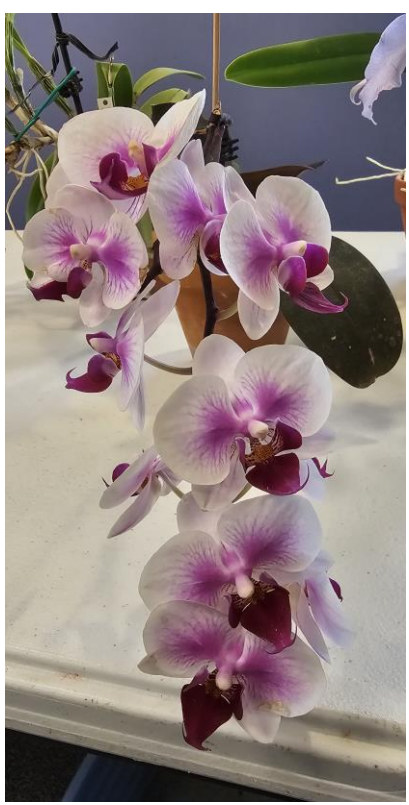
Phal. Hula Girl 'Aloha'