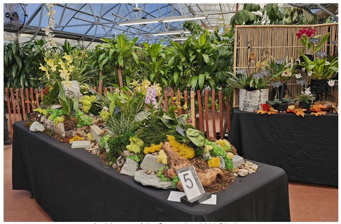
And 2 more of the September 2023 Displays