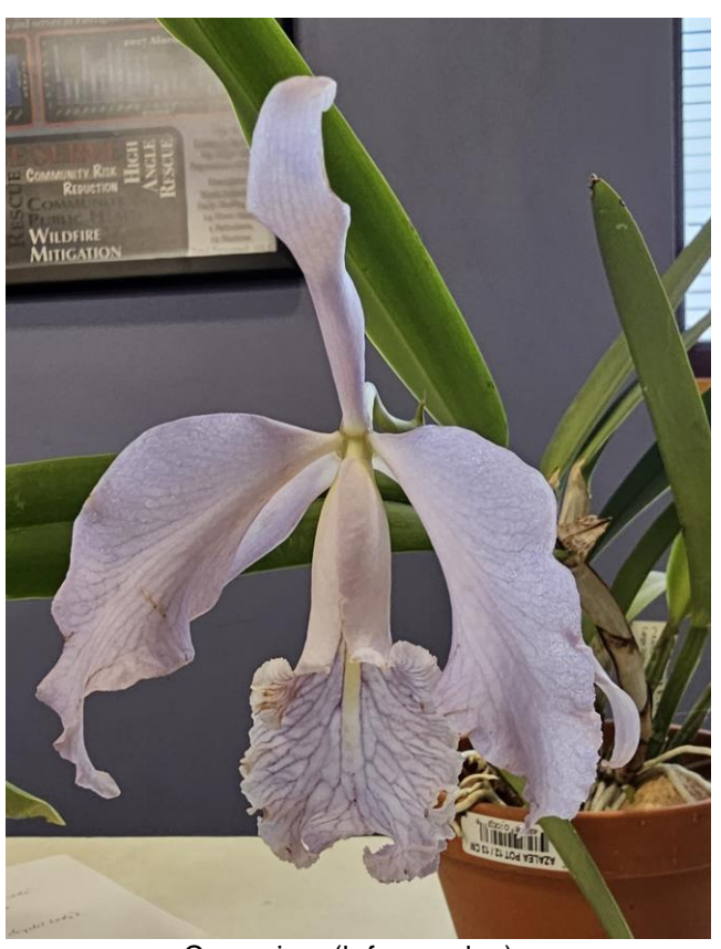
C. maxima (h.f. coerulea)