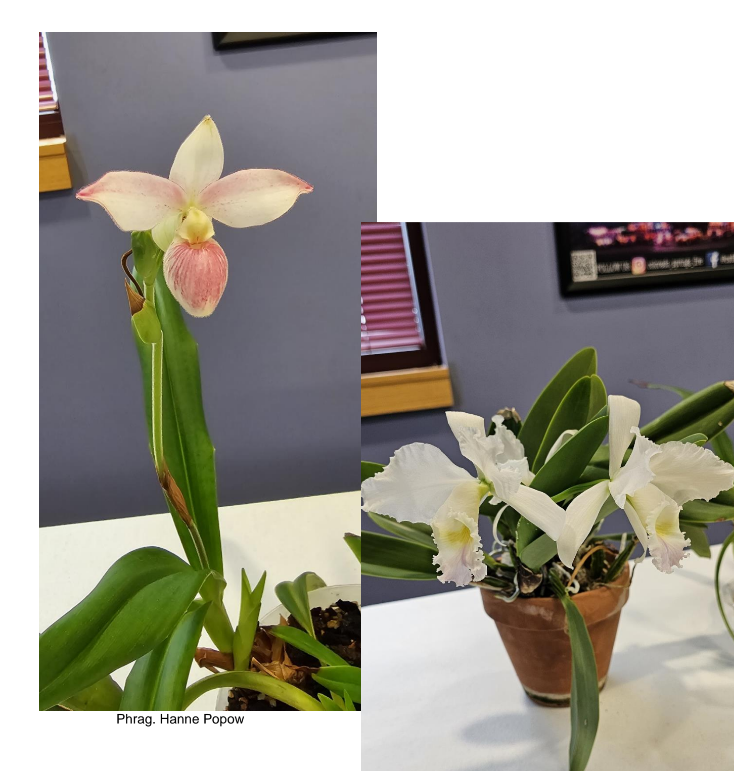
C. labiata (var. amoena)