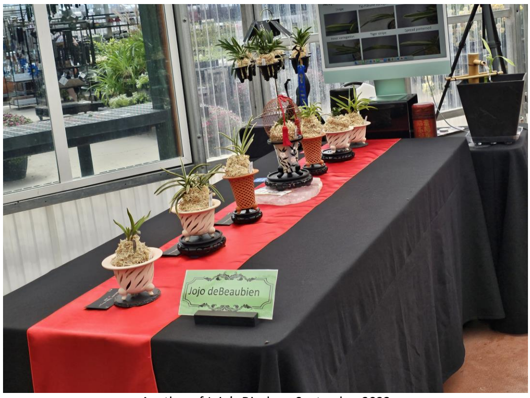
Another of Jojo's Displays, September 2023