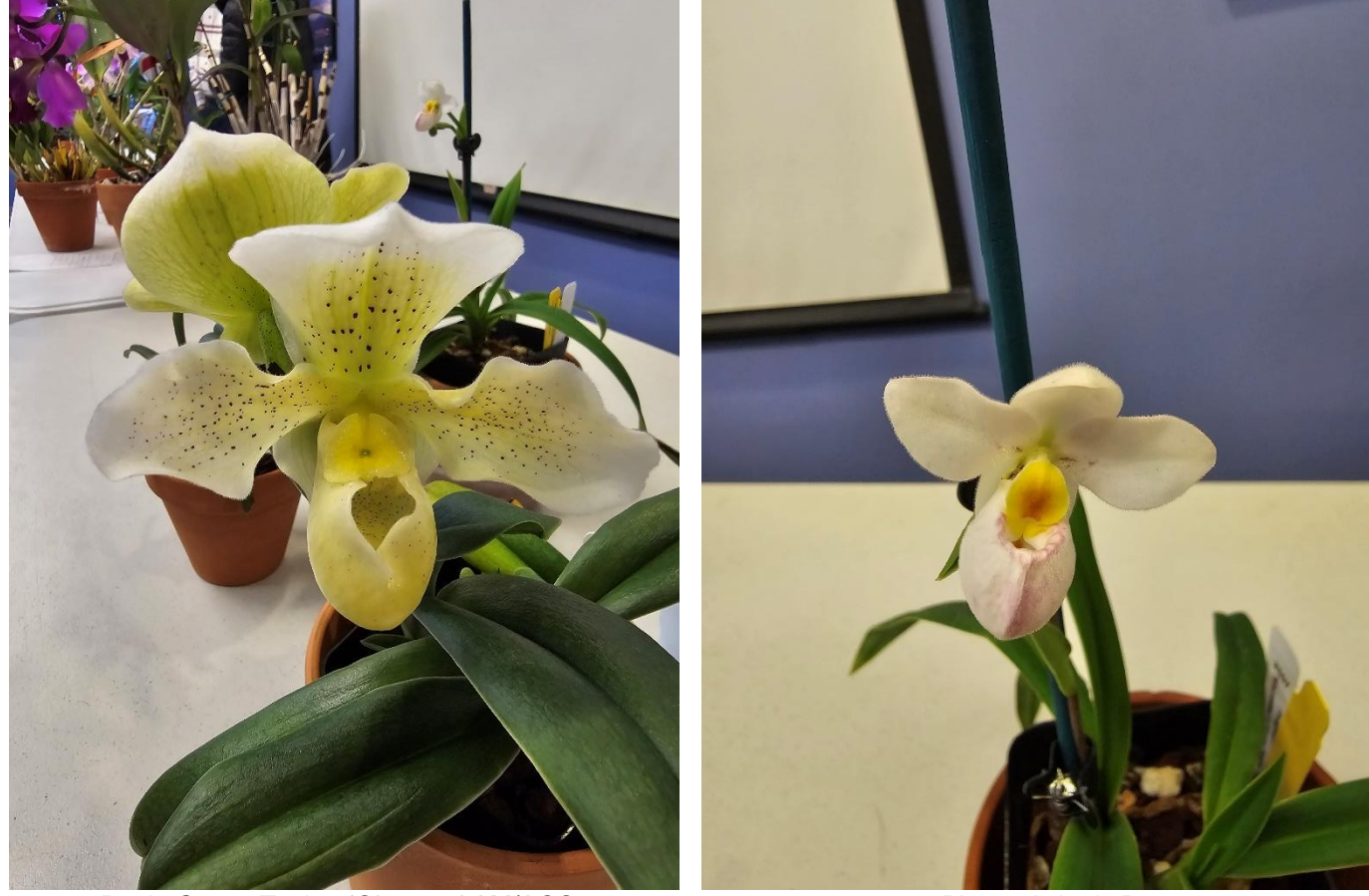
Paph. Susan Tucker 'Olympus' AM/AOS