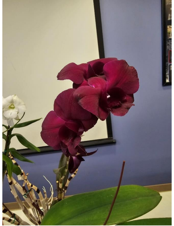
Den. Madame Vipa x Burana Emerald