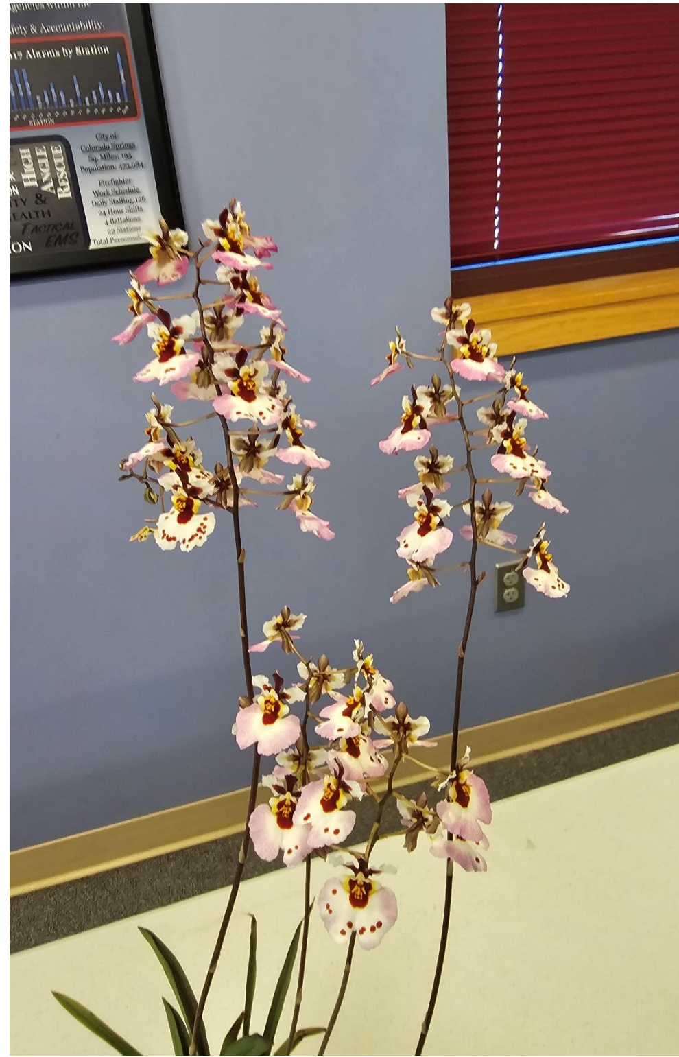
Tolu. Genting Pink Lady