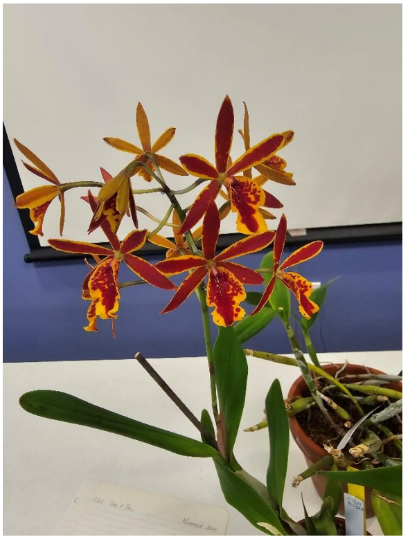
Ett. Volcano Trick 'Volcano Queen'