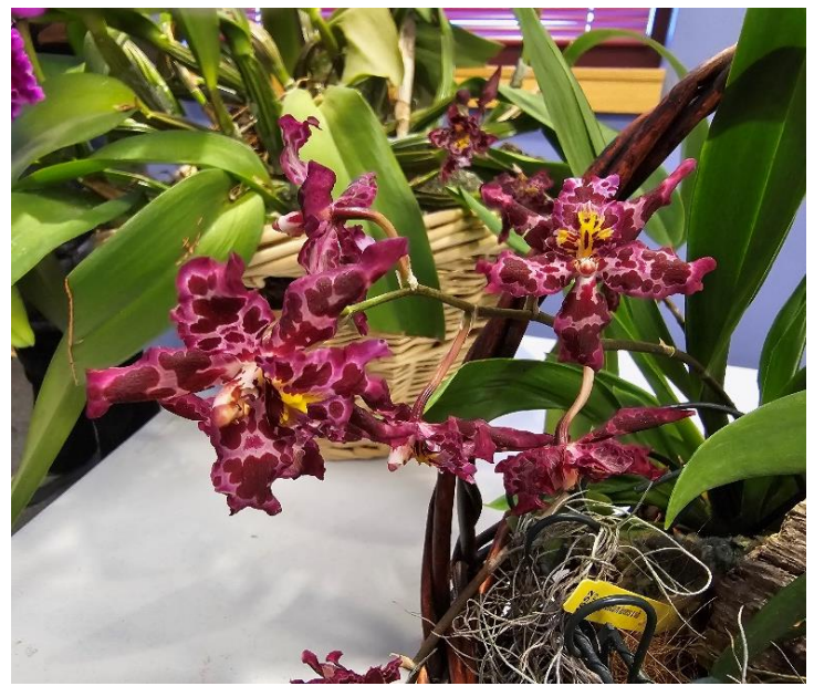
Onc. hybrid (No ID)