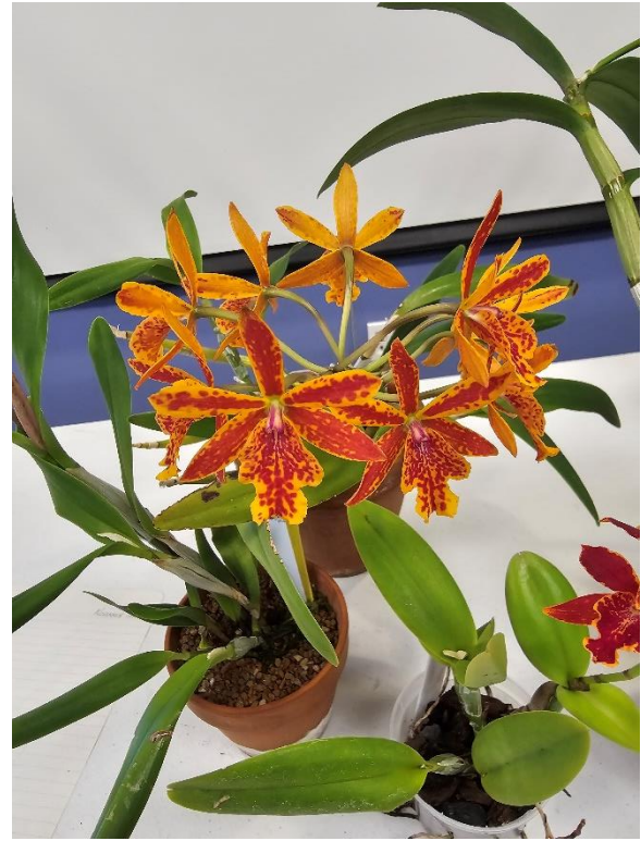
Ett. Volcano Trick 'Volcano Fireball