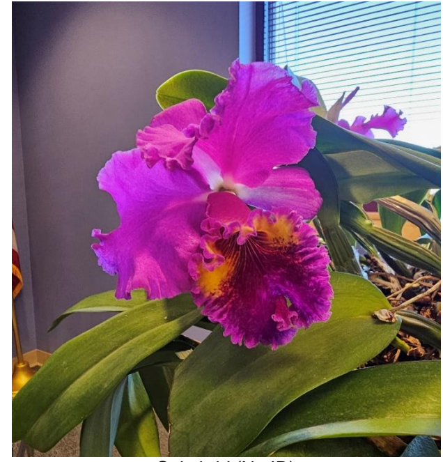
C. hybrid (No ID)