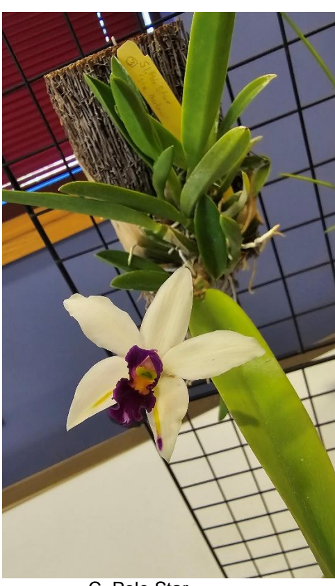
C. Pole Star