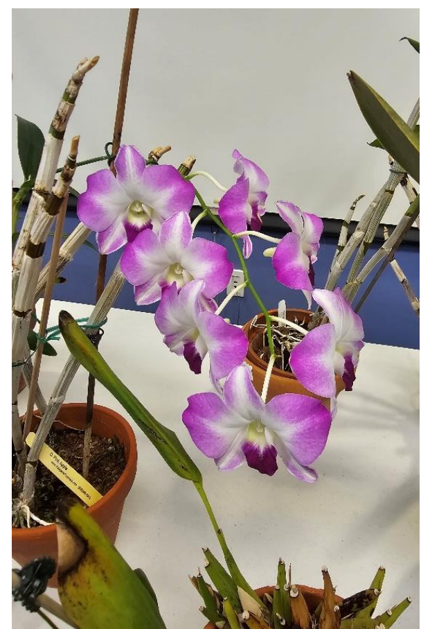
Den. Pink Apple (?)