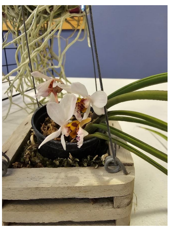
Holc. wangii x self