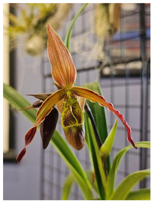
Phrag. Vampire Slayer