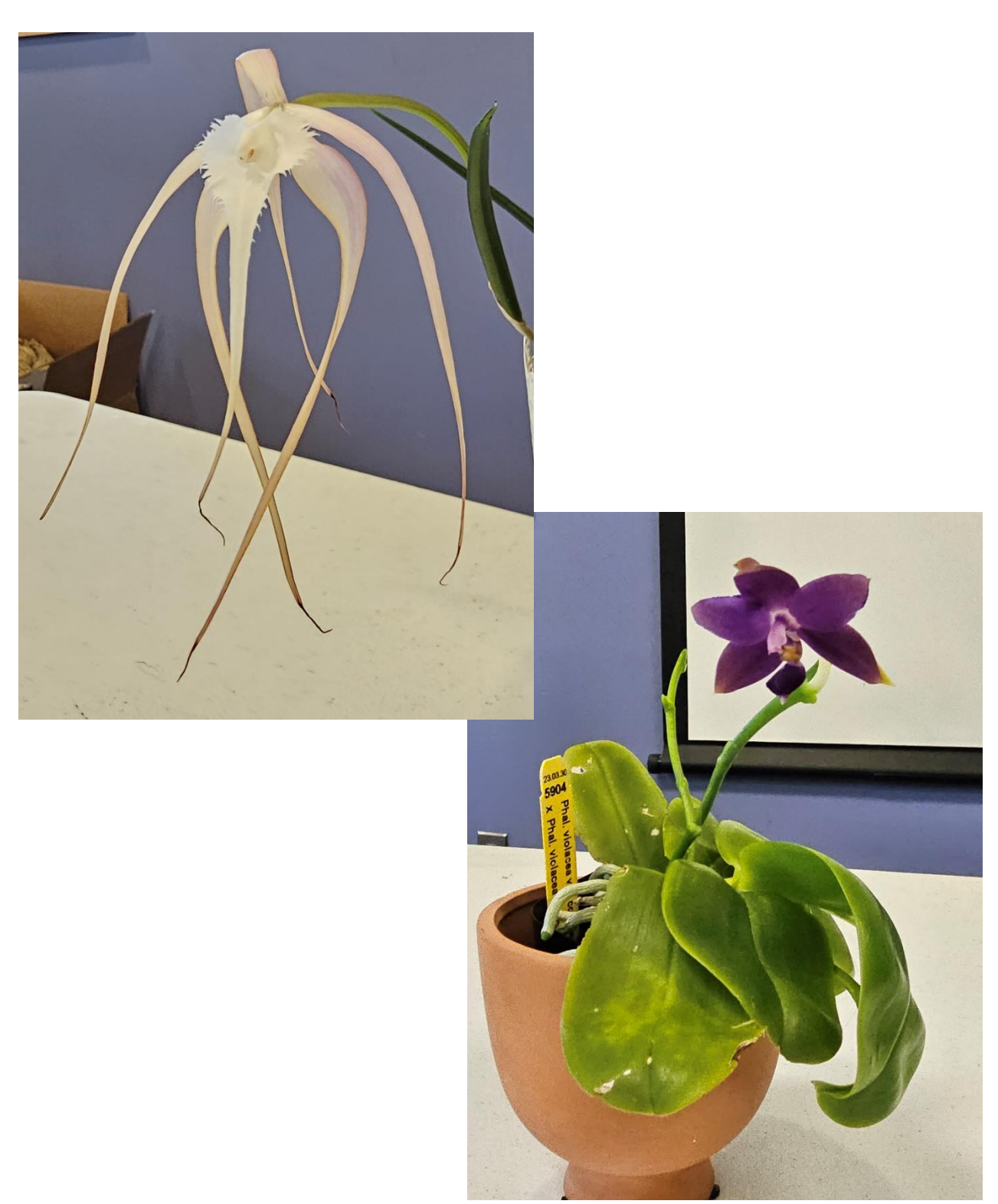
B. cucullate and Phal. violacea (f. coerulea) 'Double'