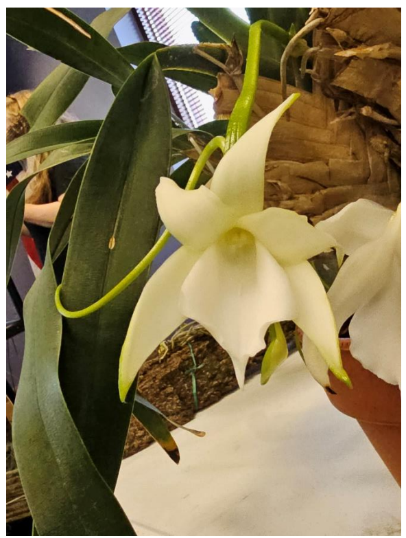
Angcm. Leonis (x sib)