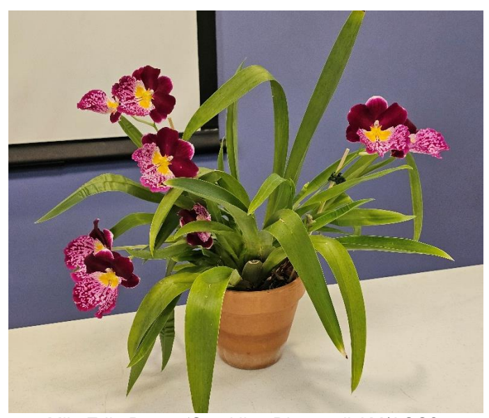
Milt. Edie Brown 'Sparkling Diamond' AM/AOS?