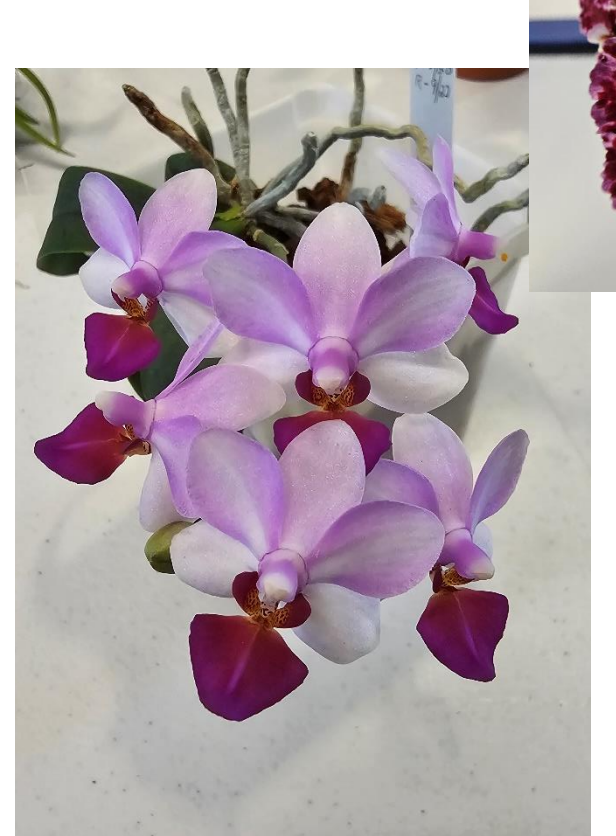
Phal. Hybrid Tolu. Hybrid