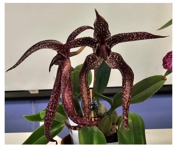
Bulb. Meen Garuda 'InSitu'