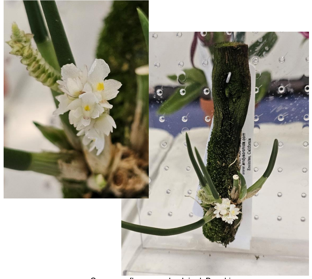
Cap. superflua grown by Jojo deBeaubien