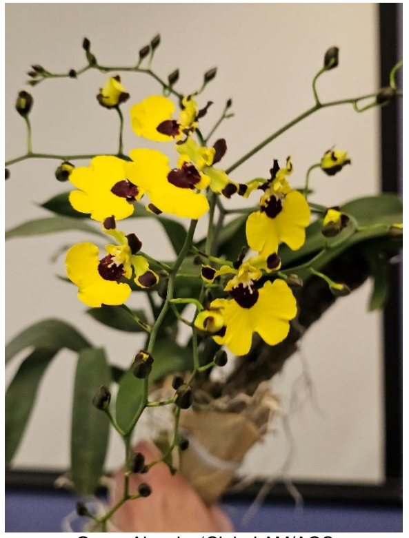
Gom. Alosuka 'Claire' AM/AOS