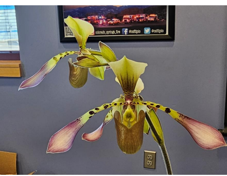
Paph. lowii? grown by Patsy Gaglione