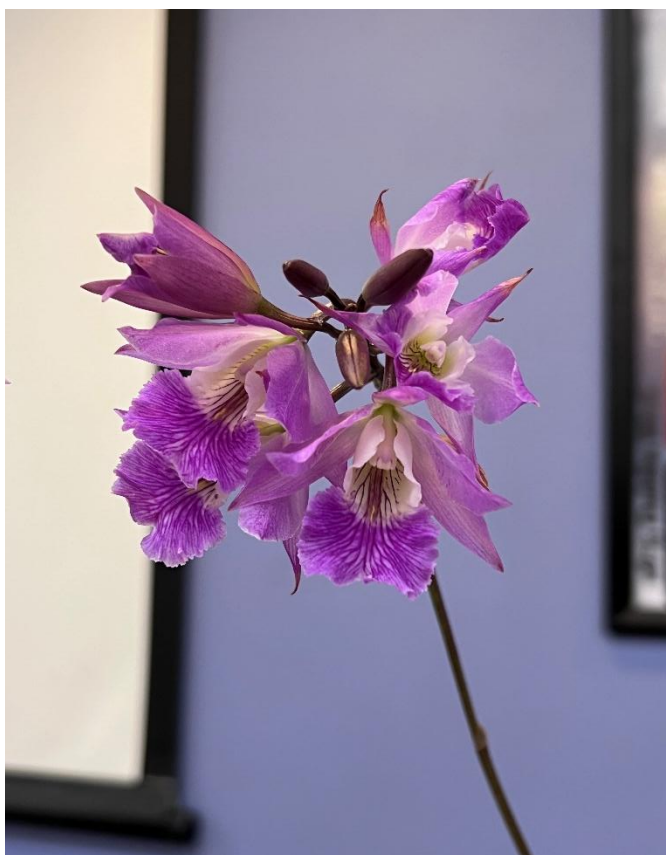
Lna. Dave's Dapper Dandee