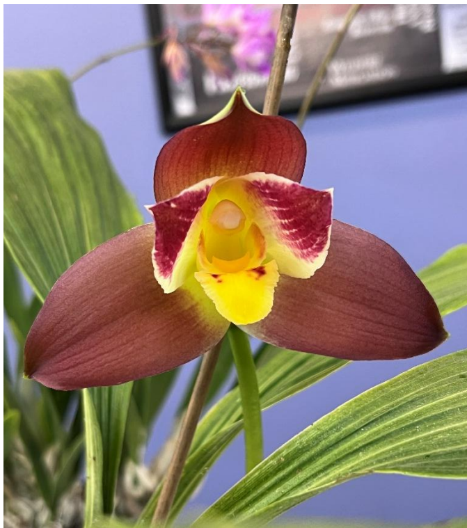
Lys. Red Jewel