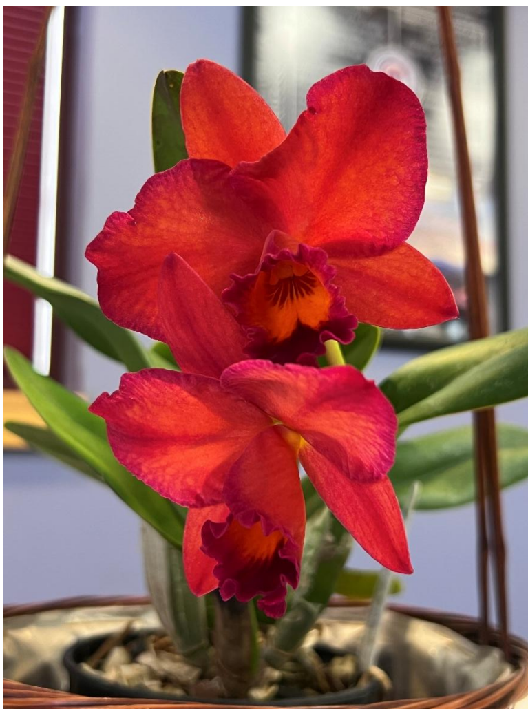
Rth.Telling Lies 'SVO Best' x Georgia Peach 'SVO Flared Apricot'