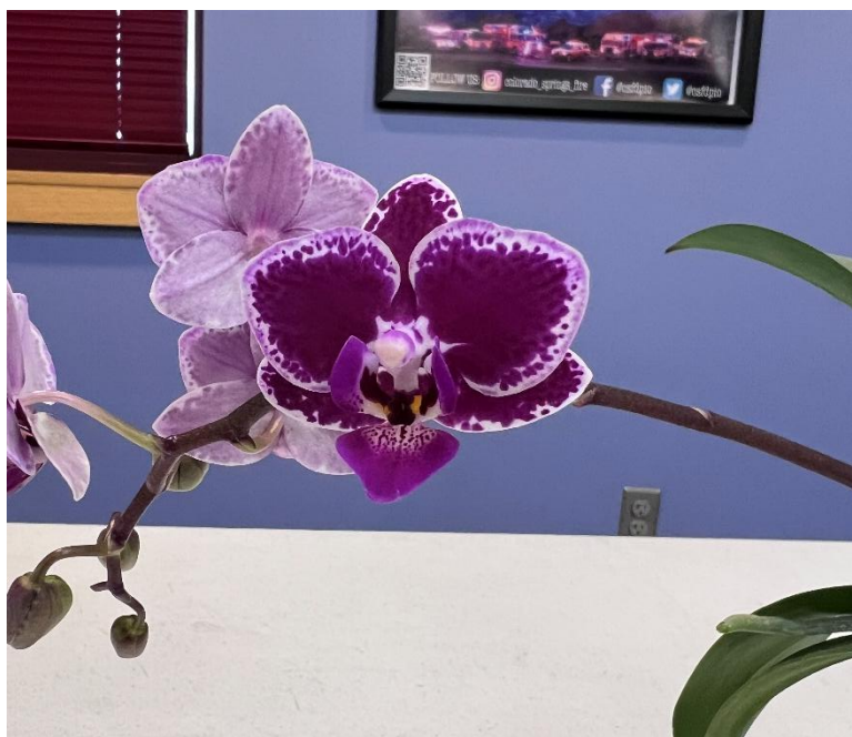
Phal. hybrid grown by Kaoru Stabnow