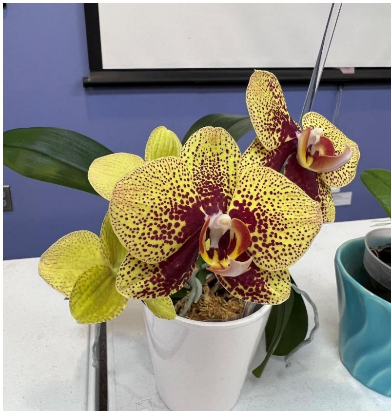
Phal. KV Charmer