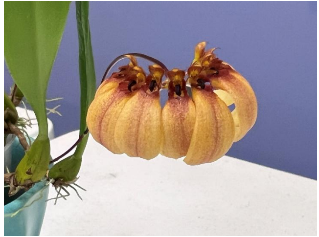
Bulb. Sunshine Queen 'Orange'