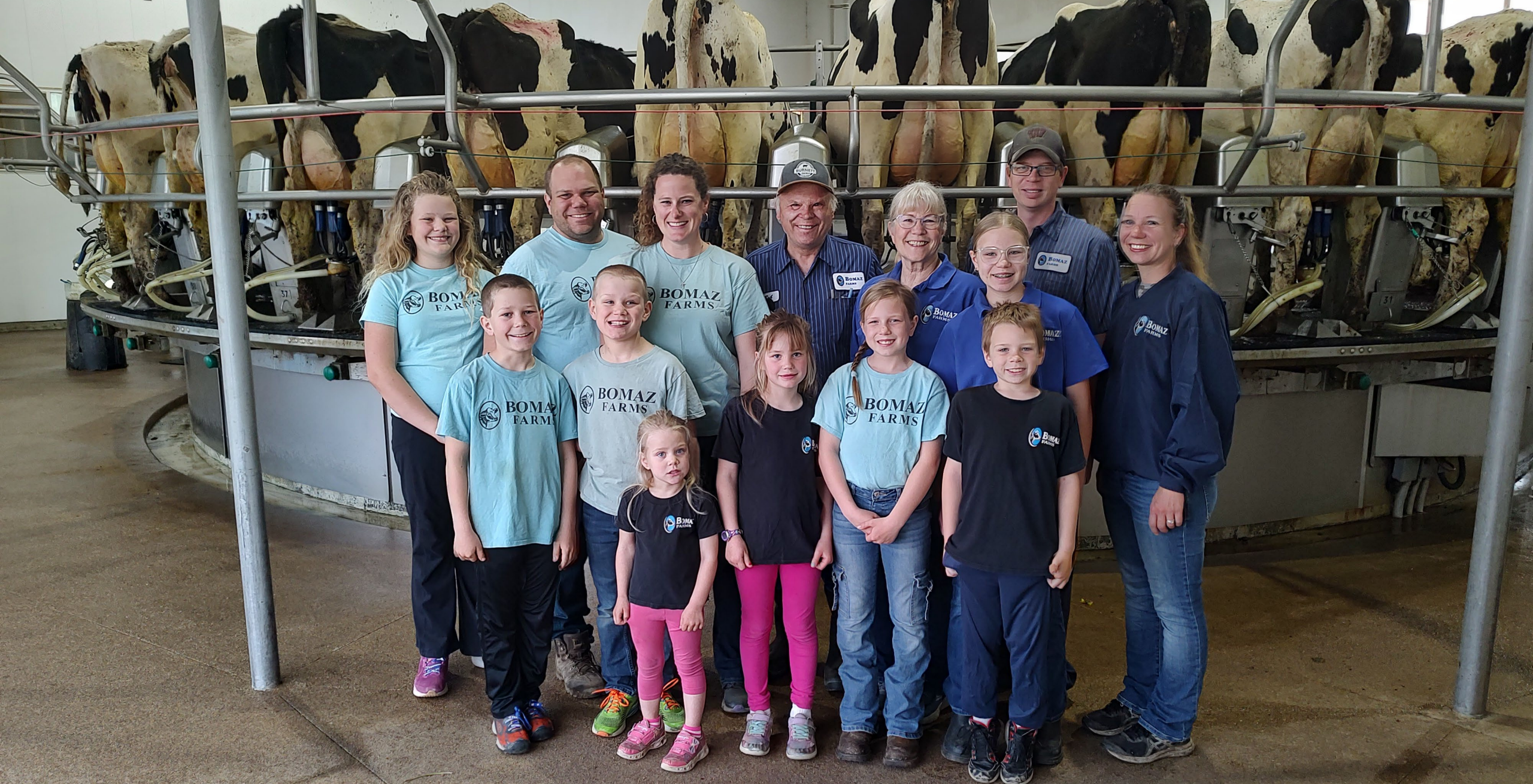
BOMAZ FARMS-Breeding Blue Collar Ladies