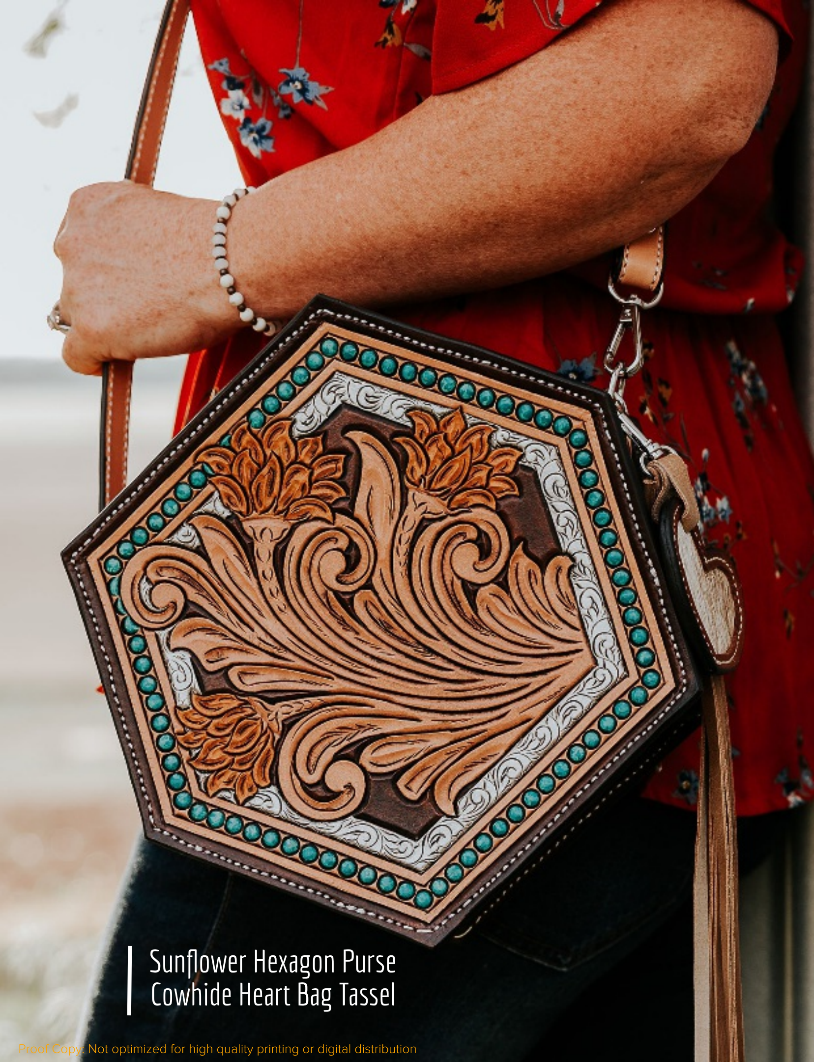
| Sunflower Hexagon Purse Cowhide Heart Bag Tassel