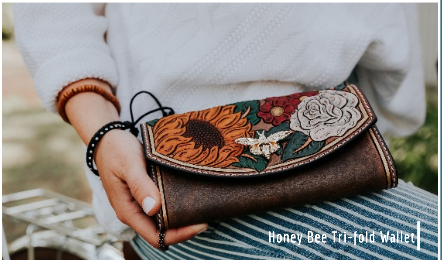
Honey Bee Tri-fold Wallet