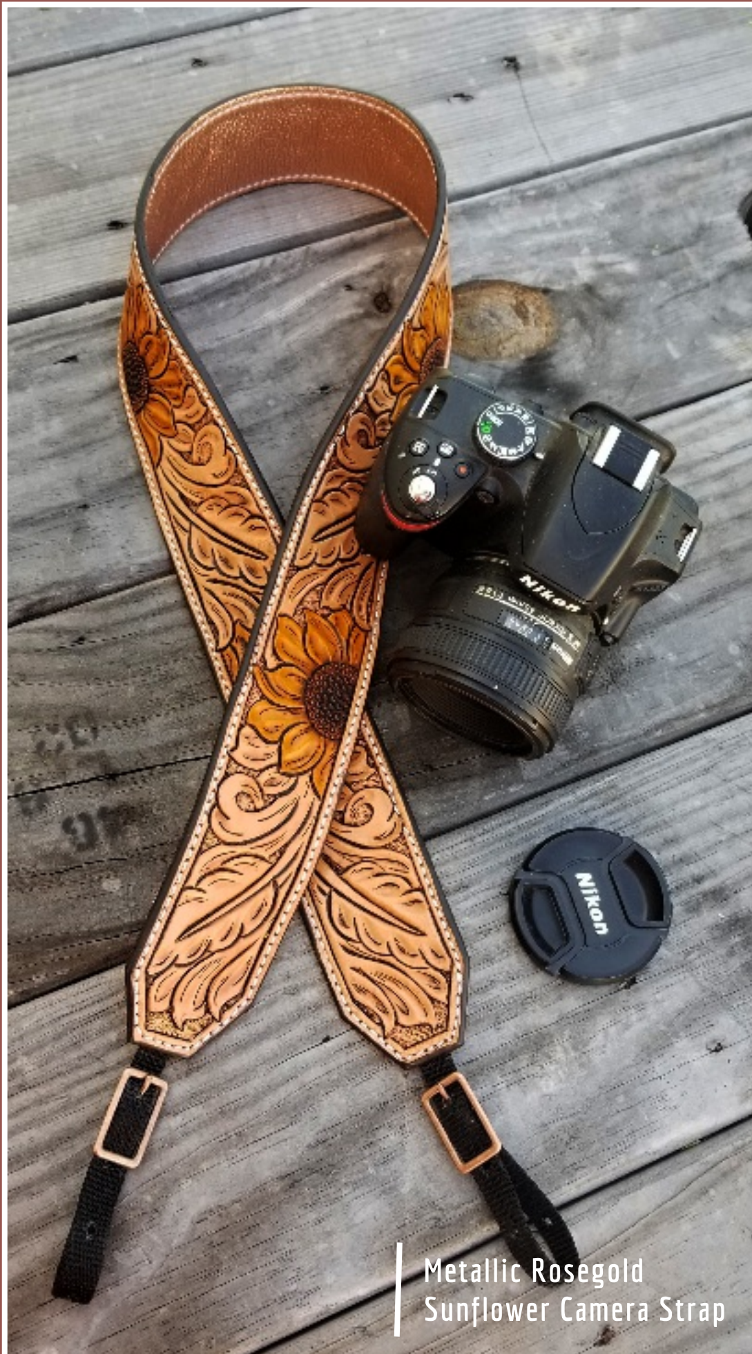
Metallic Rosegold Sunflower Camera Strap