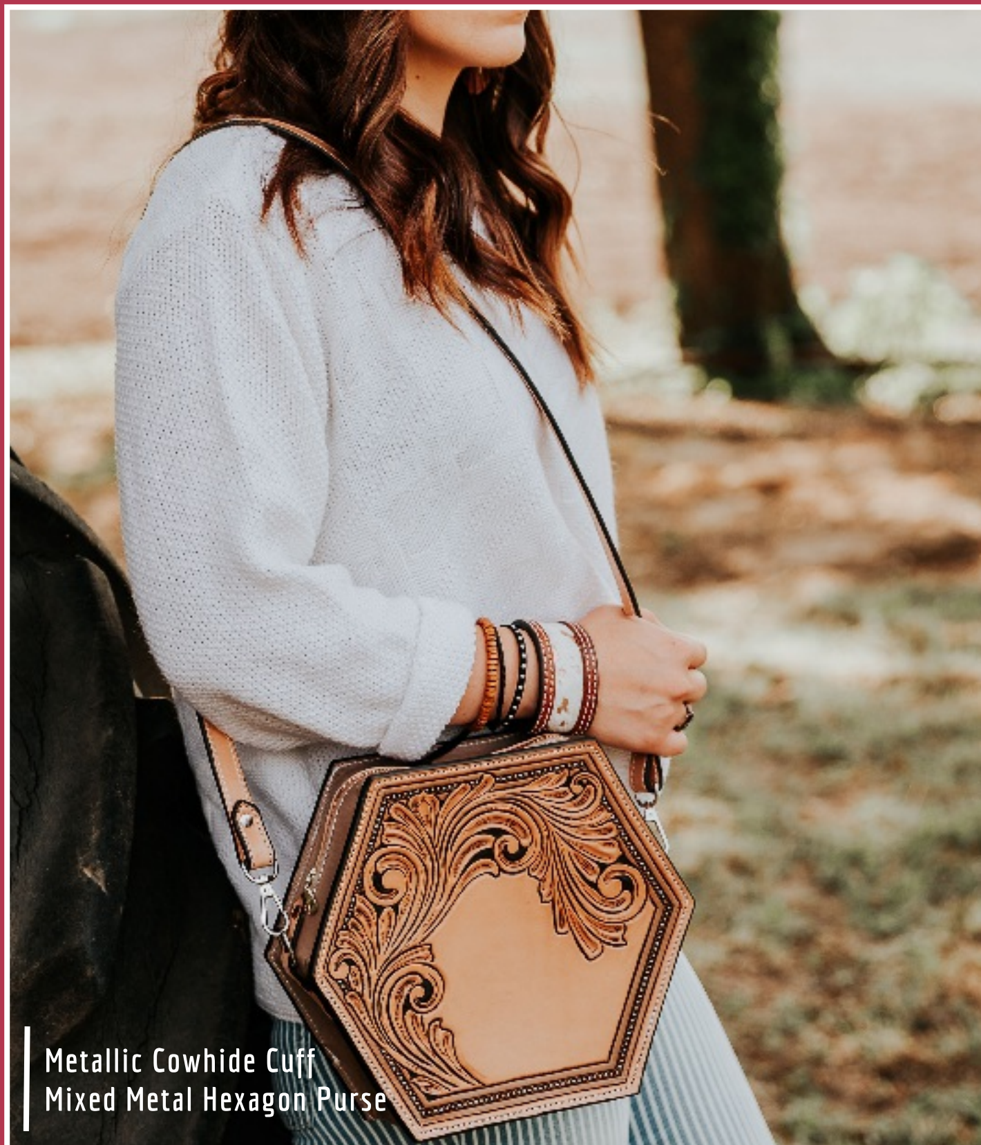
Metallic Cowhide Cuff Mixed Metal Hexagon Purse