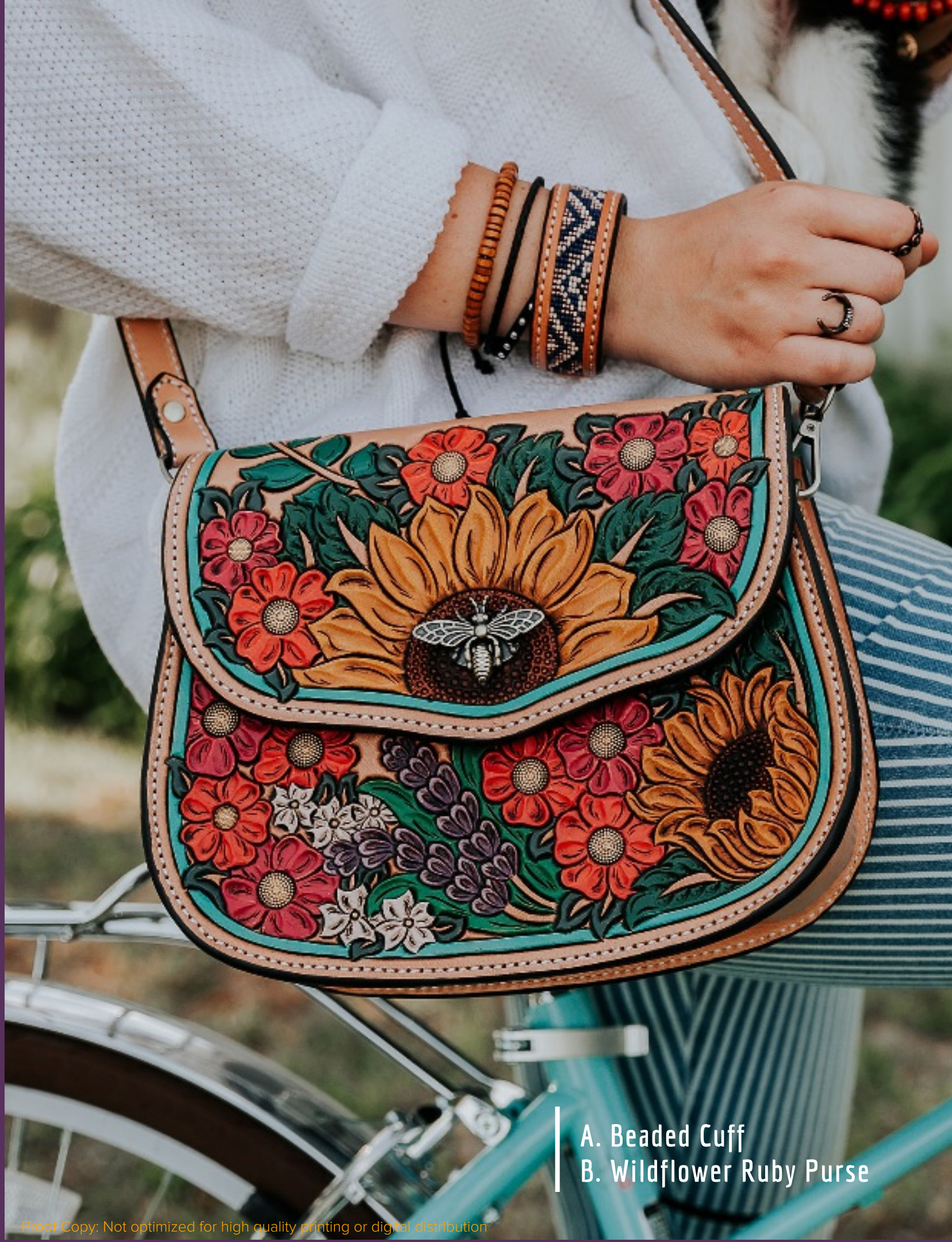
A. Beaded Cuff B. Wildflower Ruby Purse