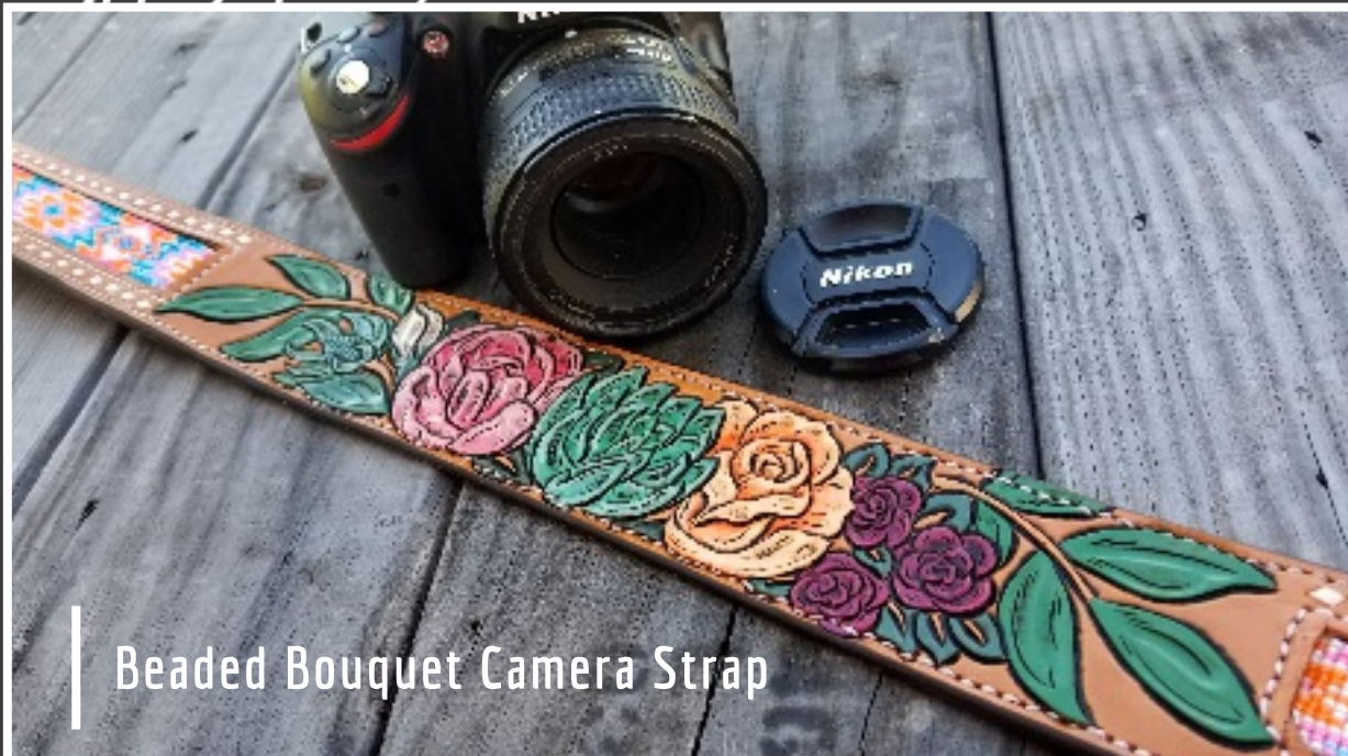
Beaded Bouquet Camera Strap