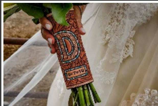
Jamie D. - Bouquet Wrap Fort Collins, CO