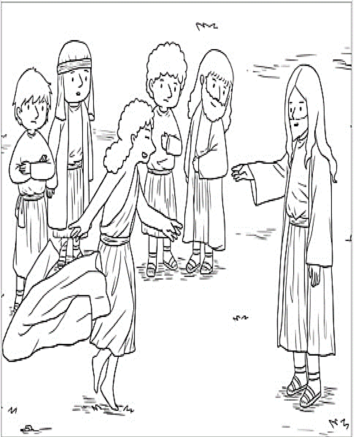
Blind Bartimaeus receives his sight!