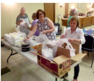
On May 15 we served almost 250 meals!

Thank you to everyone that helped by donating ingredients for the meal, helping move food over to 1125 Mahoning, prepping, cooking, serving, and helping to clean up!