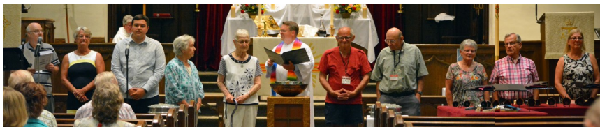
We welcomed 14 new members!