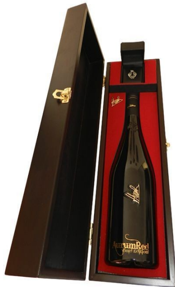
AurumRed Gold Series