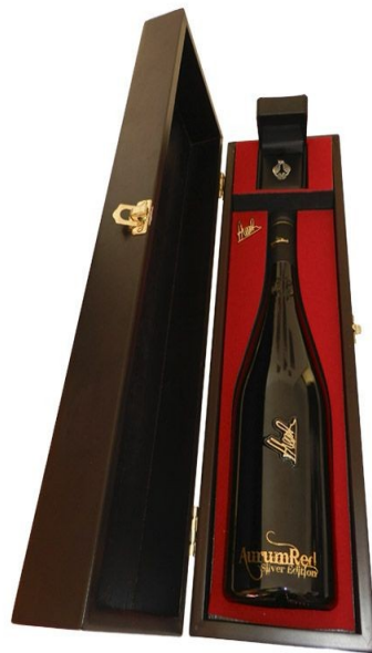
AurumRed Silver Series