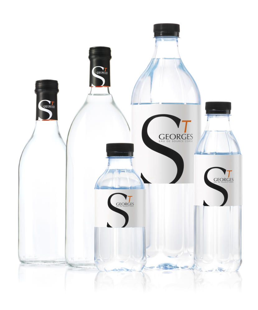
St. Georges Pure Corsican Spring Water