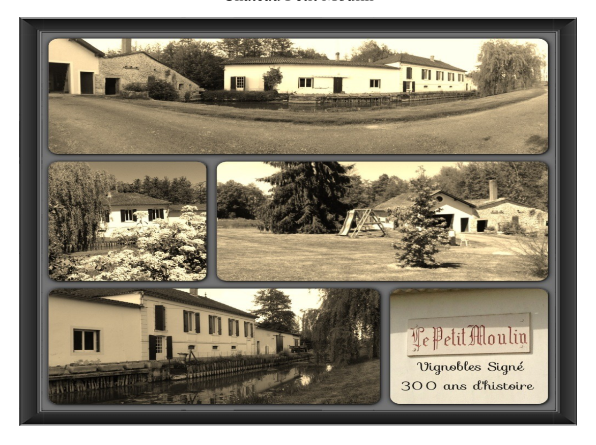
Vignobles Signé - Château Petit Moulin

Vignobles Signé, Bordeaux, FRANCE Château Petit Moulin