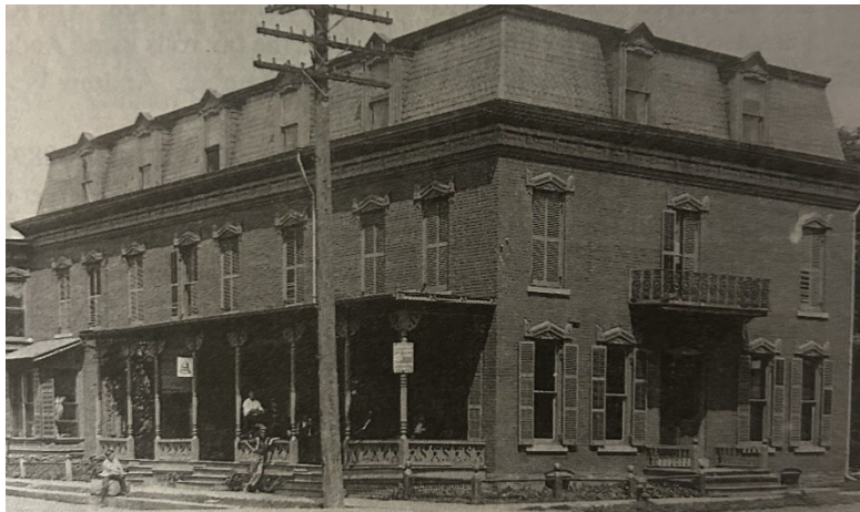
The Avoca Hotel, the first customer for the 1889 Avoca Water Project

In those days, railroad conductors and personnel often filled jugs at the Avoca stop as it was known to be the best fresh water on the railroad run. Most homes in the beginning only had on central faucet, but it wasn't long before bathrooms began to be installed in houses at the turn of the century.