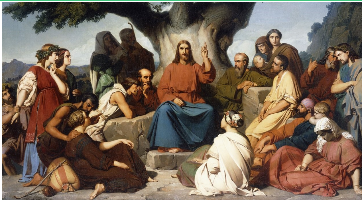
Sermon of Jesus Christ on the Mount—Edouard Louis Dubufe, 1844

February 1, 2026 Fourth Sunday in Ordinary Time