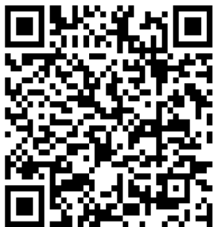
One time donation