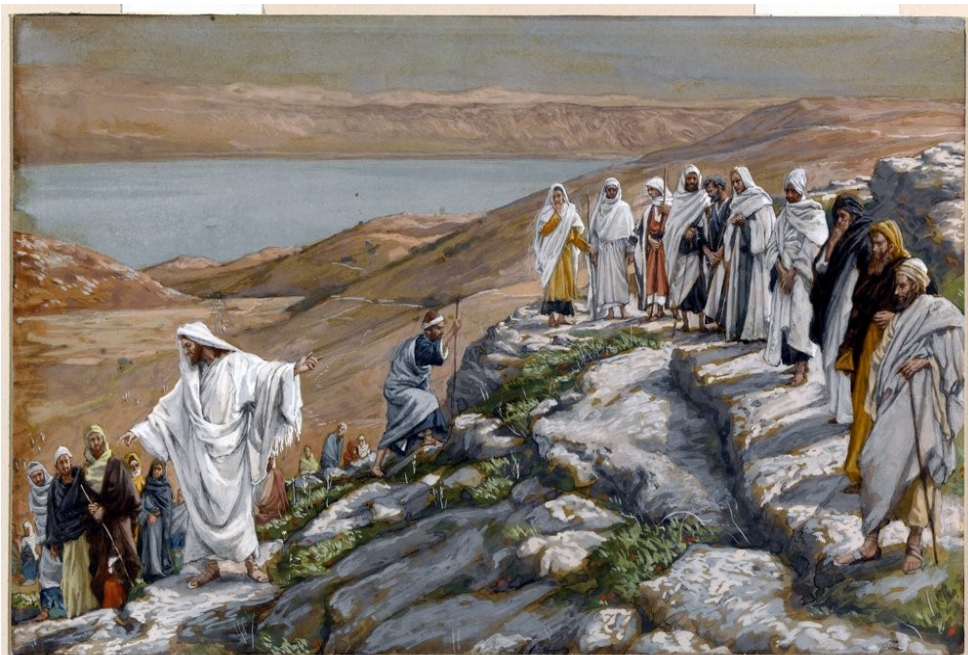
Mission of the Seventy-Two by James Tissot

97 Shady Lane, PO Box 1061, Ross, CA 94957