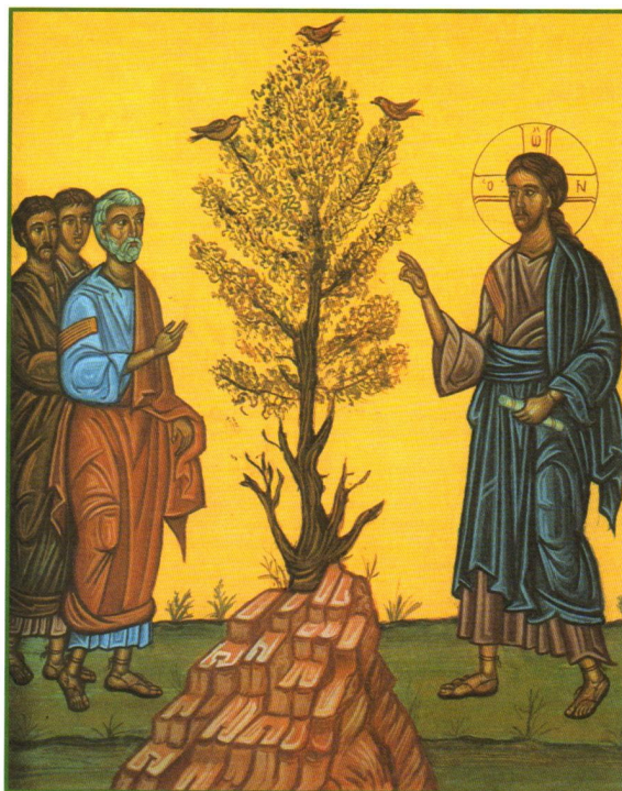
The Parable of the Mustard Seed—Traditional Icon

97 Shady Lane, PO Box 1061, Ross, CA 94957