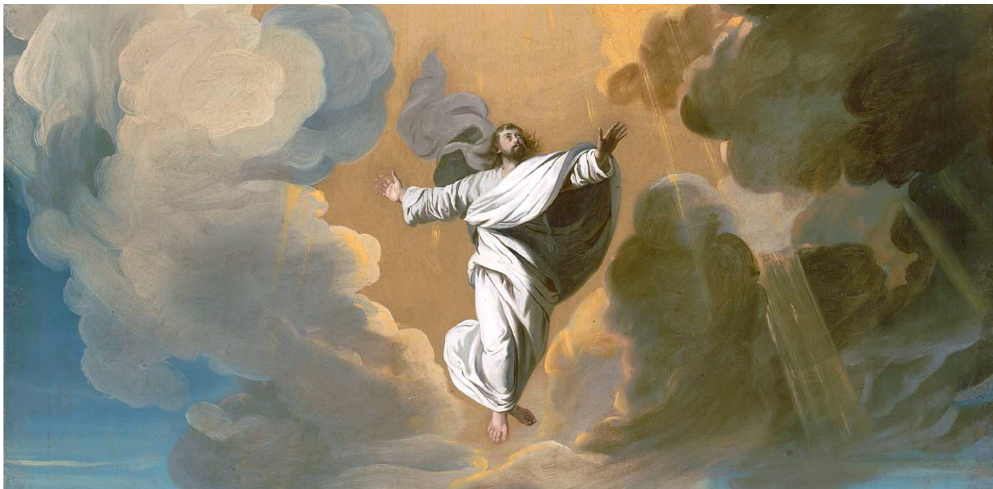
Jesus' Ascension to Heaven—John Singleton Copley, 1775

97 Shady Lane, PO Box 1061, Ross, CA 94957