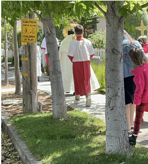
2024 Corpus Christi Eucharistic Procession