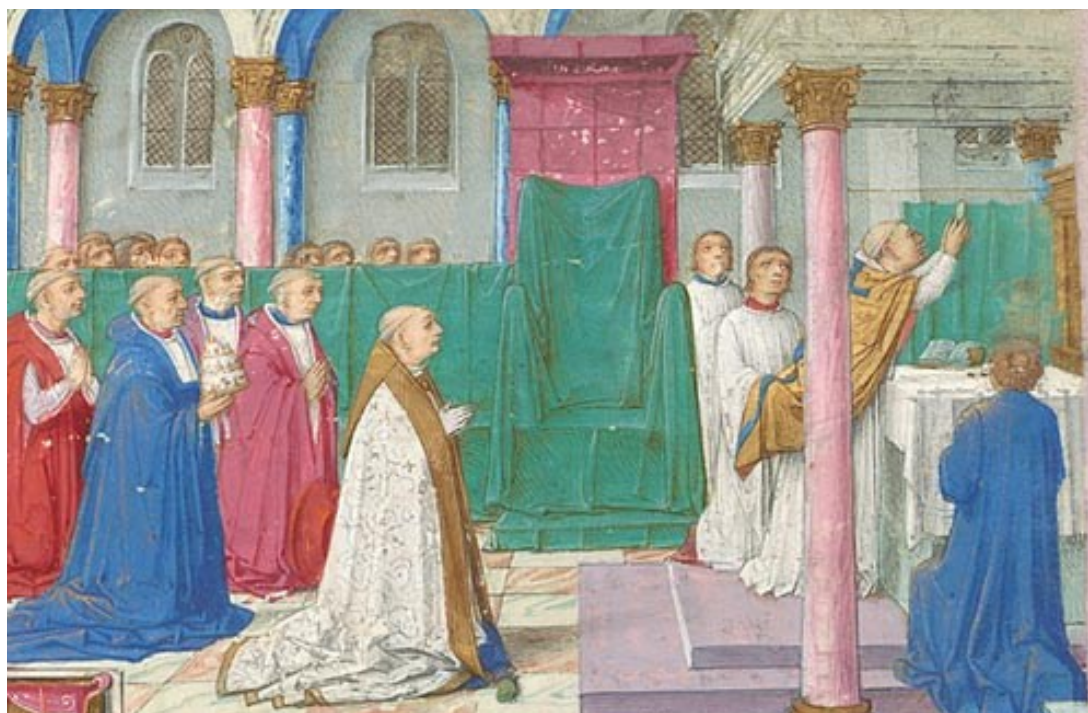
Elevation of the Eucharist—Master of the Della Rovere Missal, 1485

97 Shady Lane, PO Box 1061, Ross, CA 94957