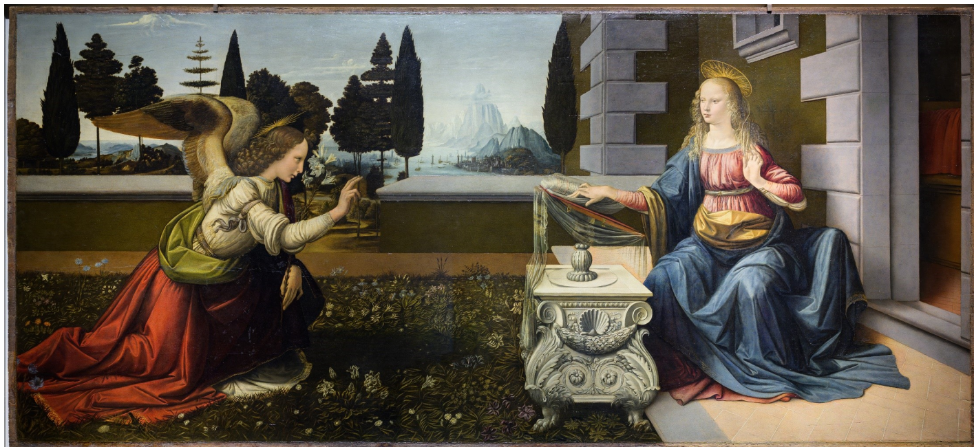
The Annunciation—Leonardo da Vinci , 1476

November 30, 2025 First Sunday of Advent