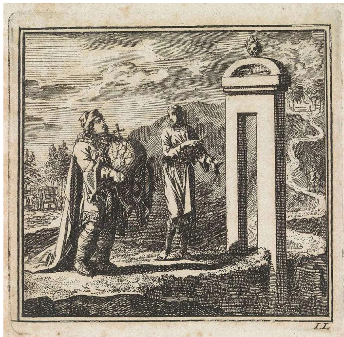
To Pass Through the Narrow Gate by Jan Luyken

August 24, 2025 Twenty-First Sunday in Ordinary Time