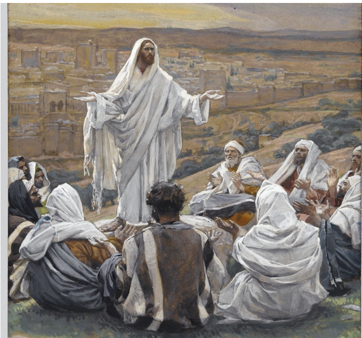
The Lord's Prayer by James Tissot

97 Shady Lane, PO Box 1061, Ross, CA 94957