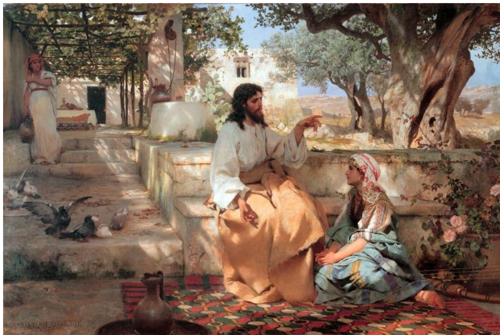
Christ With Martha and Maria by Henryk Siemiradzki

97 Shady Lane, PO Box 1061, Ross, CA 94957