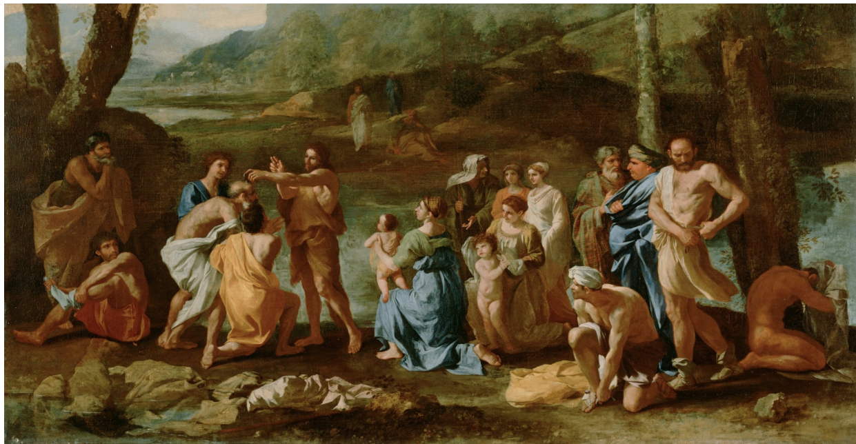
Saint John Baptizing in the River Jordan—Nicolas Poussin, 1630s

December 7, 2025 Second Sunday of Advent