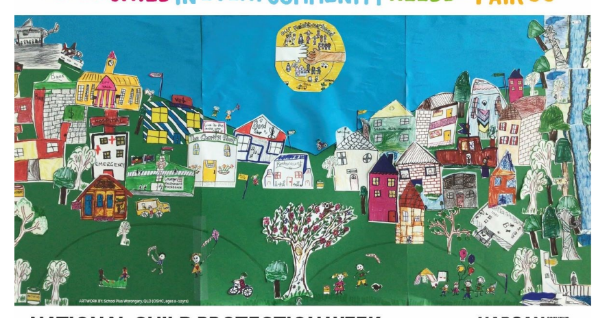
NATIONAL CHILD PROTECTION WEEK 5 - 11 September 2021