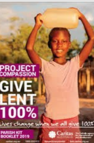
PROJECT COMPASSION GIVE LENT 100% Lives change when we all give 100% PARISH KIT BOOKLET 2019 Caritas AUSTRALIA