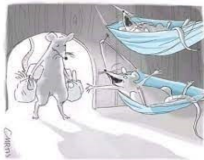
"FREE HAMMOCKS, all over town. It's like a miracle!"

St. Mary's Parish Pastoral Council is committed to inspiring, encouraging and supporting the St. Mary's parish community. One way in which you can communicate with us is through our 'Ask Mary' box. The 'Ask Mary' box enables parishioners to ask questions, put forward suggestions and to provide feedback. You are welcome to include your contact details on your submissions, or if you prefer, you may remain anonymous. All submissions are reviewed on a monthly basis and we, the parish pastoral council will respond to your submissions accordingly.